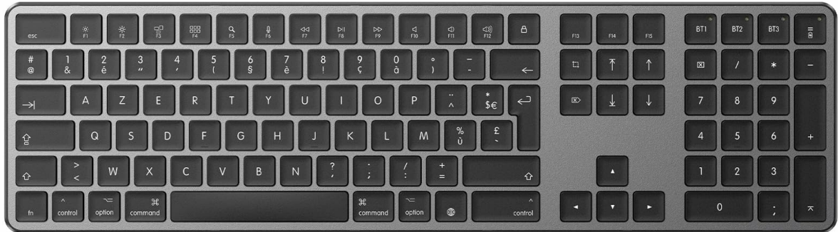
Image: OMOTON Bluetooth Keyboard, a full-size keyboard with a numeric keypad, designed for Mac devices.