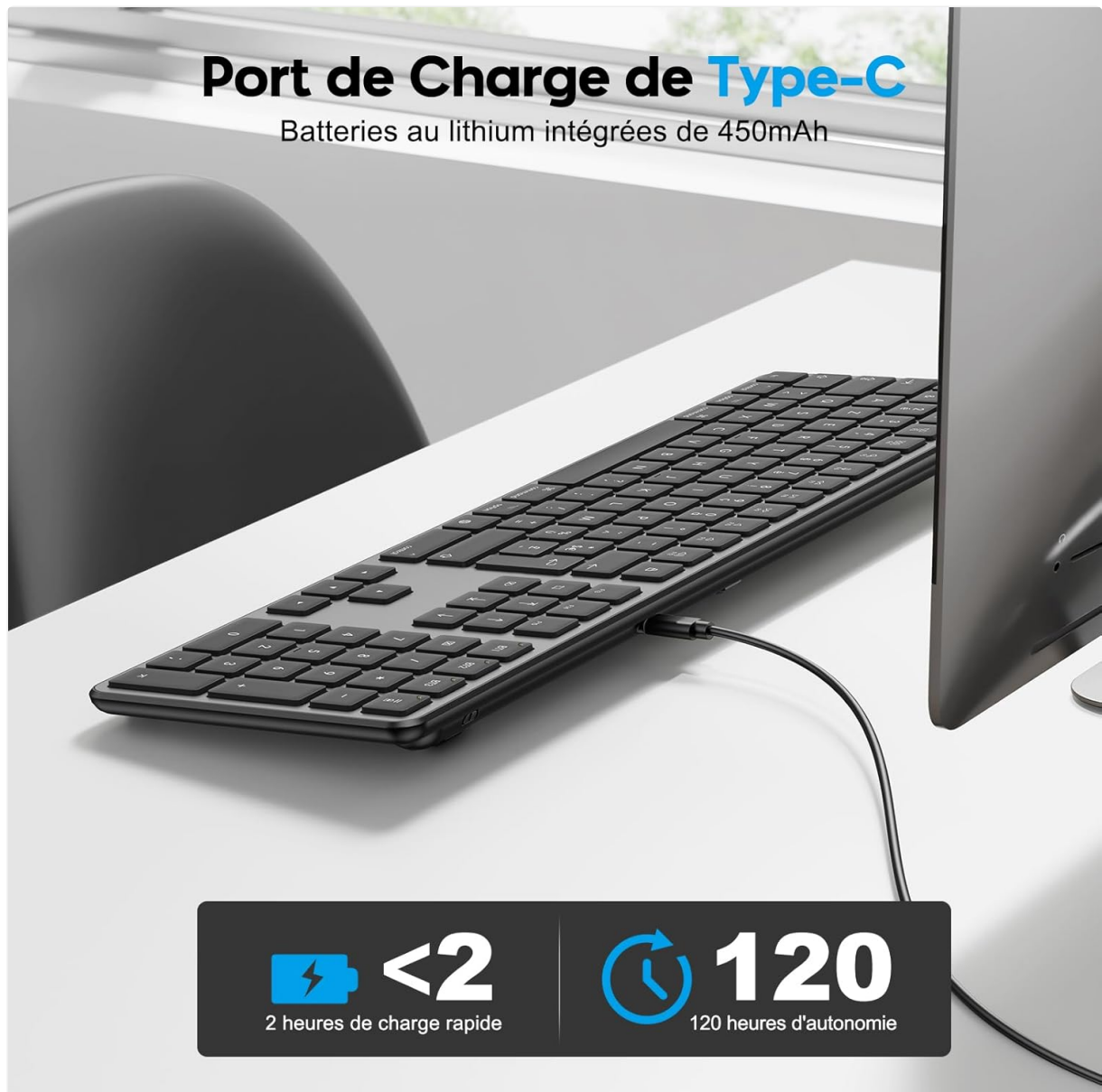
Image: The OMOTON keyboard connected via its Type-C charging port, illustrating the charging process and battery life.