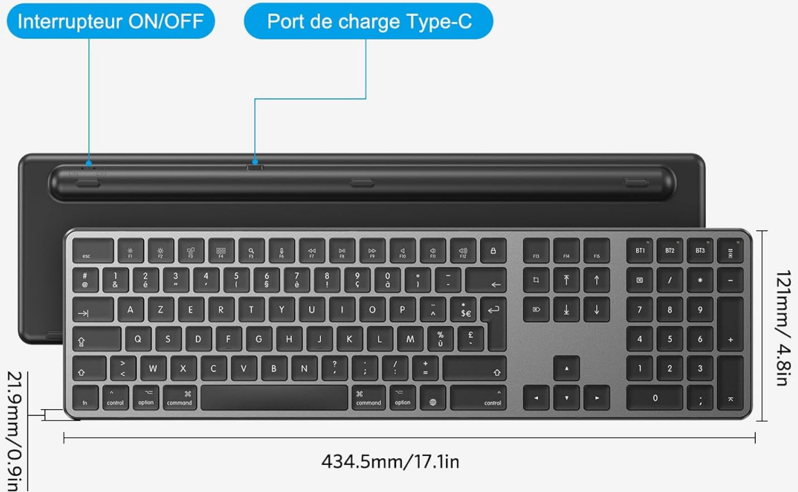
Image: Technical drawing showing the dimensions of the OMOTON keyboard: 434.5mm (17.1in) length and 121mm (4.8in) width, with a thickness of 21.9mm (0.9in).