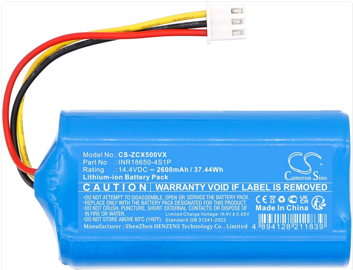
Image: Side view of the battery displaying important safety warnings and product specifications.