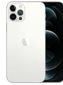
iPhone 12 Series