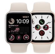
Apple Watch SE