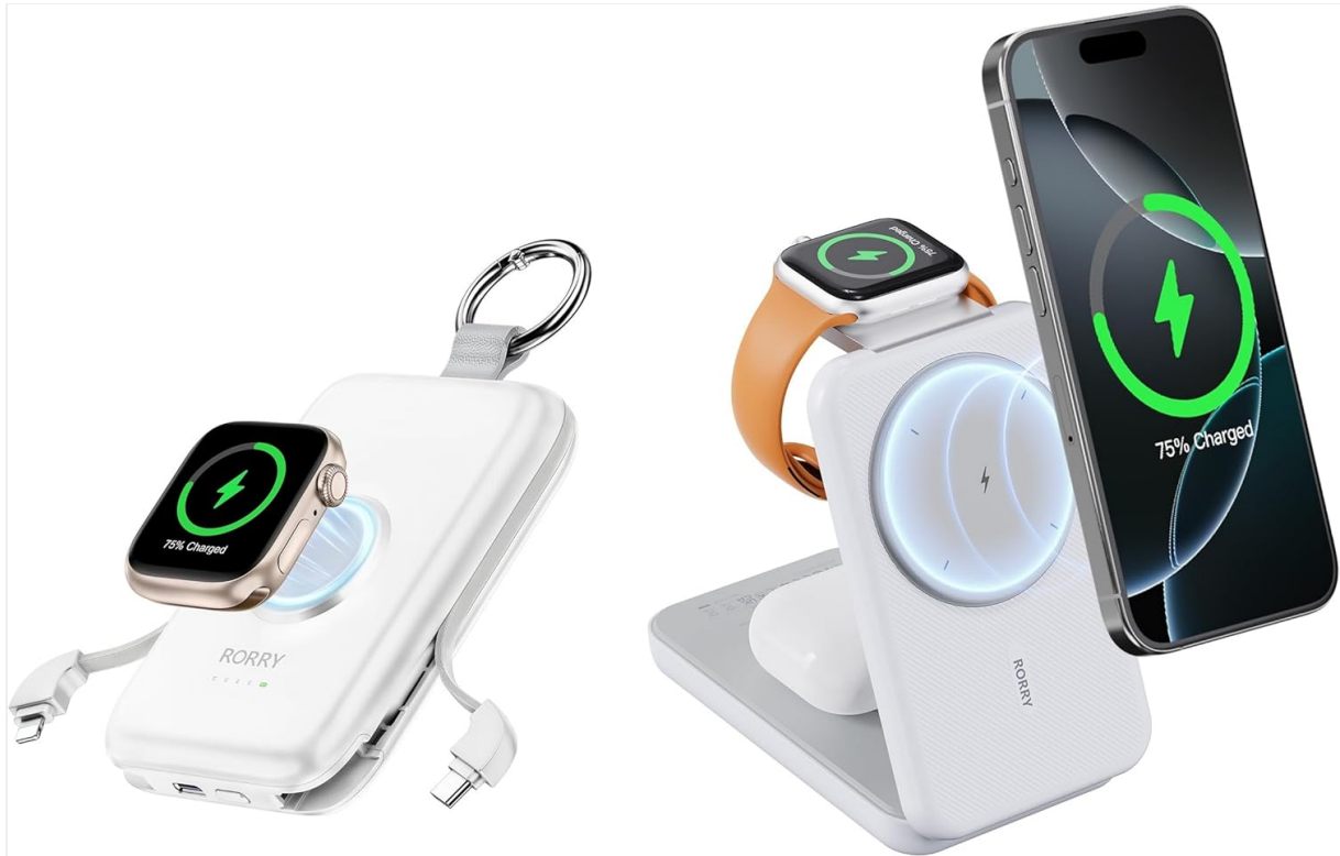
Image 2.1: The RORRY 3-in-1 Portable Charger shown in both its compact power bank form and as a folded charging station, demonstrating its versatility for charging an iPhone and Apple Watch.