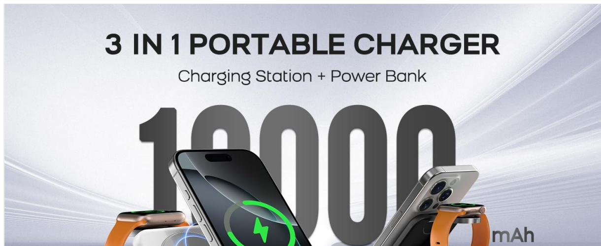
Image 5.1: A visual guide illustrating the wide range of compatible devices, including various iPhone models, Apple Watch series, and AirPods, for both the portable charger and the charging station modes.