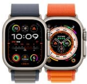
Apple Watch Ultra 1-2