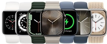
Apple Watch Series 3-10