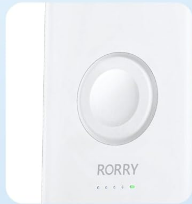
Charger for iWatch