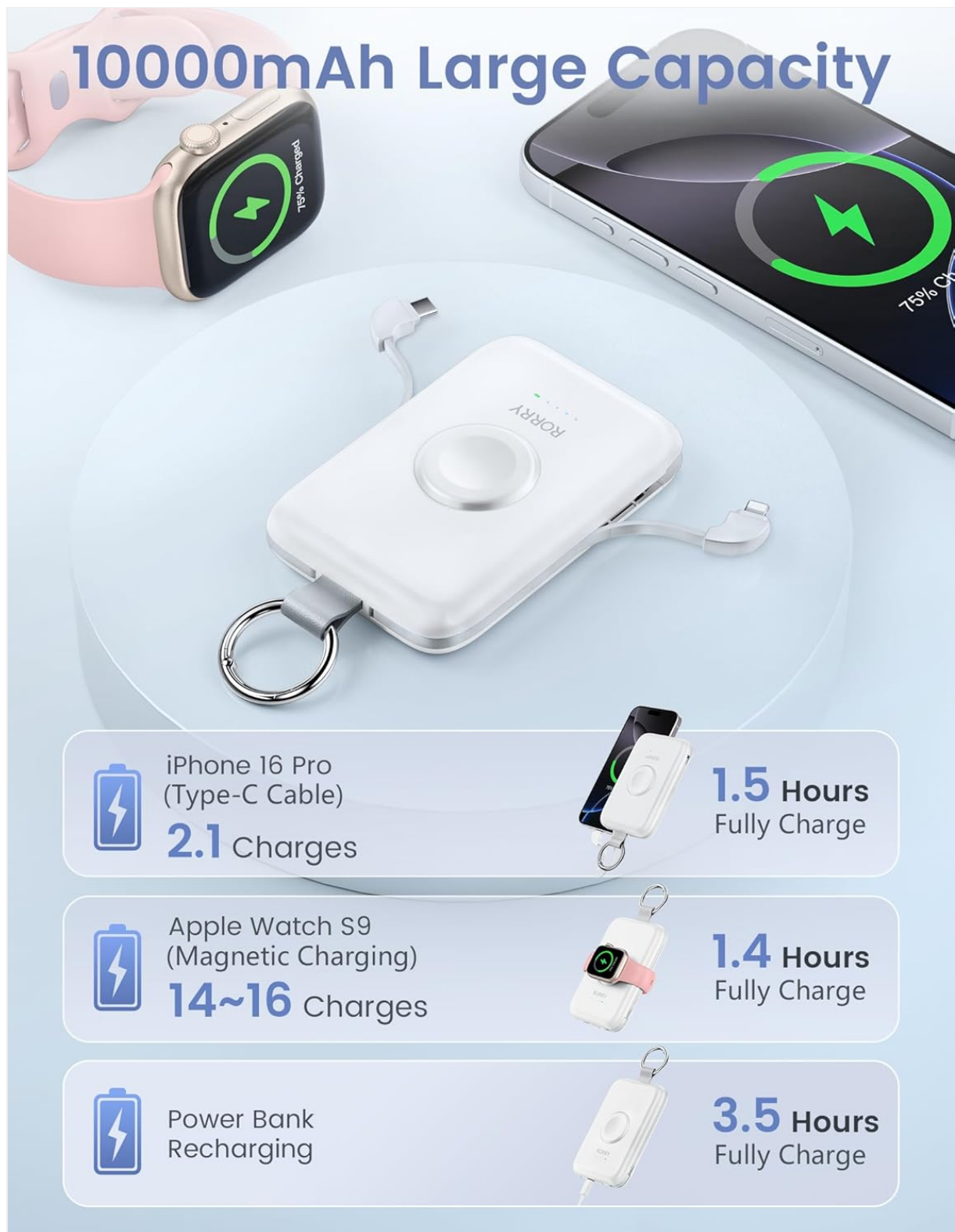
Image 4.2: The RORRY portable charger connected to multiple devices, including an iPhone and an Apple Watch, illustrating its capacity to charge several gadgets simultaneously.