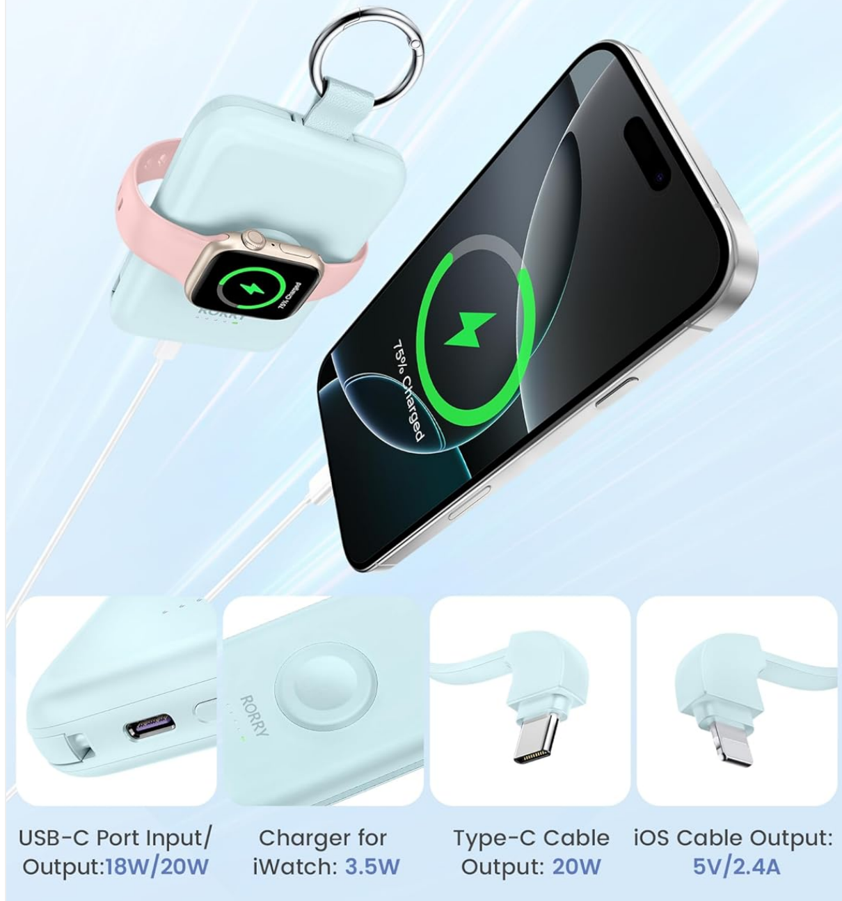
Image 4.1: The RORRY portable charger simultaneously charging an Apple Watch via its magnetic pad and an iPhone via its built-in cable, demonstrating multi-device charging capability.