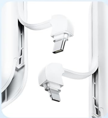
Built-in C/L Cable