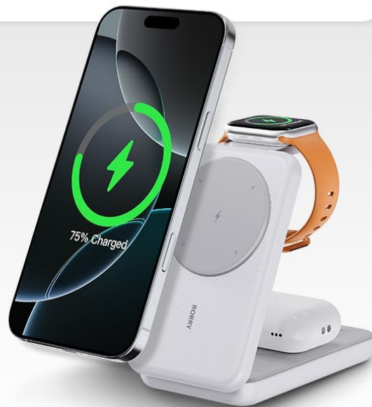
Image 4.4: The RORRY 3-in-1 charging station actively charging an iPhone, Apple Watch, and AirPods simultaneously, showcasing its multi-device charging capabilities in a desktop setup.