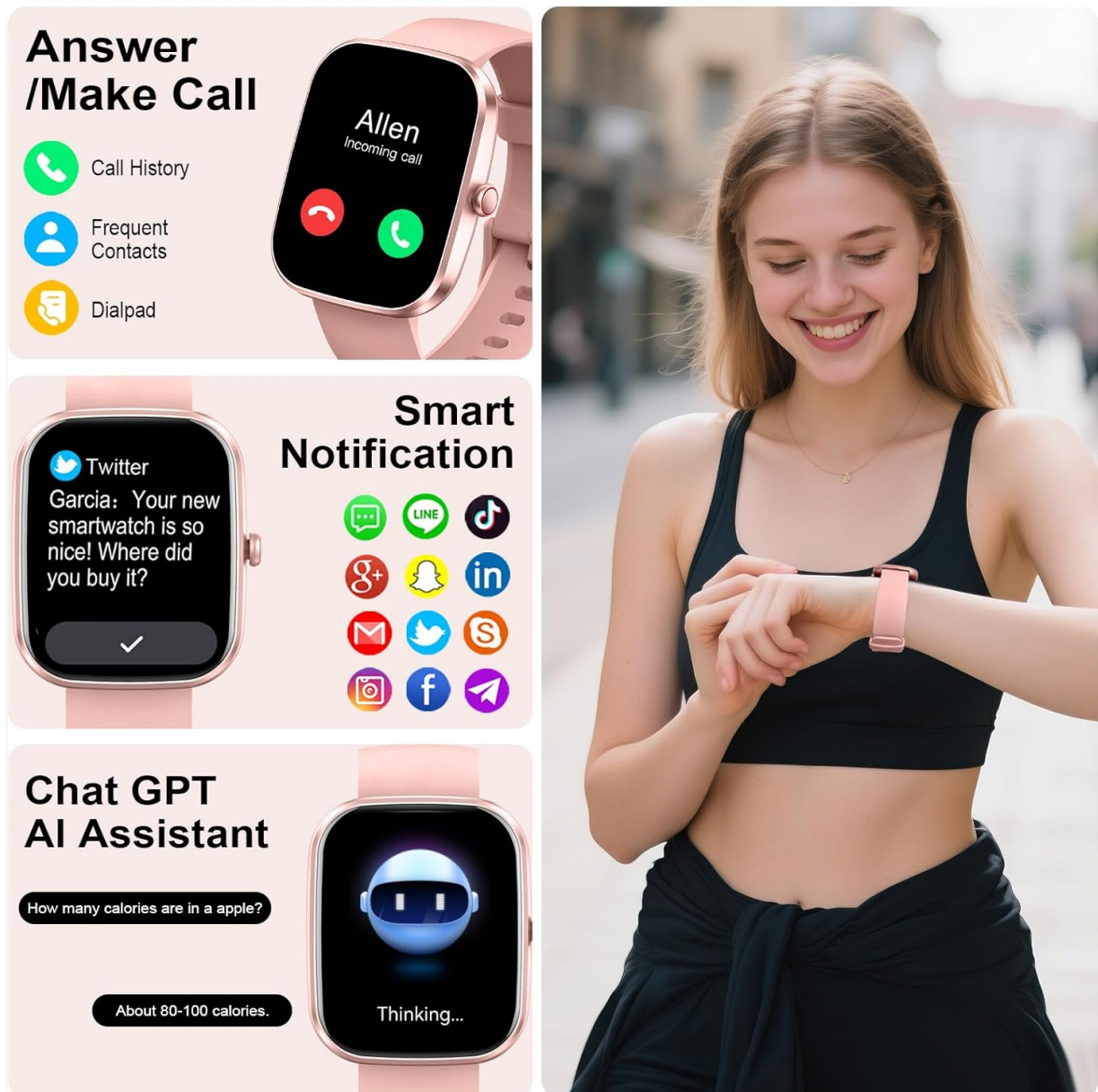
Image: Bluetooth Calling and Smart Notifications. This image illustrates the smartwatch's capability to handle incoming calls, display call history, and show notifications from various social media applications like Twitter, WhatsApp, and Instagram.