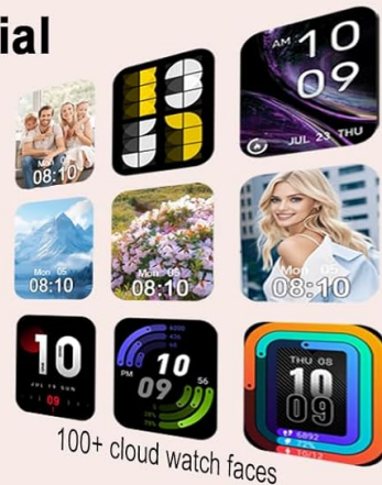
Image: 1.91" HD Touch Screen and AI Smartwatch. This image showcases the smartwatch's ability to generate custom watch faces using AI voice commands and allows users to customize watch dials with their own photos or choose from over 100 cloud watch faces.