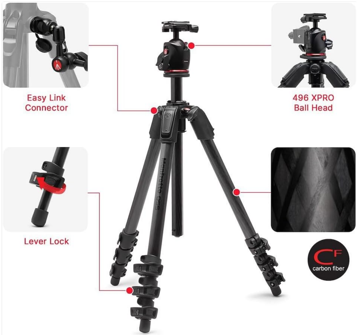
Image: Diagram highlighting key components such as the Easy Link Connector, Lever Lock, and the 496 XPRO Ball Head.