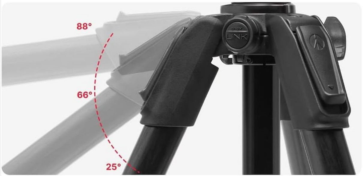
Image: Illustrations demonstrating the 90-degree central column mechanism and the adjustable leg angles (25°, 66°, 88°).