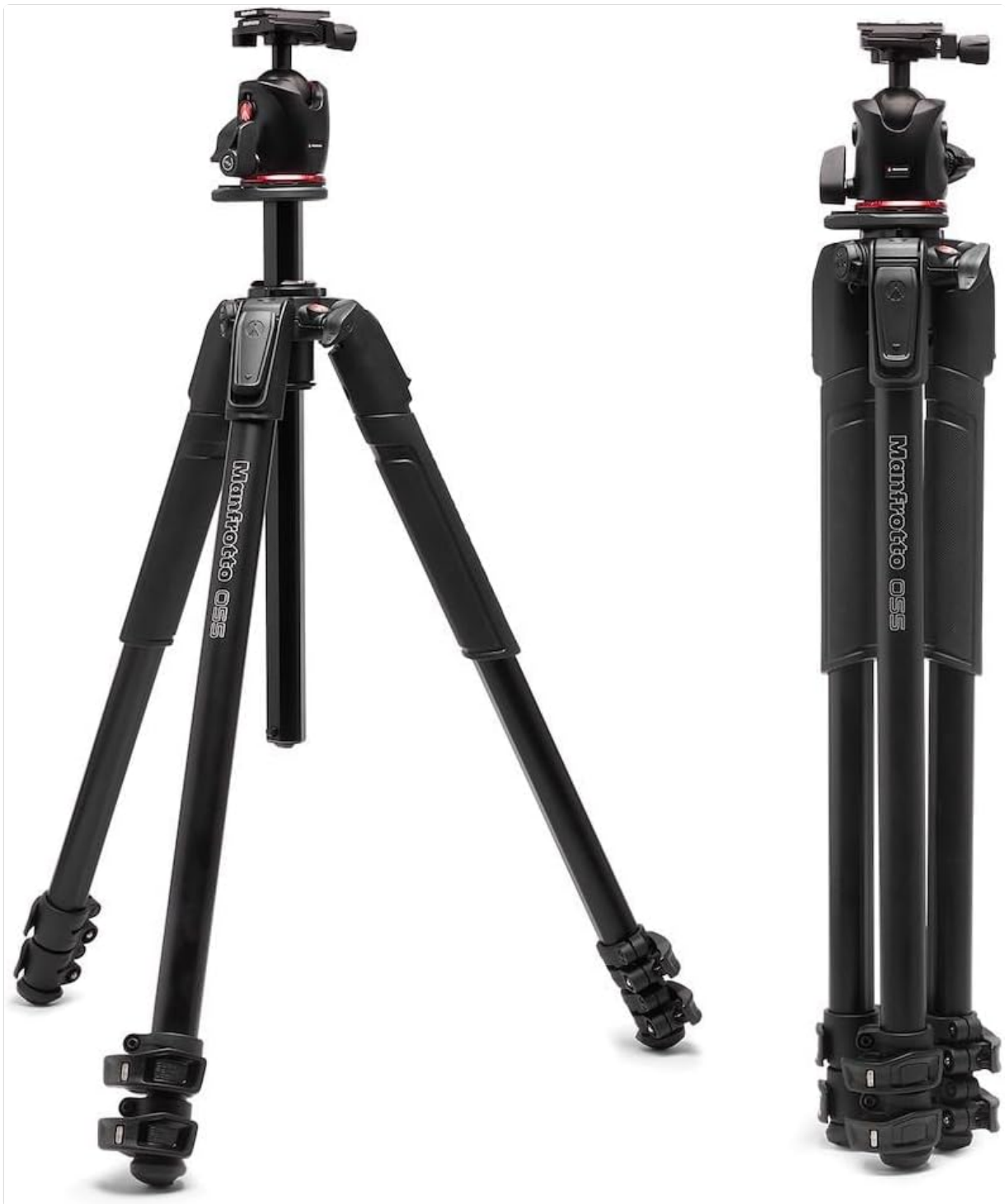
Image: The Manfrotto 055XPRO AS Camera Tripod shown in both folded and extended configurations, featuring the XPRO Ball Head.