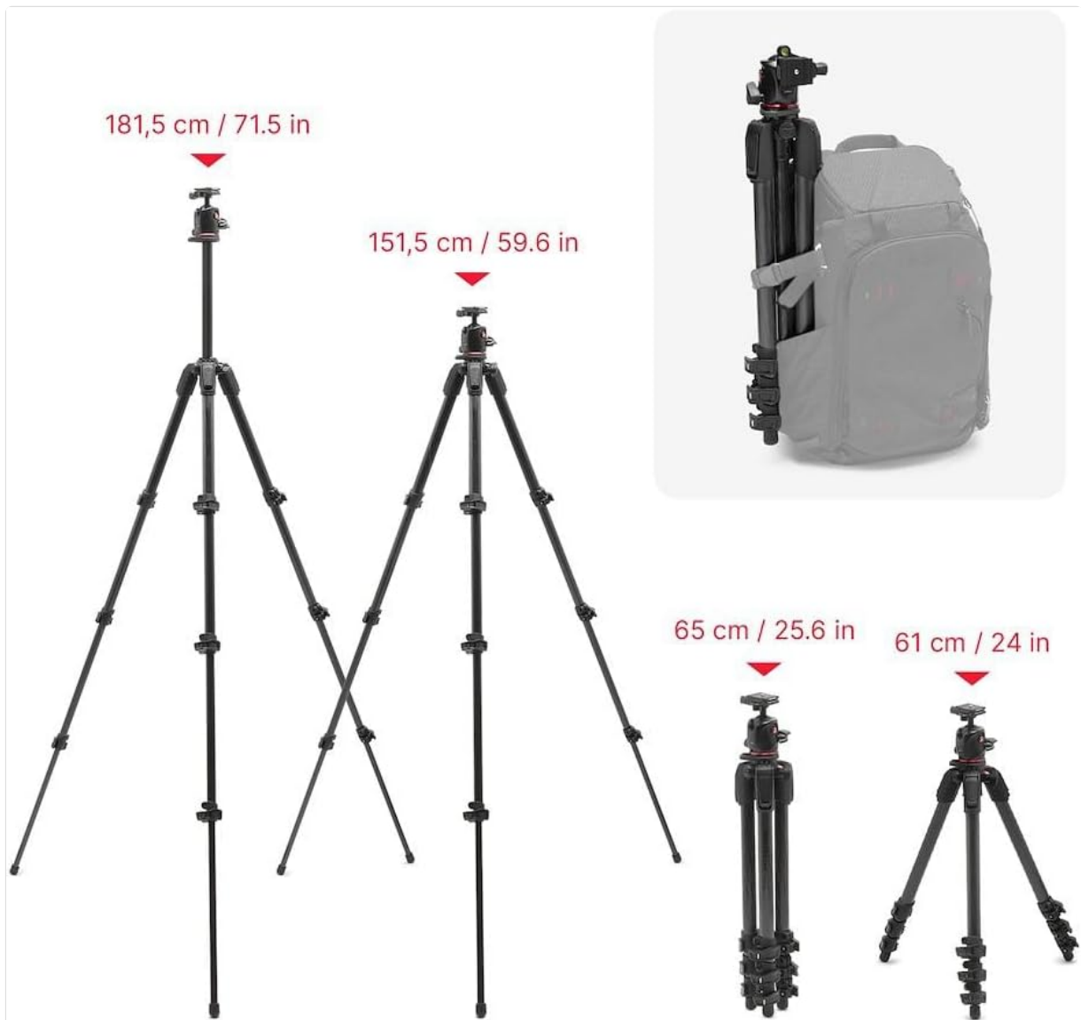
Image: Visual representation of the tripod's dimensions, including maximum height, folded length, and packed size.