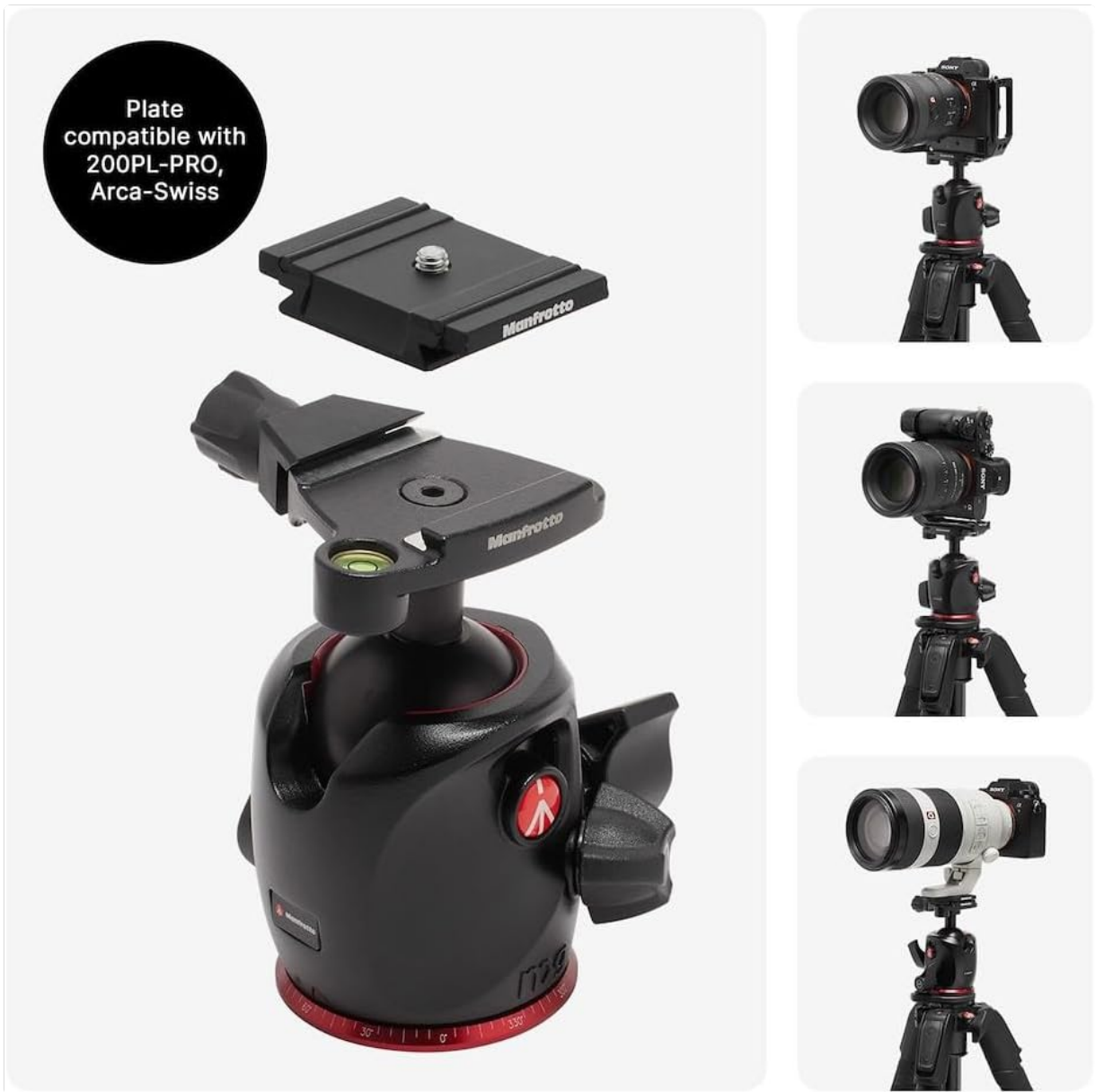
Image: Close-up view of the XPRO Ball Head with the 200PL-PRO Arca-Swiss compatible plate, demonstrating camera mounting.