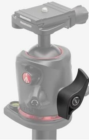
Image: Detailed view of the XPRO Ball Head's independent friction control, panoramic knob, and main sphere break lever.