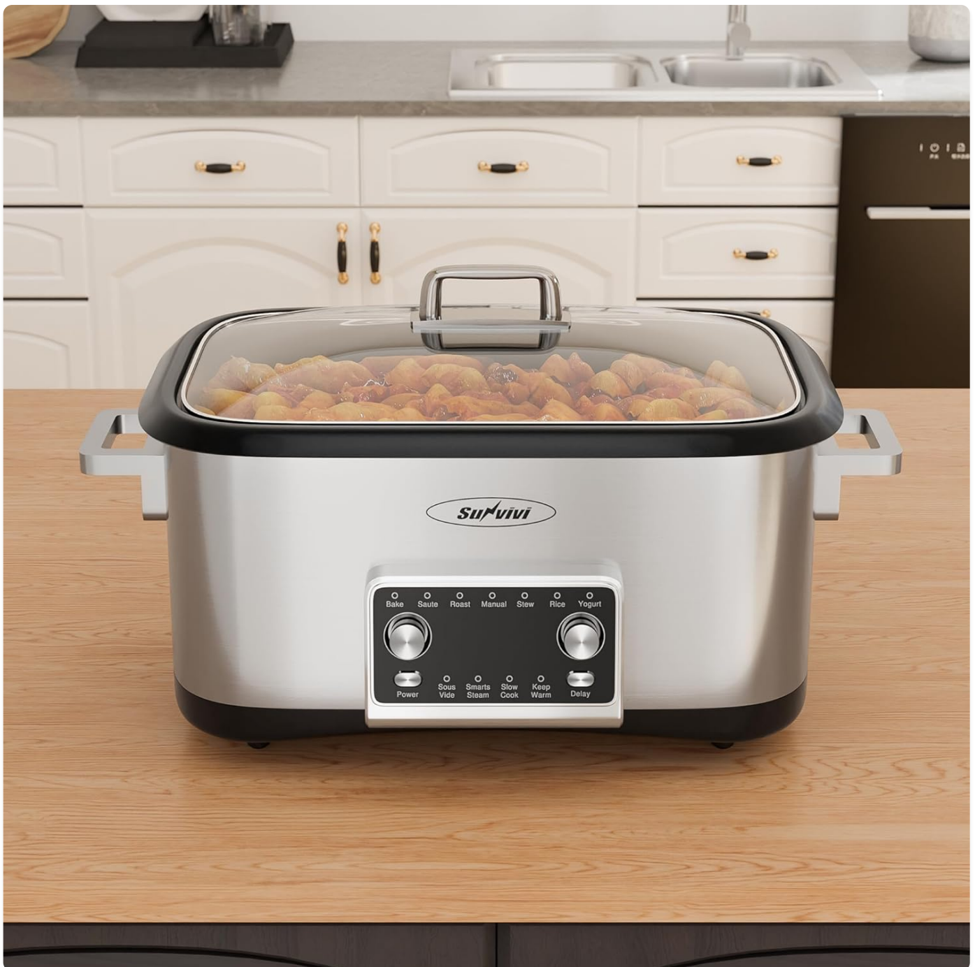
Image: The SUNVIVIPRO slow cooker positioned on a clean kitchen counter, ready for initial setup and use.