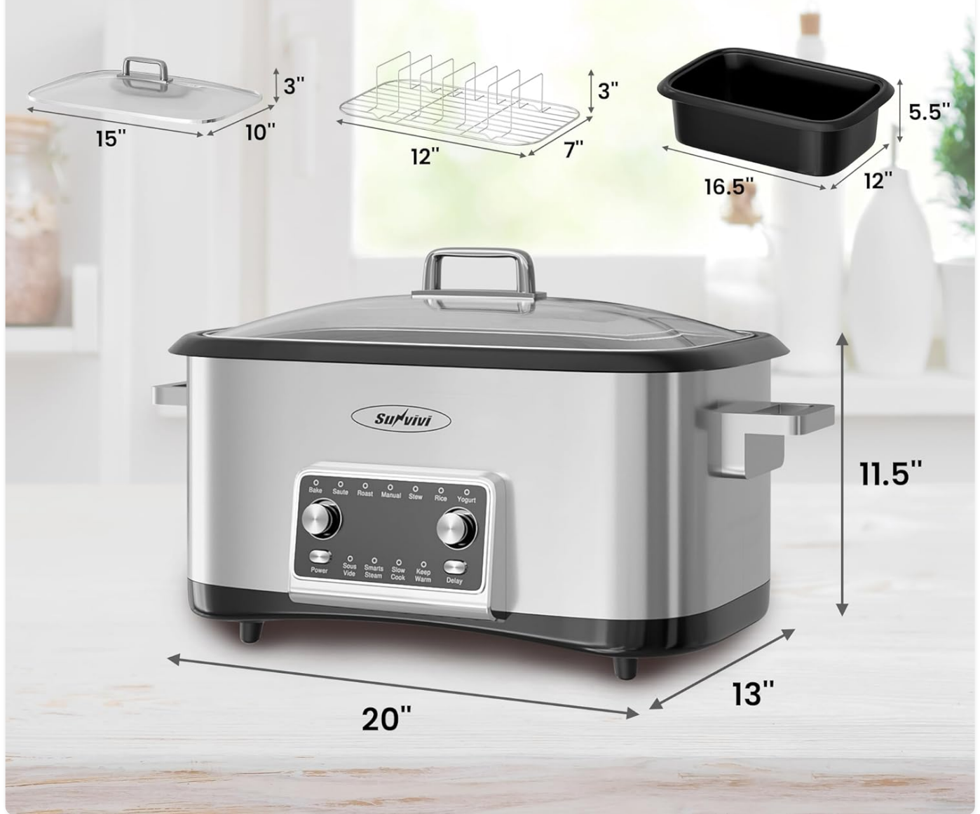
Image: A technical diagram illustrating the overall dimensions of the SUNVIVIPRO slow cooker, including the main unit, lid, and steam rack.