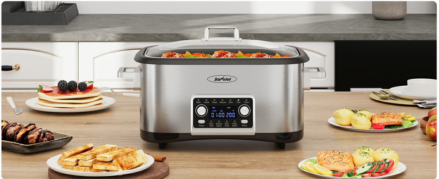
Image: The SUNVIVIPRO 12-in-1 Programmable 8 Quart Slow Cooker displayed on a kitchen counter, showcasing its sleek design and large capacity, surrounded by prepared meals.

This manual provides essential information for the safe and efficient operation of your SUNVIVIPRO 12-in-1 Programmable 8 Quart Slow Cooker. This versatile appliance is designed to simplify your cooking process with multiple functions, offering convenience and flexibility in your kitchen.