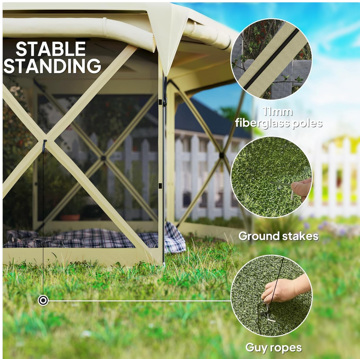
Figure 3.2: Securing the gazebo using fiberglass poles, ground stakes, and guy ropes.