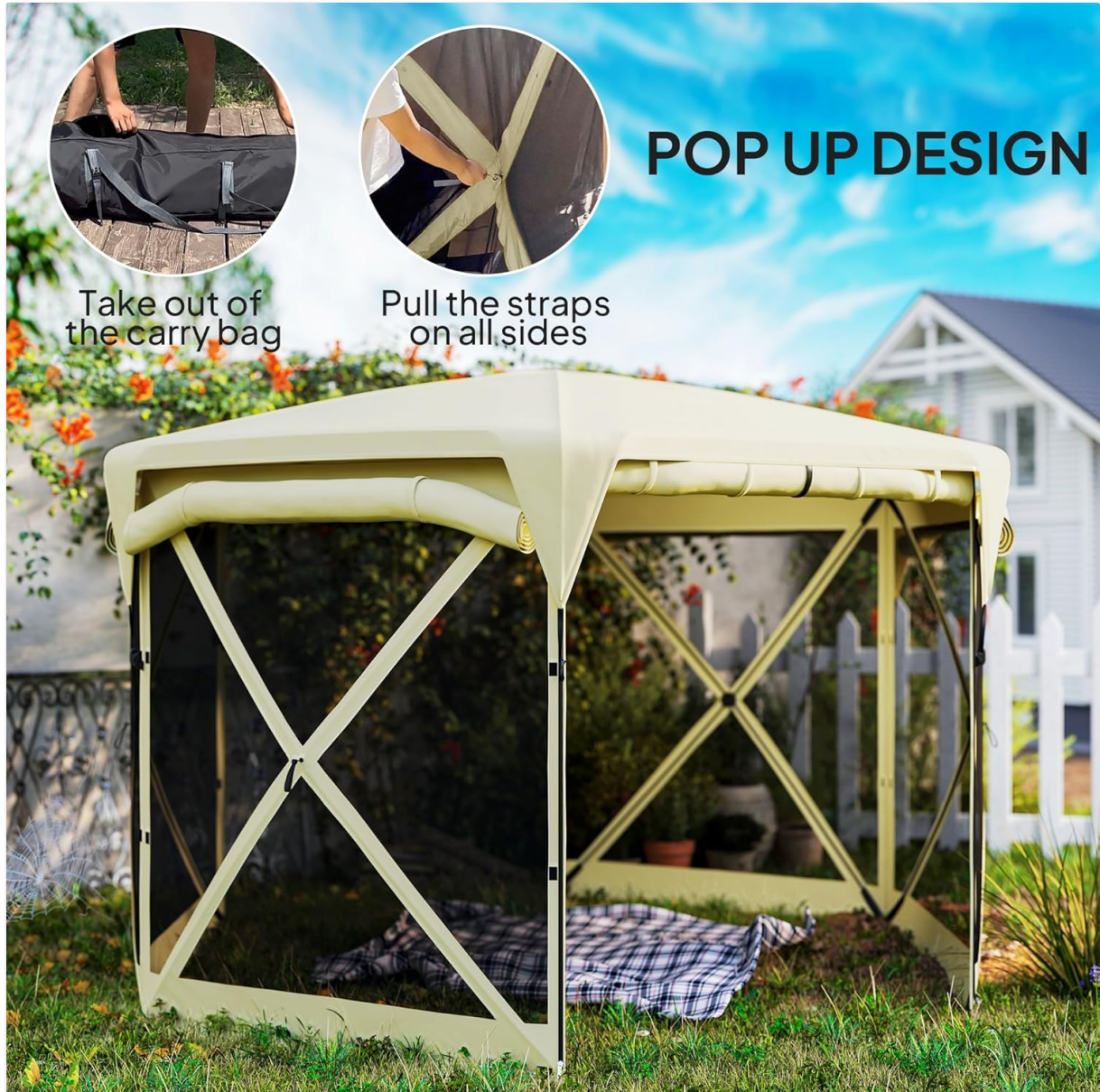
Figure 3.1: Initial setup steps, showing removal from carry bag and pulling side straps.