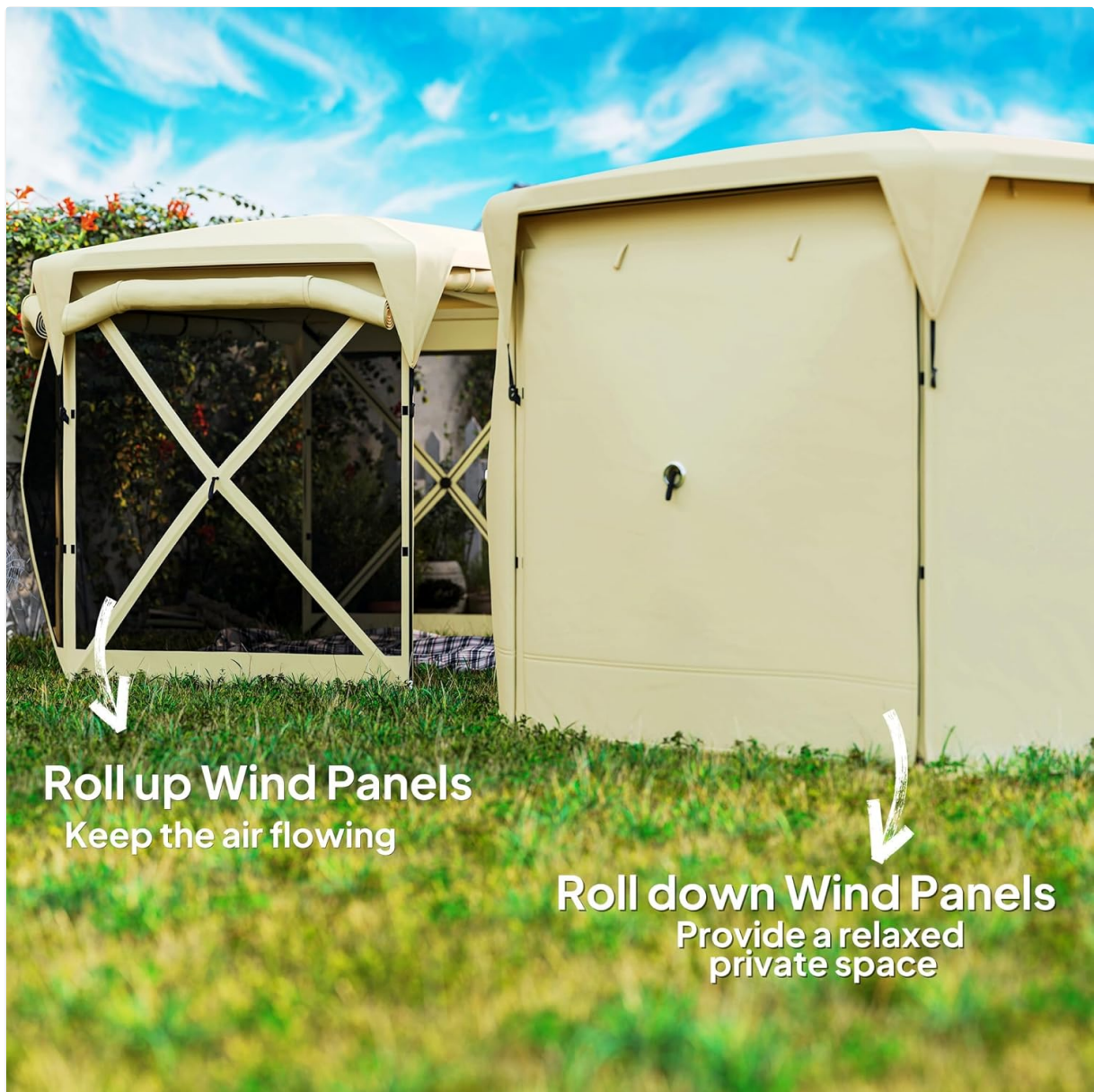
Figure 4.2: Using roll-up and roll-down wind panels for airflow or privacy.

Note: Two doors are included for easy access. These doors do not include mesh sidewalls.