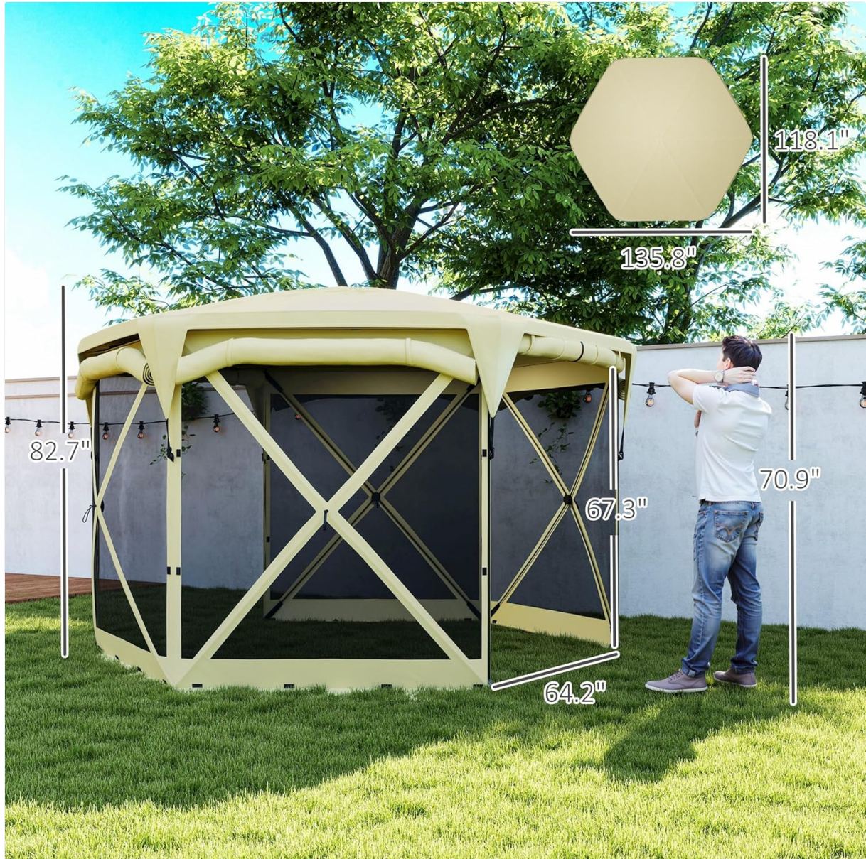
Figure 7.1: Gazebo dimensions overview.

Detailed product information for your Outsunny Pop Up Gazebo Screen Tent House.