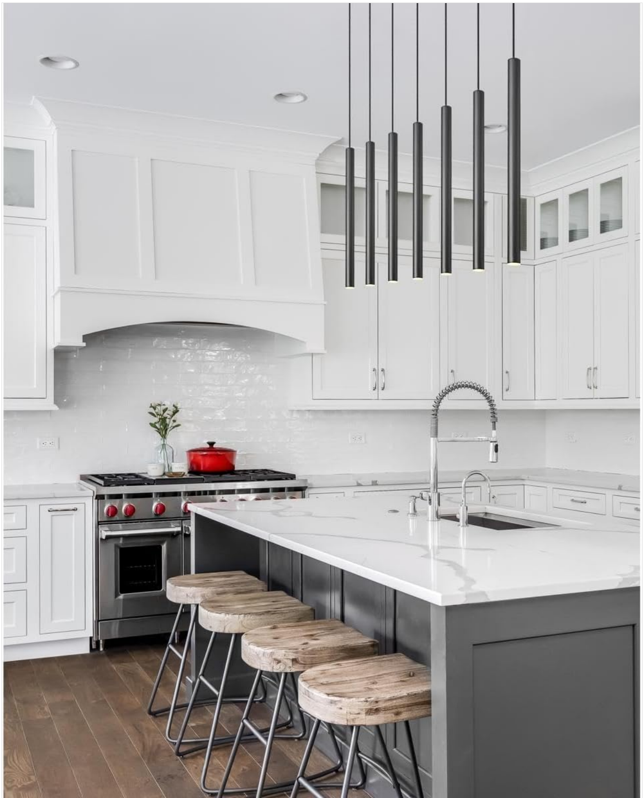
Figure 2: Chandelier installed in a kitchen, demonstrating its linear design over an island.