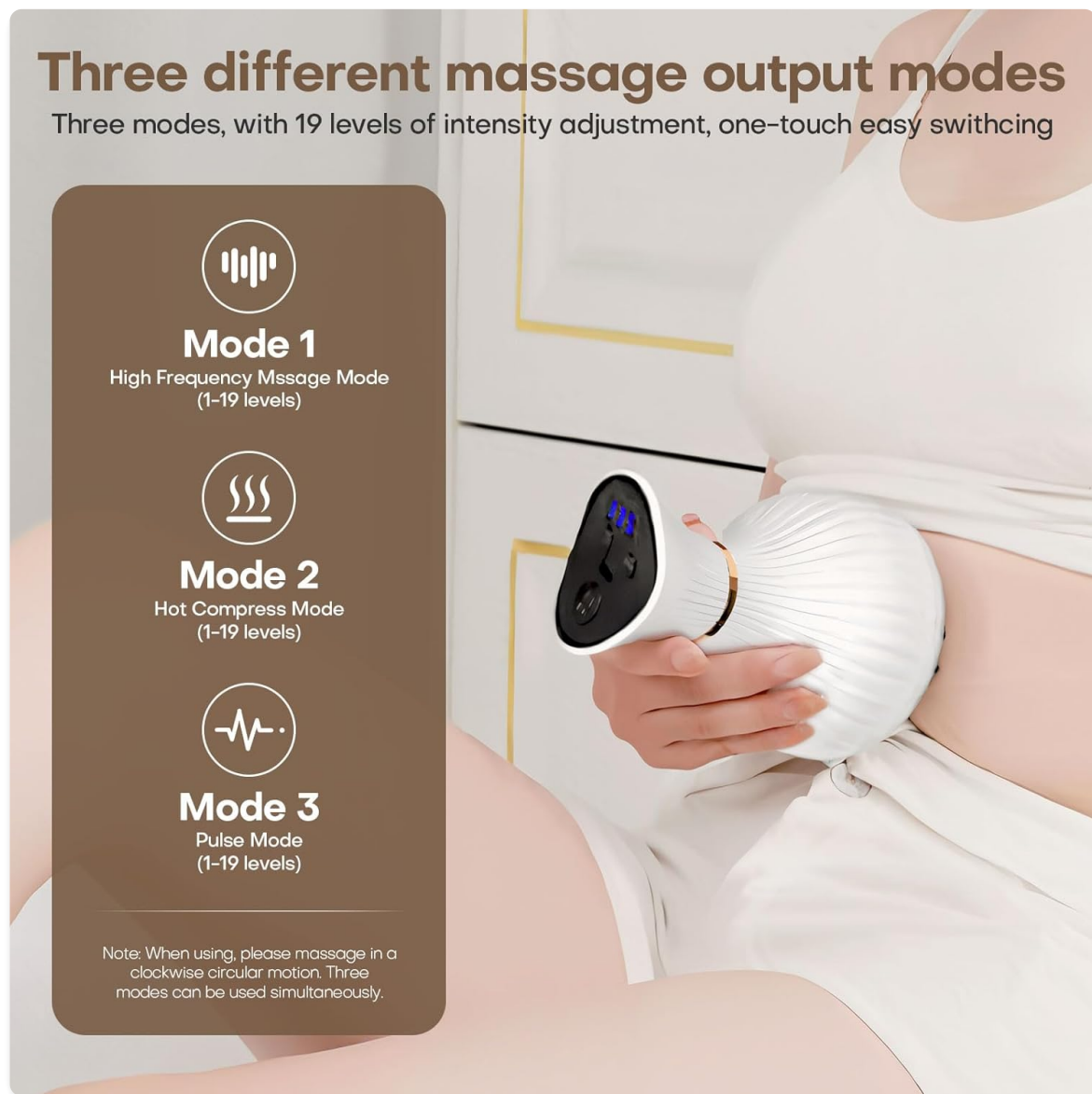
Figure 3: The massager's three output modes, each with 1-19 intensity levels, can be used individually or combined. Massage in a clockwise circular motion when using.

Three modes, with 19 levels of intensity adjustment, one-touch easy switching