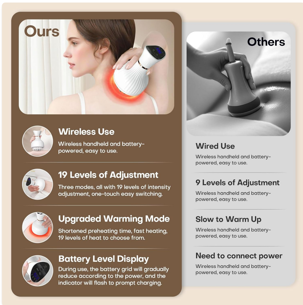
Figure 1: Overview of the 4-in-1 Leg Massager's key features, including wireless use, 19 levels of adjustment, upgraded warming mode, and battery level display, highlighting its advantages.