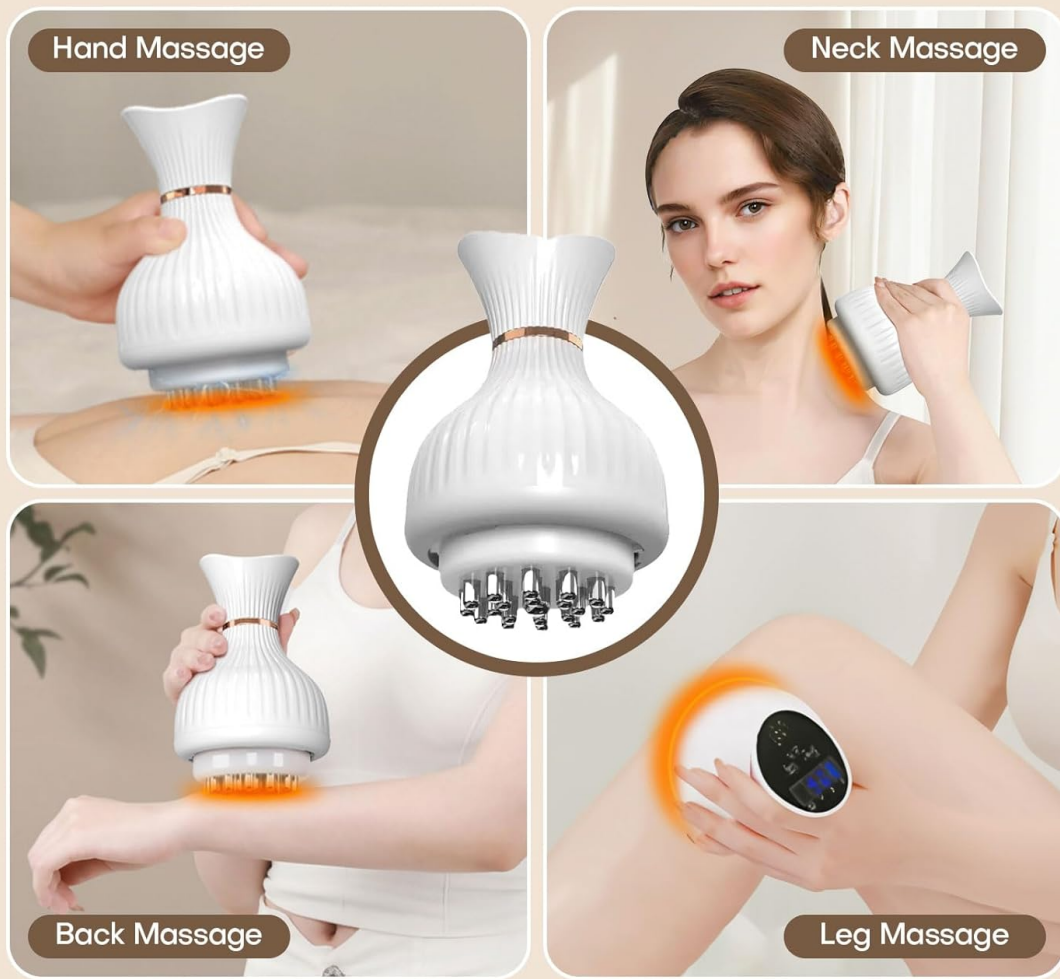
Figure 6: The massager's versatility allows for use on multiple body parts, including hands, neck, back, and legs, to release stress and promote daily relaxation.

Release the stress of your whole body and feel relaxed everyday.