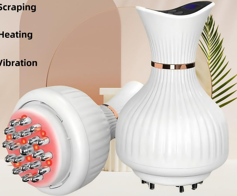
Figure 2: Visual representation of the massager's four core functions: Massage, Scraping, Heating, and Vibration, indicating its multi-purpose design.