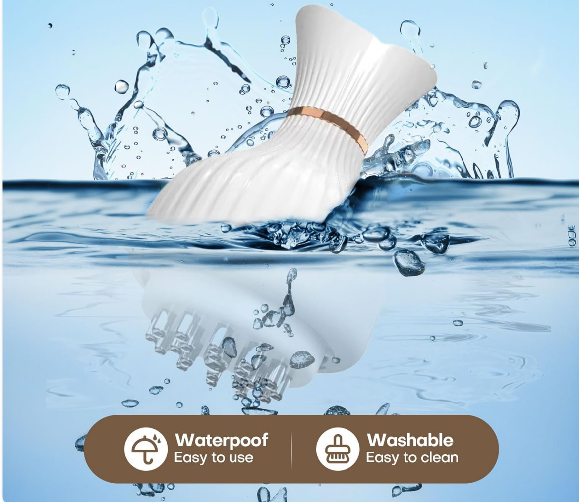
Figure 8: The massager features a waterproof and washable brush head, allowing for quick, convenient, and hygienic cleaning after use.

Waterproof brush head, quick cleaning, convenient and hygienic.