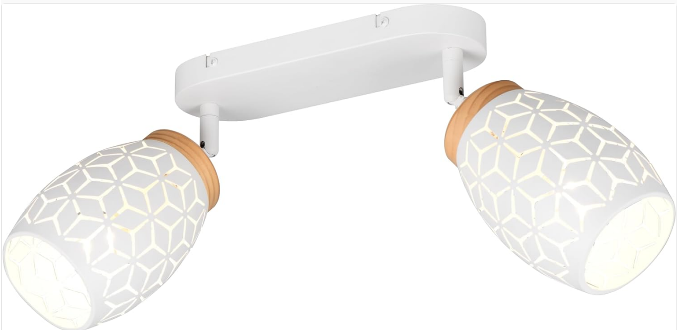
Image 1.1: Front view of the Reality Leuchten Bidar R81572031 Spotlight Bar.

Thank you for purchasing the Reality Leuchten Bidar R81572031 Spotlight Bar. This 2-bulb spotlight bar features a matte white metal finish with natural wood accents, designed to provide versatile lighting for your indoor spaces. The spotlights can be rotated and swiveled, allowing you to direct light precisely where needed. This manual provides essential information for safe installation, operation, and maintenance of your new lighting fixture.