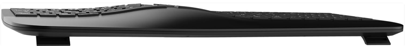
Figure 4: Side view illustrating the ergonomic wave design.