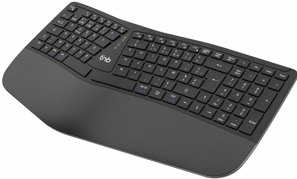
Figure 1: Top view of the T'nB KBWARGO Ergonomic Wireless Keyboard.