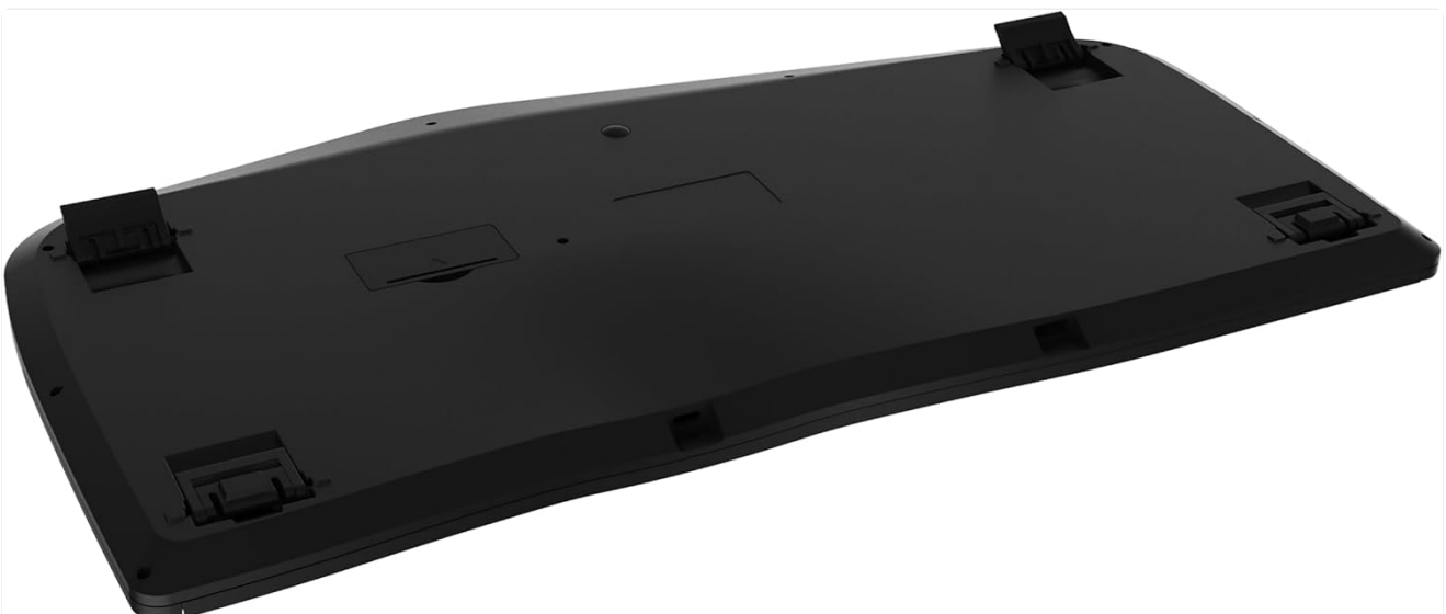
Figure 2: Underside view of the keyboard, highlighting the adjustable feet.