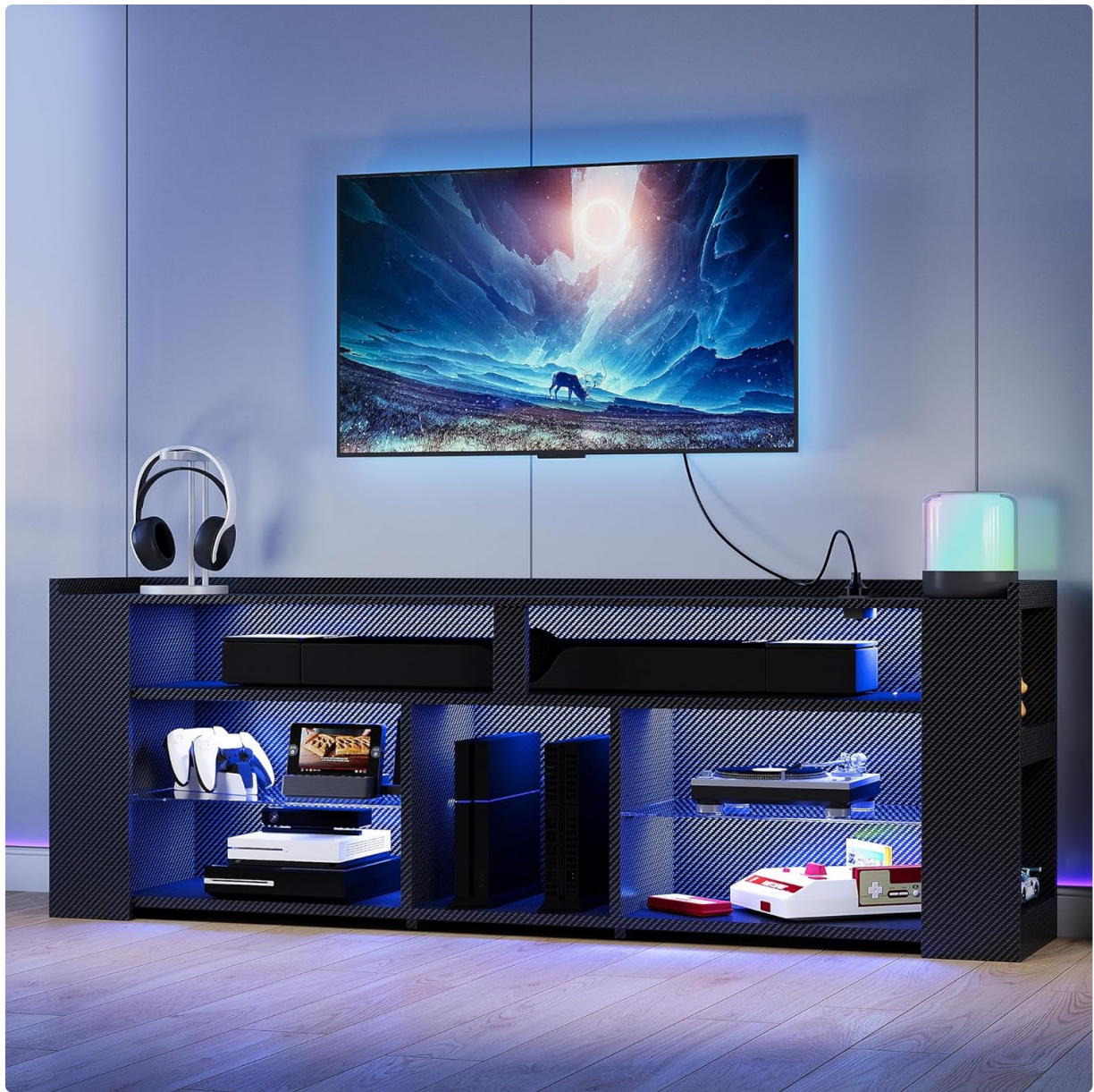
The IRONCK Entertainment Center, fully assembled and illuminated with blue LED lights, showcasing its storage capabilities for a television, gaming consoles, and other media equipment.