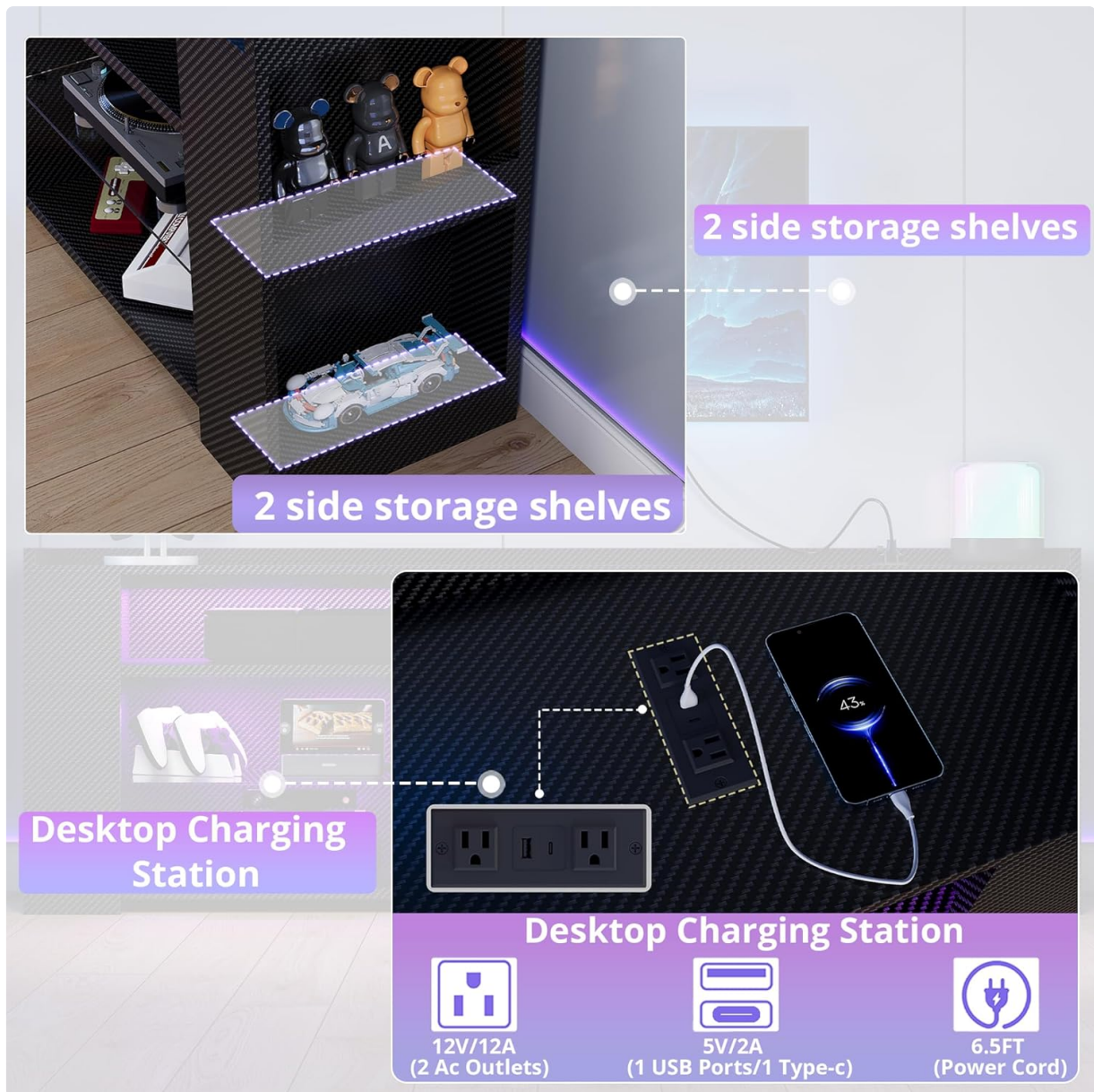
A detailed view of the integrated charging station, illustrating its various power and USB ports.

Your browser does not support the video tag.