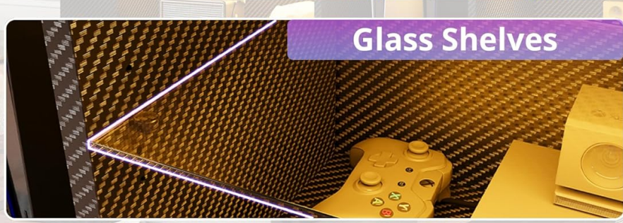
Detailed views of the adjustable shelves, open design for larger items, and the transparent glass shelves.