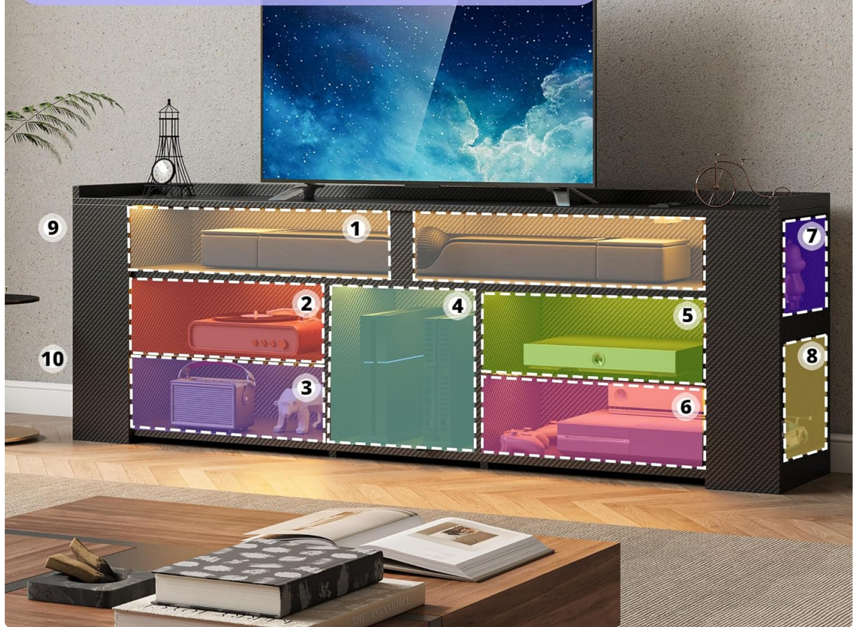
An overview of the entertainment center's storage capacity, showing 9 distinct shelves for organizing various items.