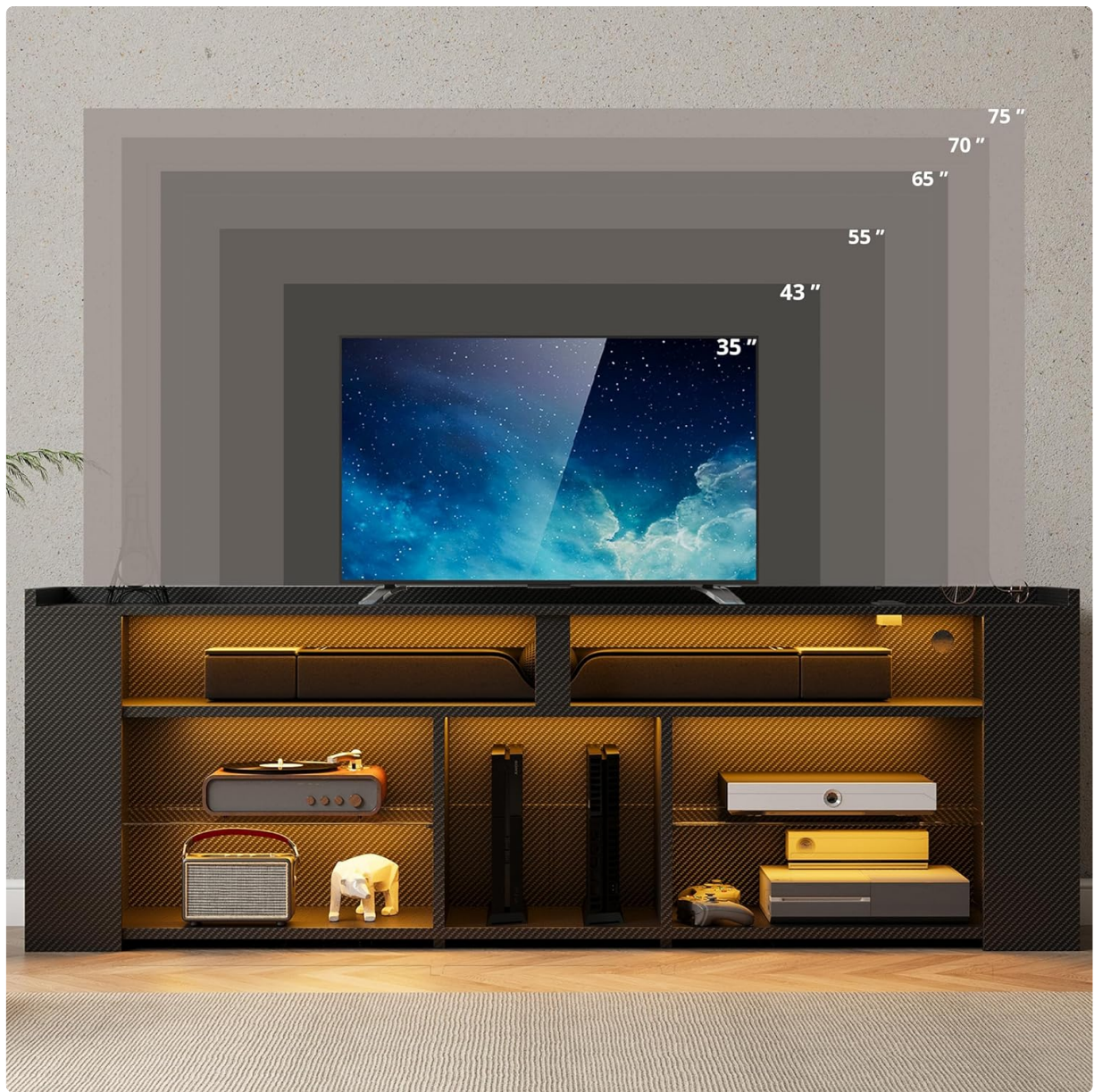
Visual representation of TV size compatibility, demonstrating how different TV sizes fit on the 70.9-inch entertainment center.