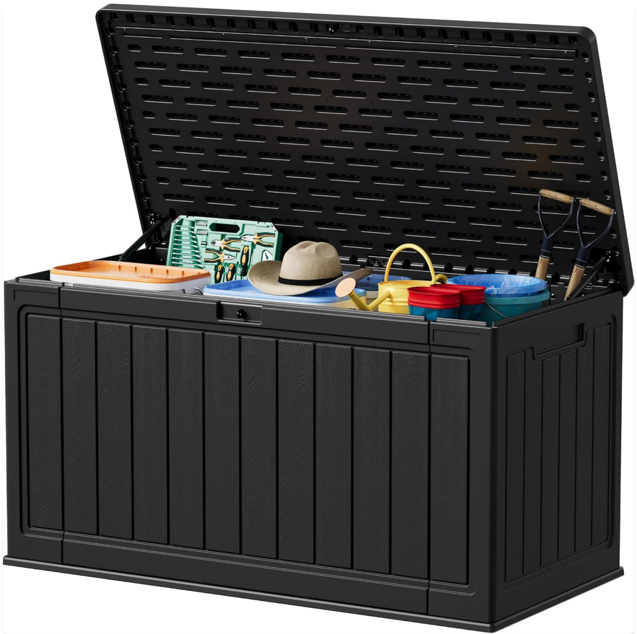
Image 1.1: The Devoko 160 Gallon Deck Box, shown open and filled with outdoor items, demonstrating its large storage capacity.