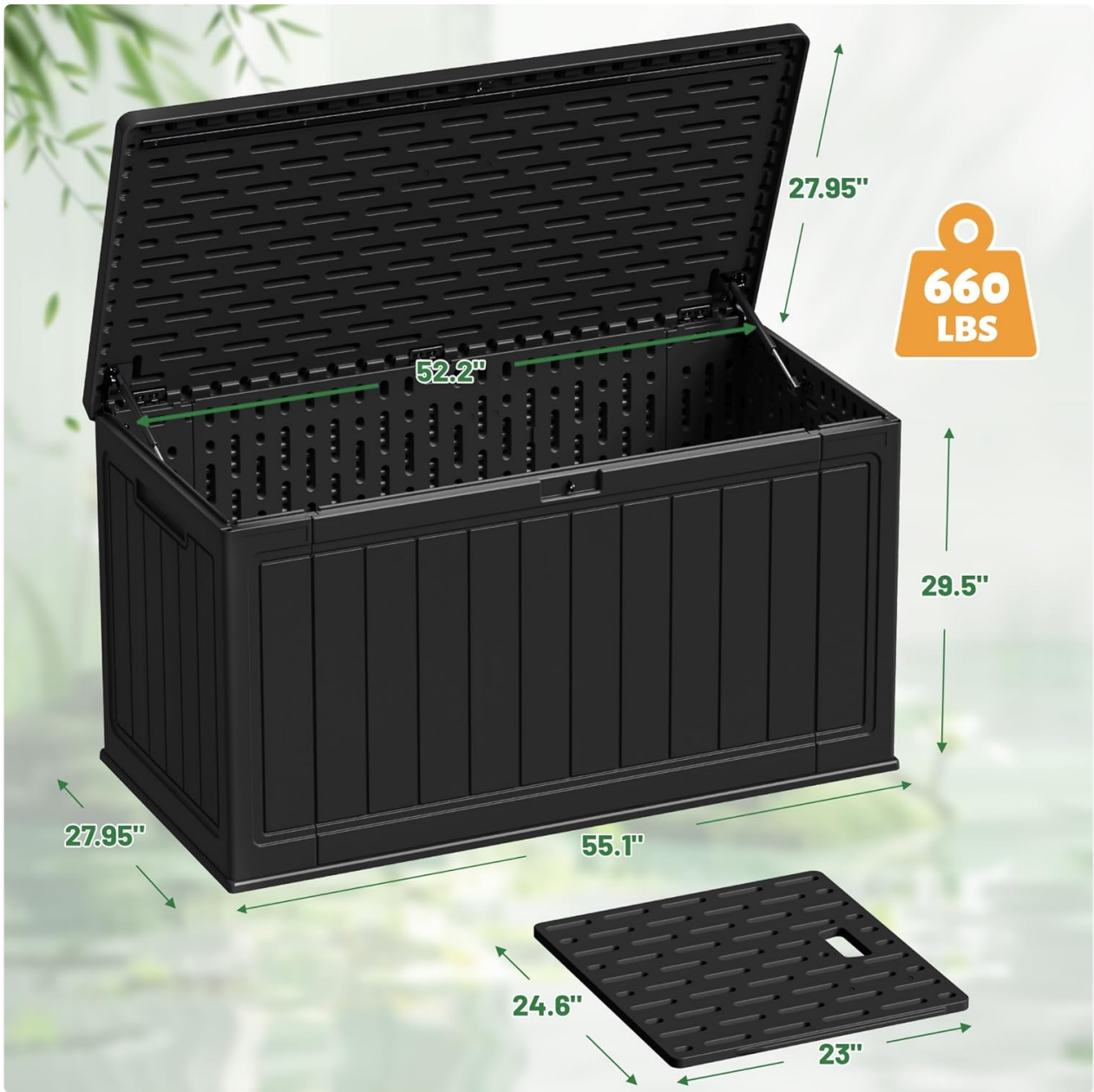
Image 7.1: A detailed diagram illustrating the external dimensions of the Devoko 160 Gallon Deck Box, including length, width, and height, along with the internal capacity.