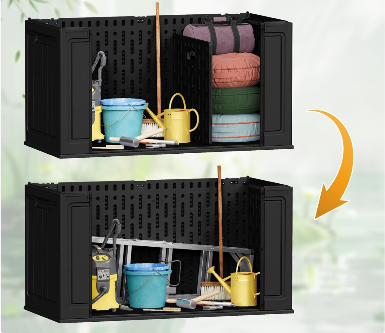
Image 2.2: Illustration of the removable divider, demonstrating how it can be used to create separate compartments for different types of items, or removed for larger storage needs.