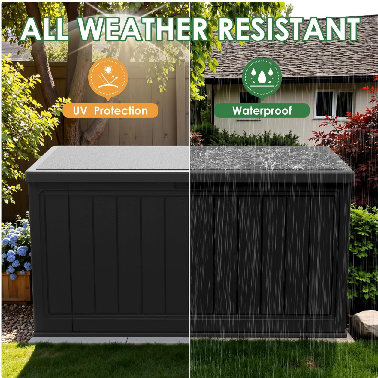
Image 2.4: Visual representation of the deck box's all-weather resistance, showcasing its UV protection and waterproof capabilities against sun and rain.