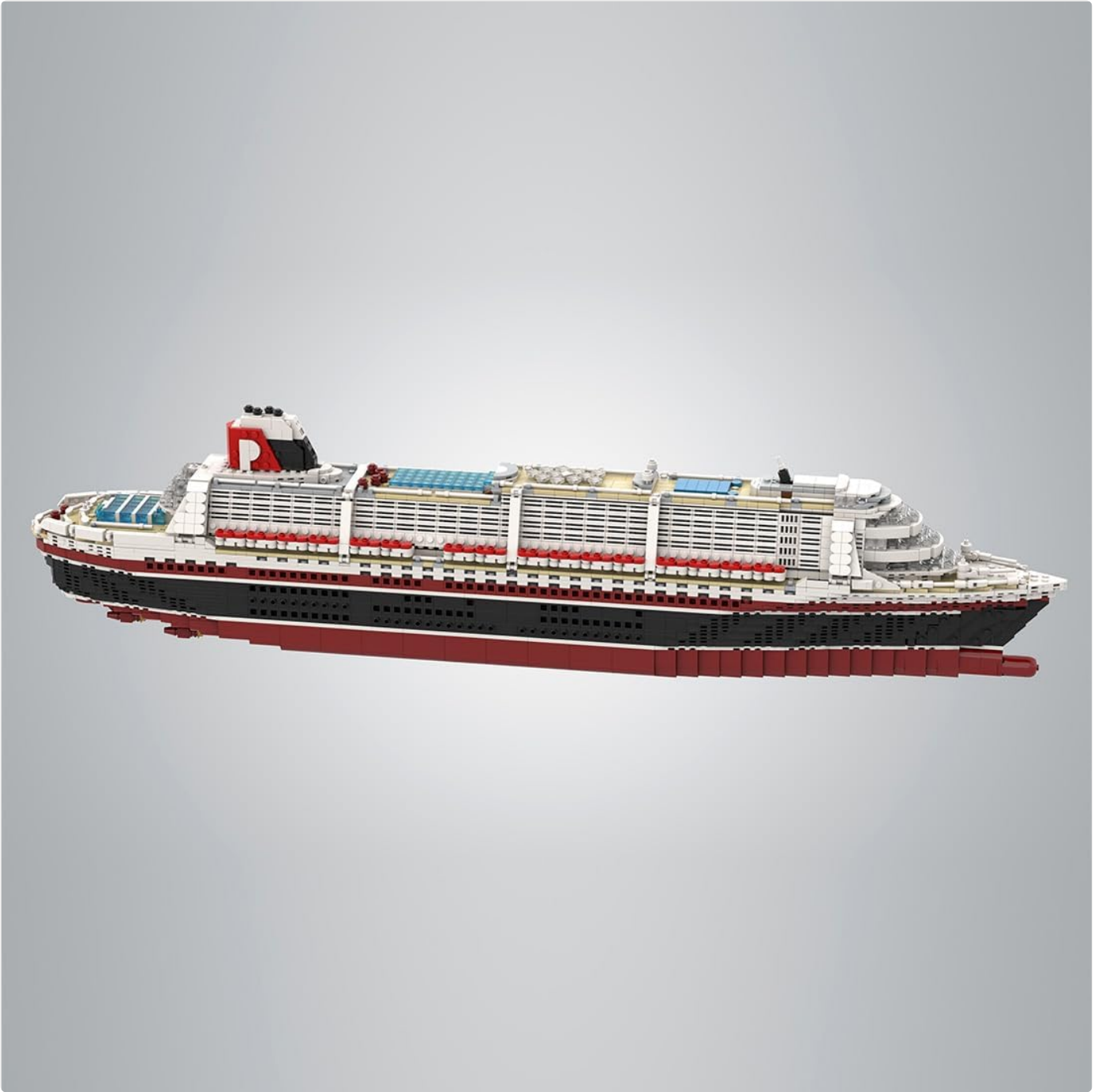
Image 2: Top-down view of the assembled model, showing deck features.