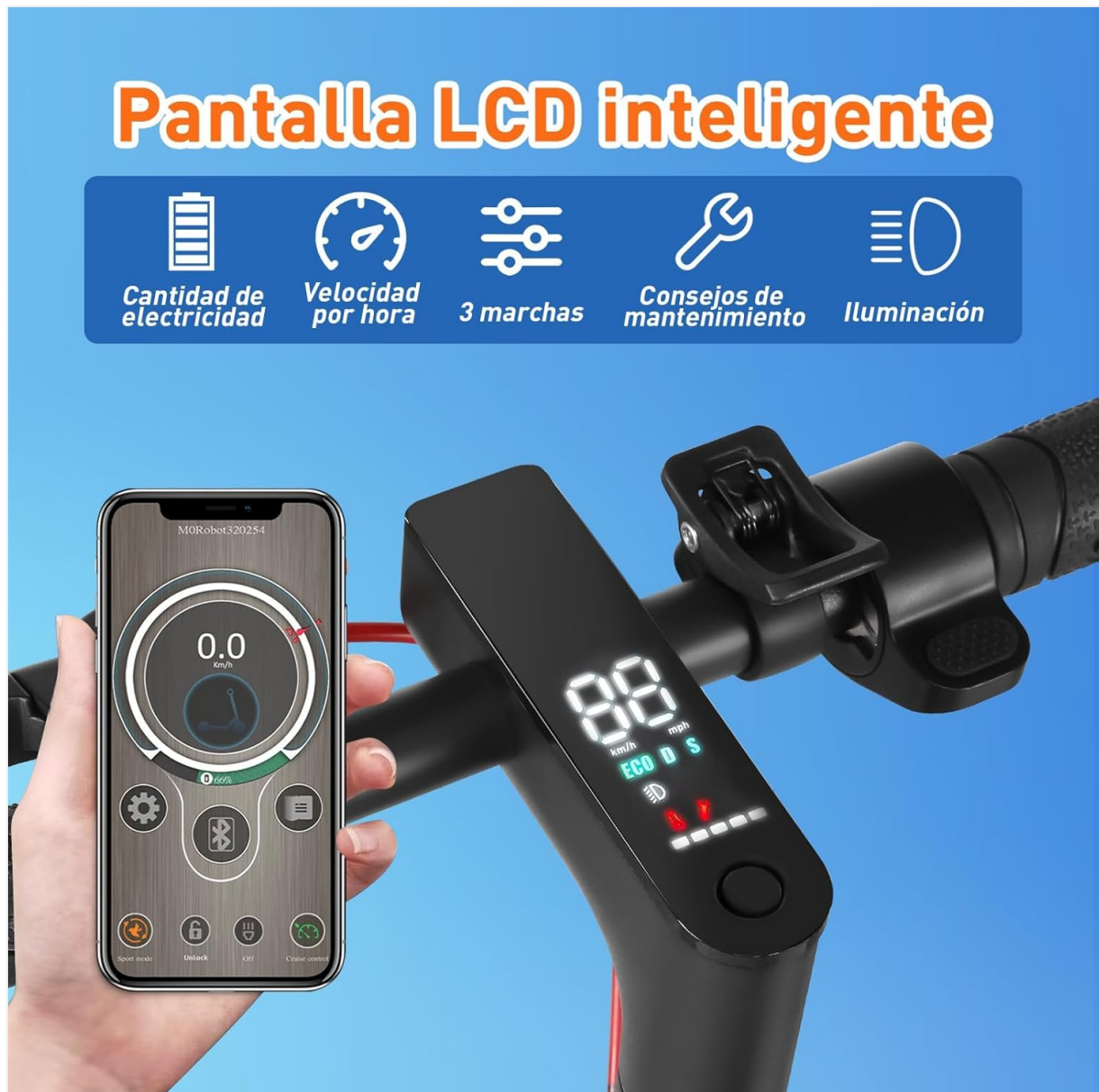
Image 5.4: Close-up of the scooter's intelligent LCD display and the Bluetooth app interface, showing various operational metrics.