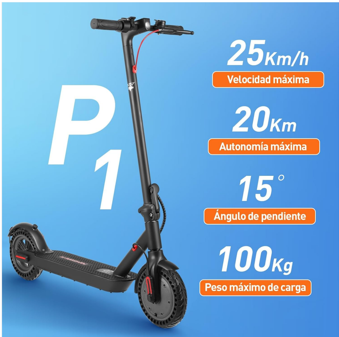
Image 6.1: Key performance indicators of the P1 scooter, including maximum speed, range, climbing angle, and load capacity.