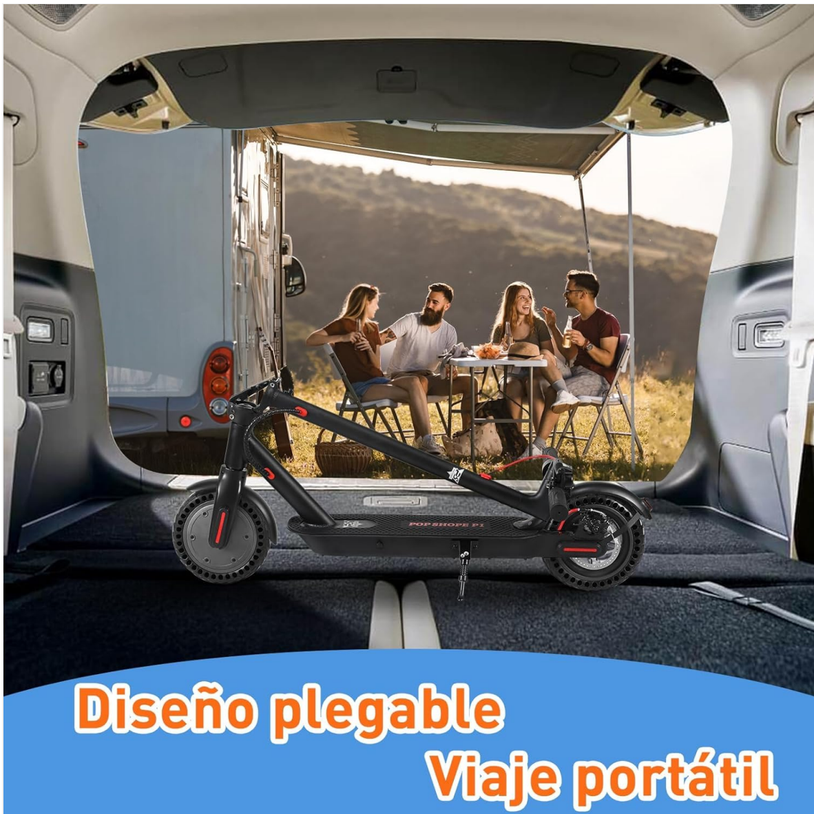
Image 6.5: The P1 scooter in its folded state, demonstrating its portability and ease of storage in a vehicle trunk.