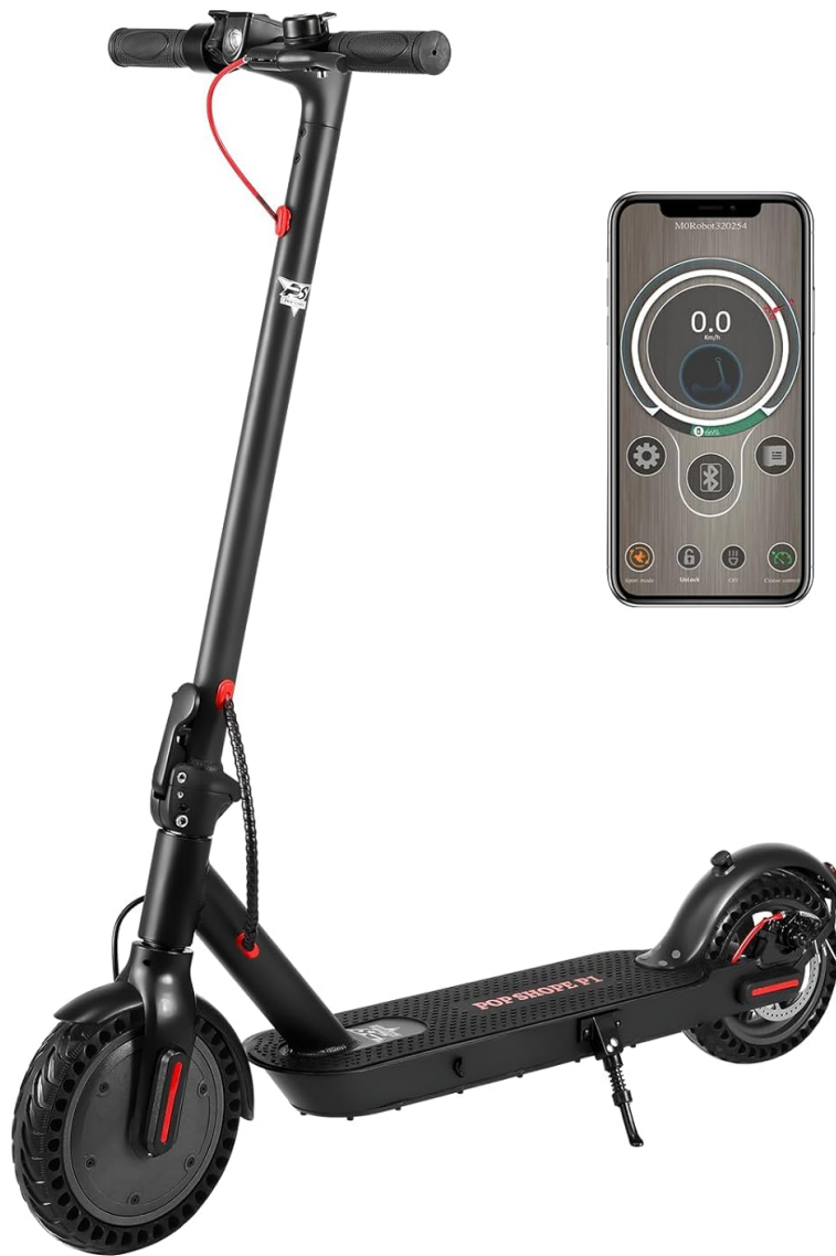
Image 1.1: The Pop Shope P1 Folding Electric Scooter, showcasing its design and a smartphone displaying the companion app interface.