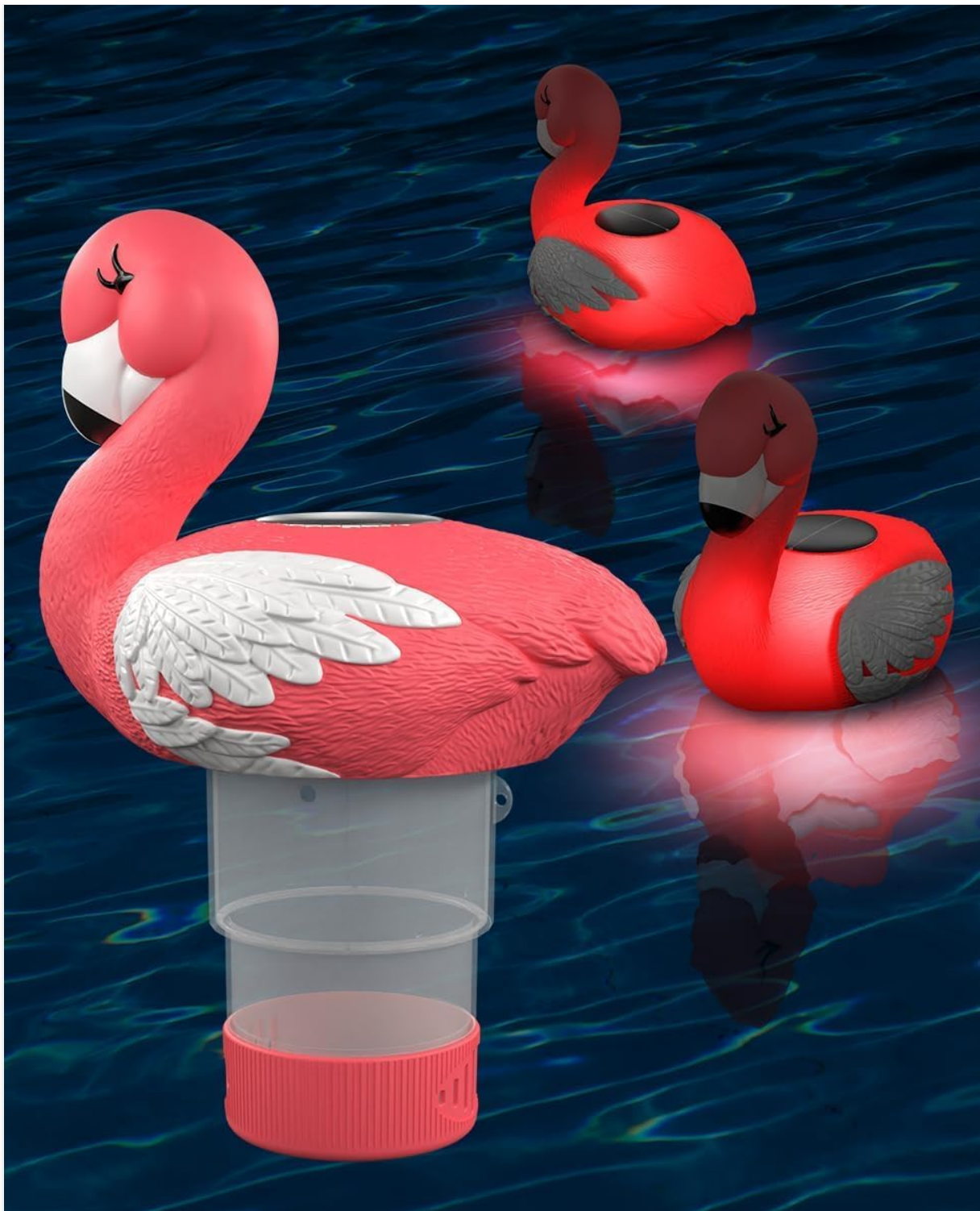
Image: The DoliWish Flamingo Pool Chlorine Floater, a pink flamingo figure with a solar panel, floats in a swimming pool, emitting a soft glow at night.