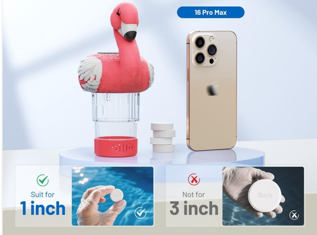
Image: The DoliWish Flamingo Pool Chlorine Floater next to a smartphone for scale, indicating it is suitable for 1-inch chlorine tablets and not 3-inch tablets.