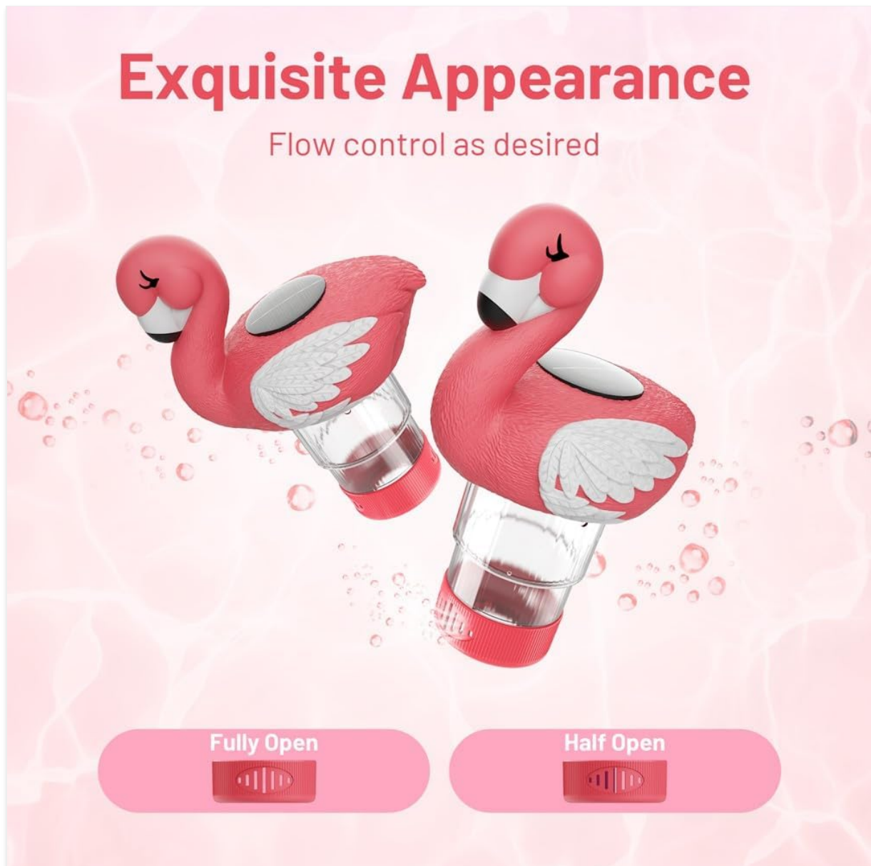
Image: A close-up of the DoliWish Flamingo Pool Chlorine Floater's base, illustrating the adjustable flow control mechanism with 'Fully Open' and 'Half Open' settings.