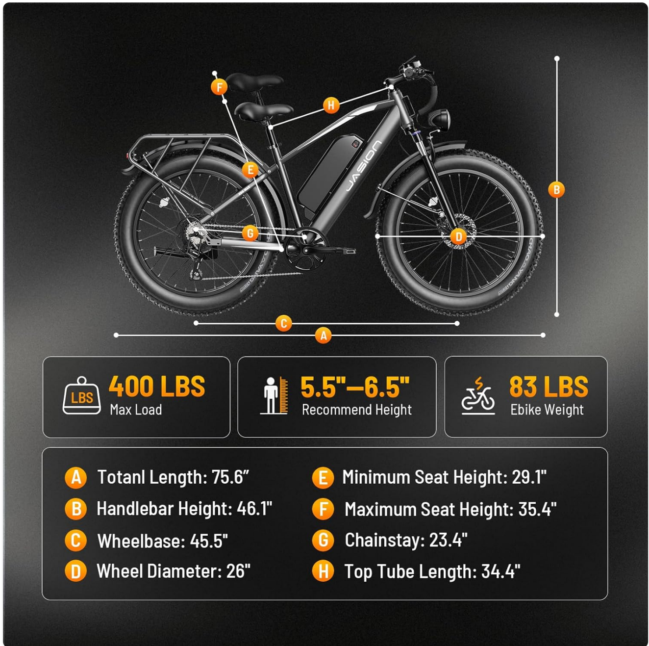
Image 4.1: Jasion EB5 MAX dimensions and recommended rider height (5.5"-6.5").