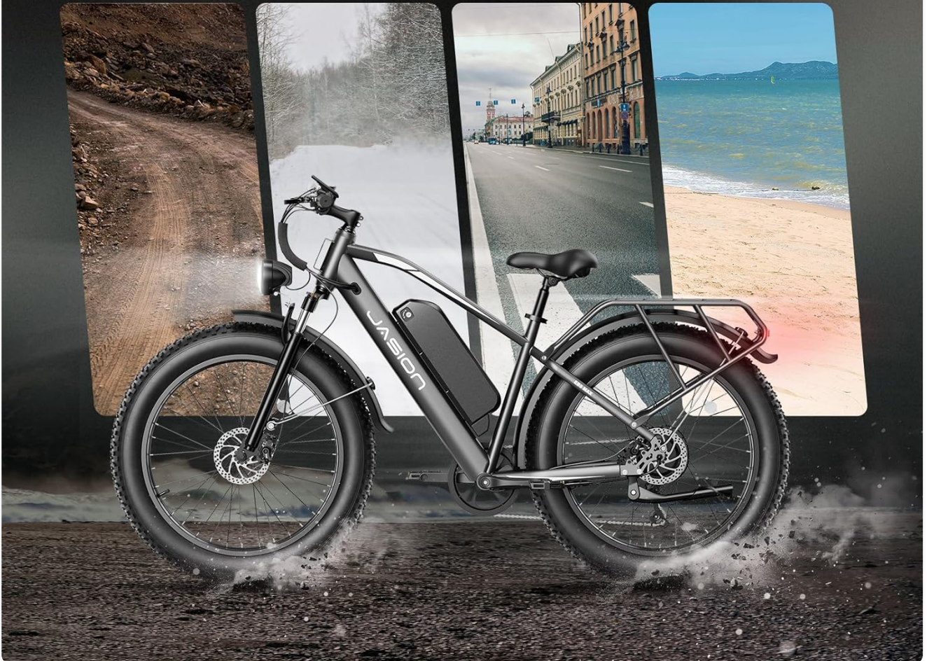
Image 6.1: Jasion EB5 MAX 26"x4.0" fat tires ready for various paths.