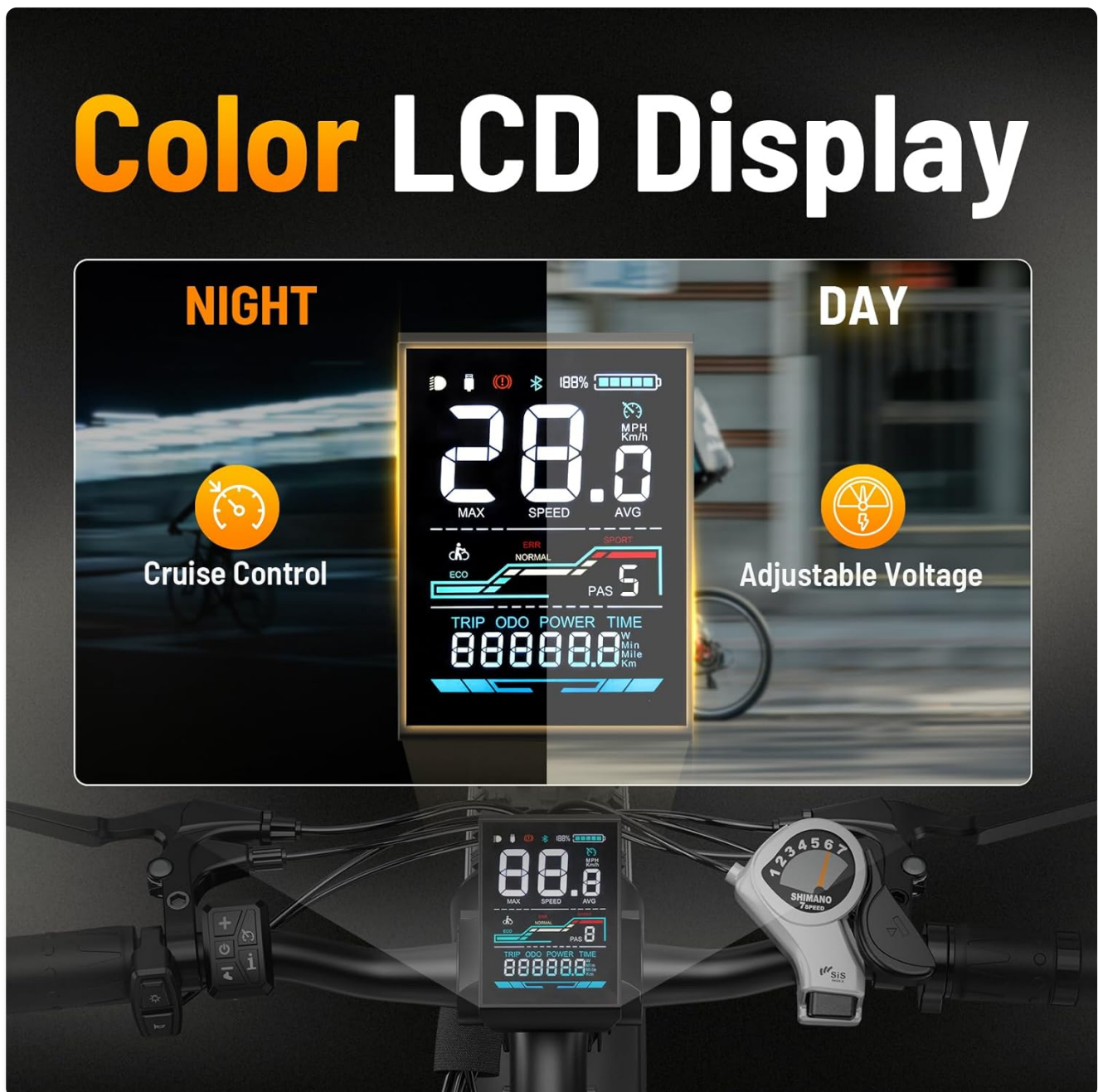
Image 5.1: Jasion EB5 MAX Color LCD Display for day and night visibility.

Use the '+' and '-' buttons near the display to adjust pedal assist levels or navigate menu options. The display also features a password-protected dashboard for added security.