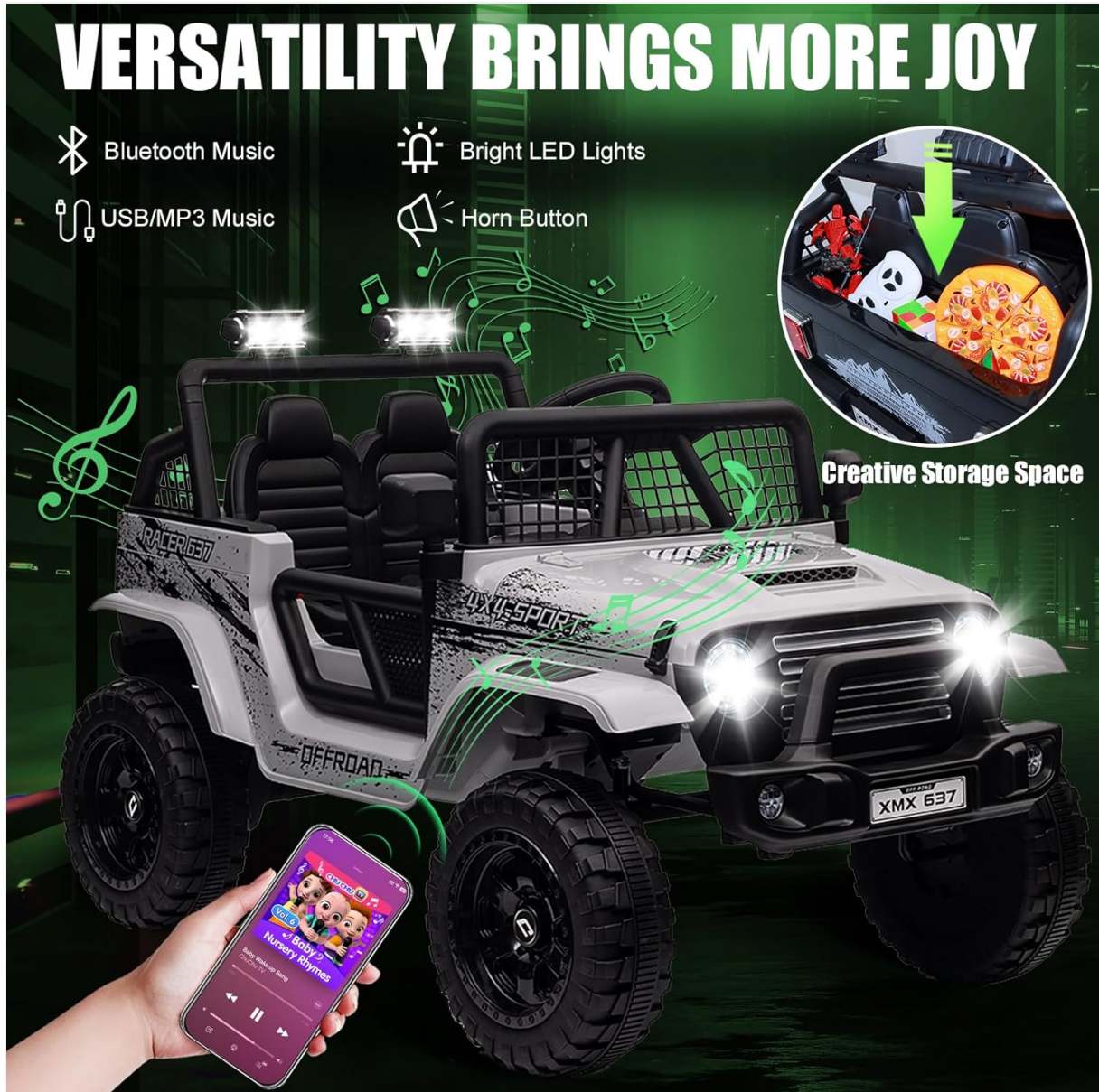
Image: The ride-on jeep showcasing its features including Bluetooth music, bright LED lights, horn button, and a creative storage space at the rear.

The vehicle is equipped with functional LED headlights, rear warning lights, and a horn button on the steering wheel for a realistic driving experience.