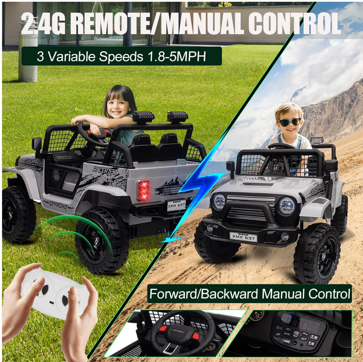
Image: Illustration showing both the child operating the jeep manually and a parent using the remote control, demonstrating the dual control modes.