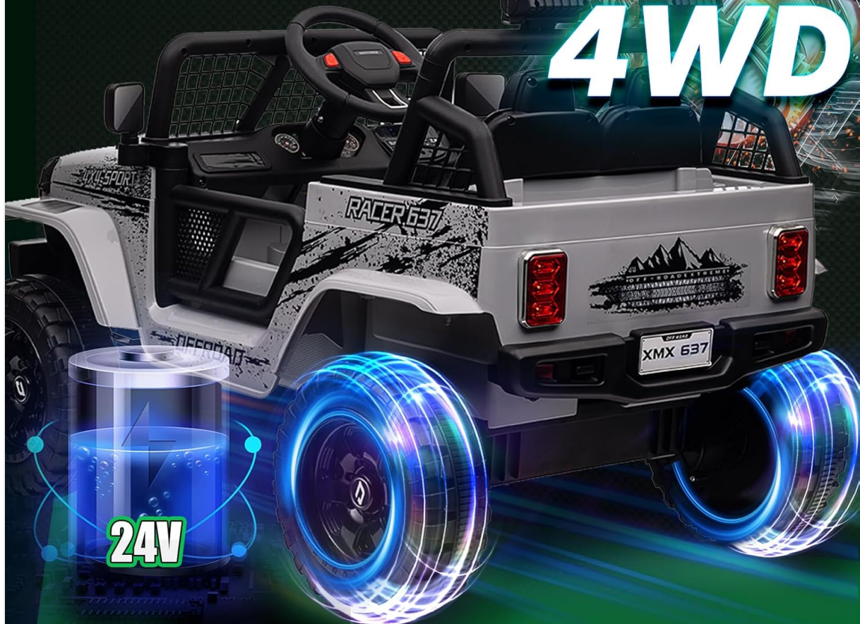
Image: Diagram illustrating the 24V battery and 4WD motor system, highlighting the power source and drive mechanism of the ride-on jeep.