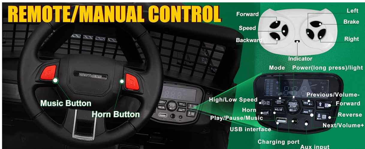
Image: Detailed diagram of the remote control and the vehicle's dashboard, labeling buttons for forward, backward, speed, music, horn, USB, and AUX inputs.