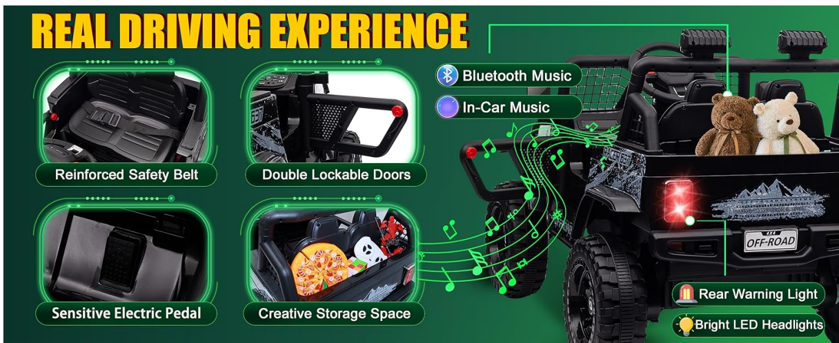
Image: Visual representation of the reinforced safety belt, double lockable doors, sensitive electric pedal, and creative storage space, highlighting key features for a realistic driving experience.