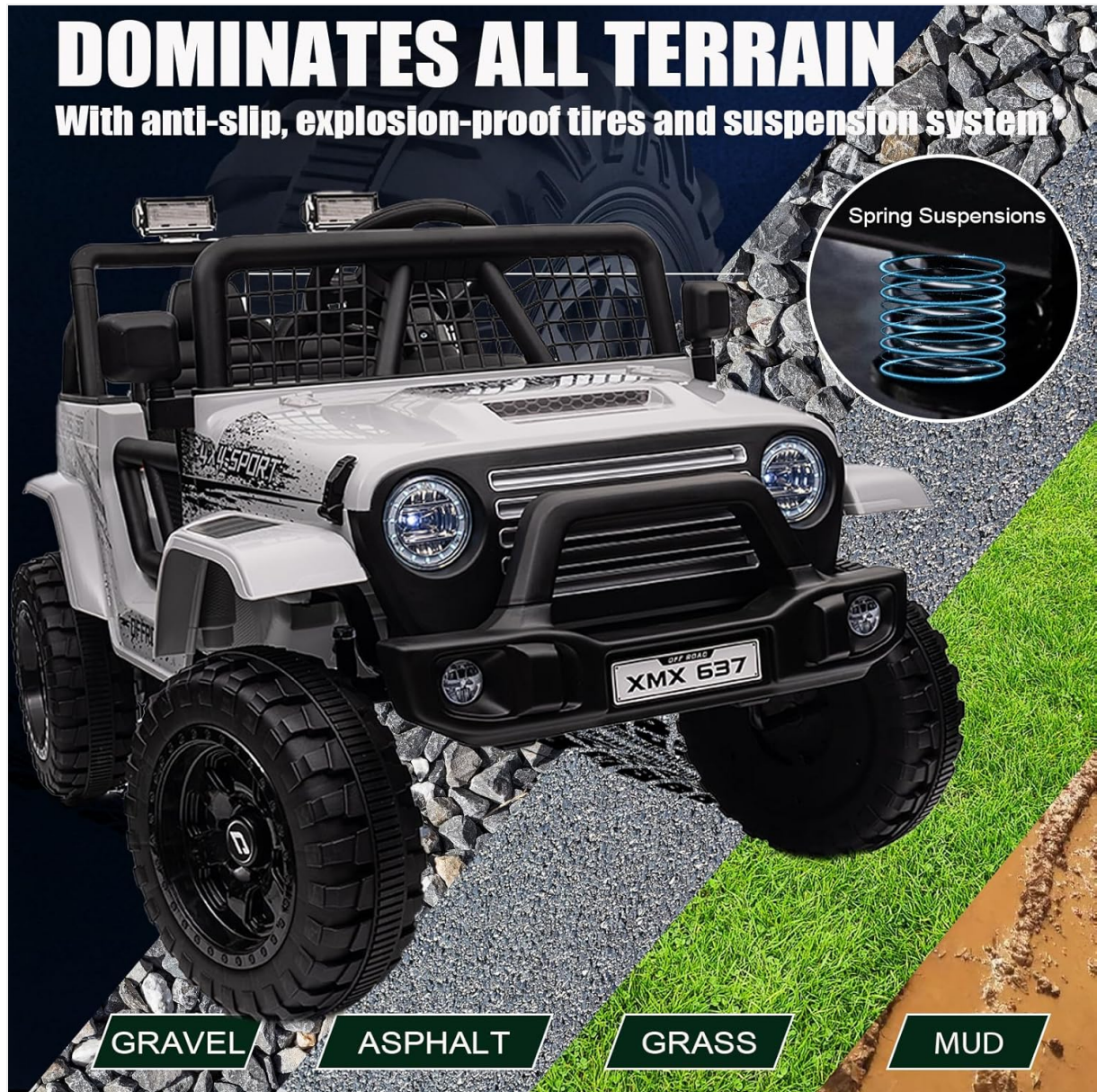
Image: The ride-on jeep positioned on various terrains (gravel, asphalt, grass, mud) with an inset showing the spring suspension system, illustrating its all-terrain capability.

including gravel, asphalt, grass, and mud with ease.