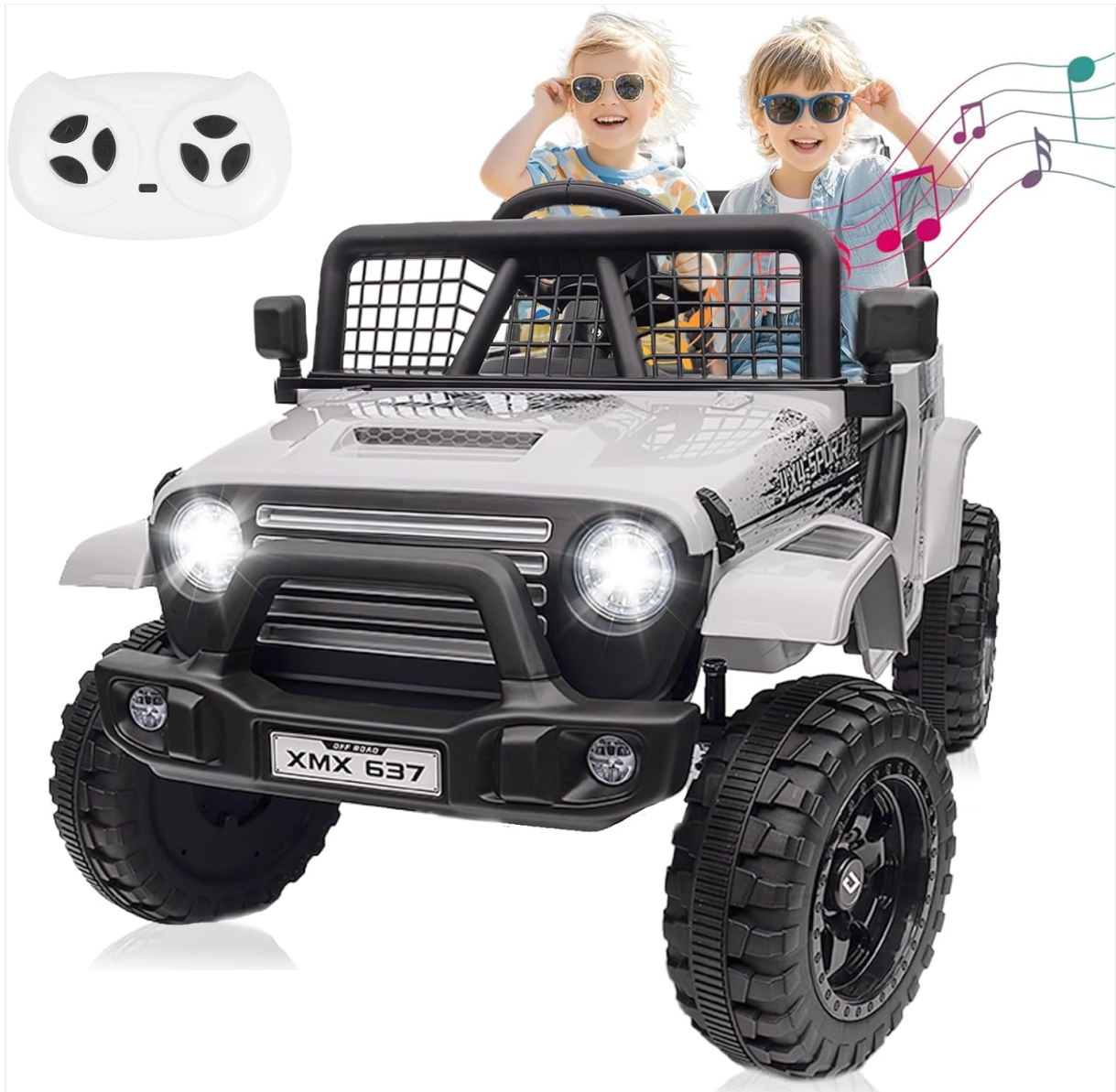
Image: The BLISSRIDE 24V Ride On Jeep, Model XMX637, in dark grey, with two children seated and a remote control shown. This image provides an overview of the product.

Follow the detailed assembly instructions provided in the separate assembly guide included with your product. Ensure all screws and fasteners are securely tightened before use.