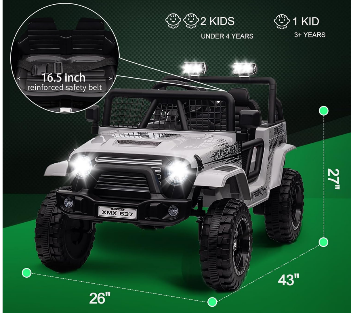
Image: Diagram illustrating the dimensions of the ride-on jeep (43x26x27 inches) and its seating capacity for two children under 4 years or one child 3+ years, with a 16.5-inch reinforced safety belt.