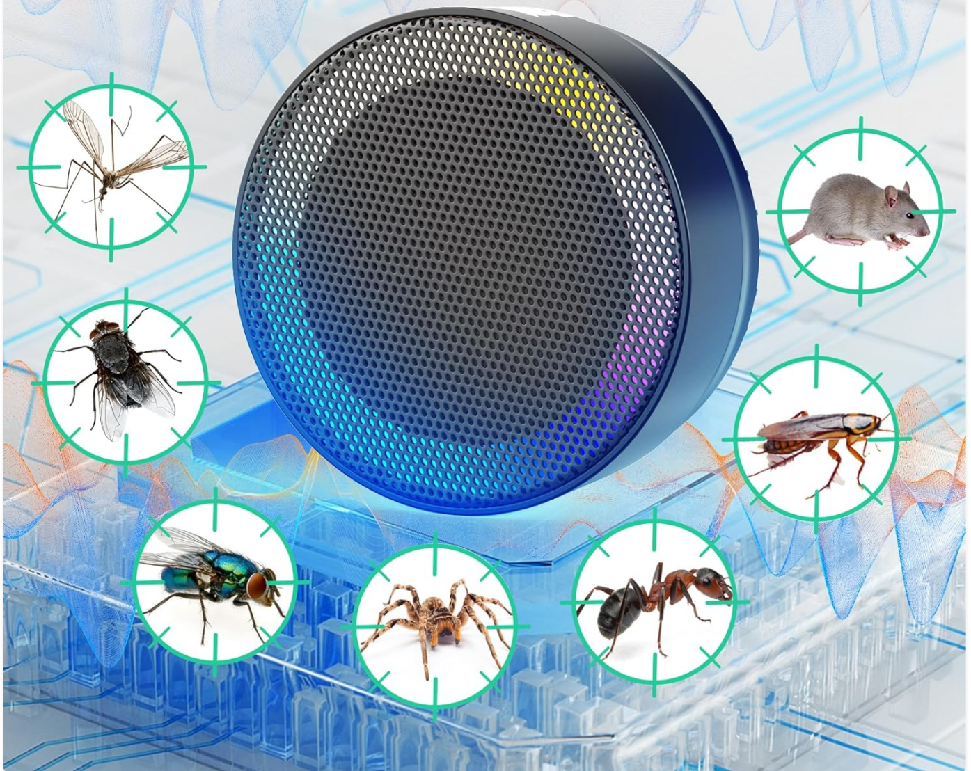
Image: The repeller's intelligent chip emitting ultrasonic waves, effective against a variety of pests including mosquitoes, flies, mice, cockroaches, spiders, and ants.