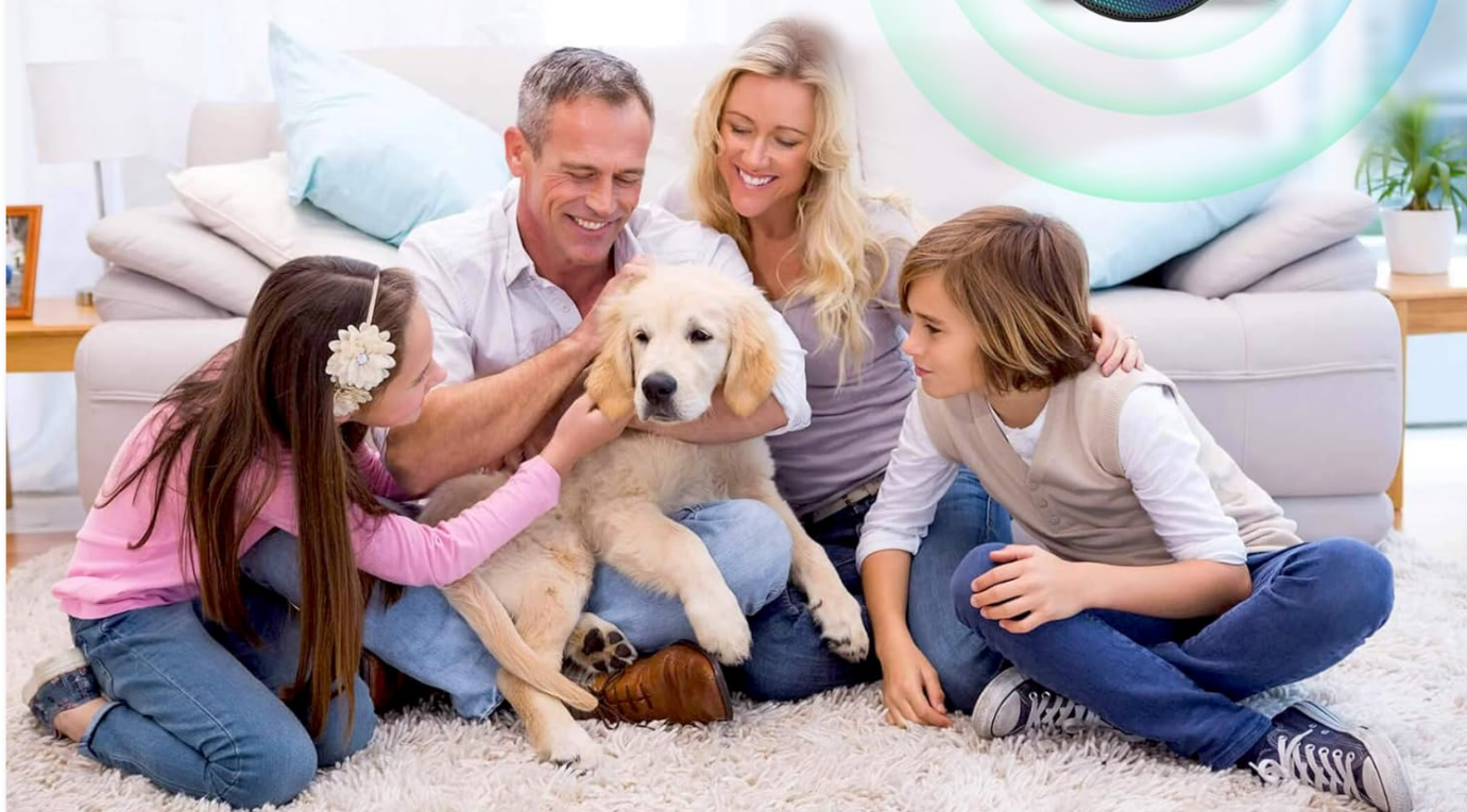
Image: The X-PEST repeller in a home setting, emphasizing its safety for families and pets with icons for "Safe," "Non-Toxic," and "Harmless."