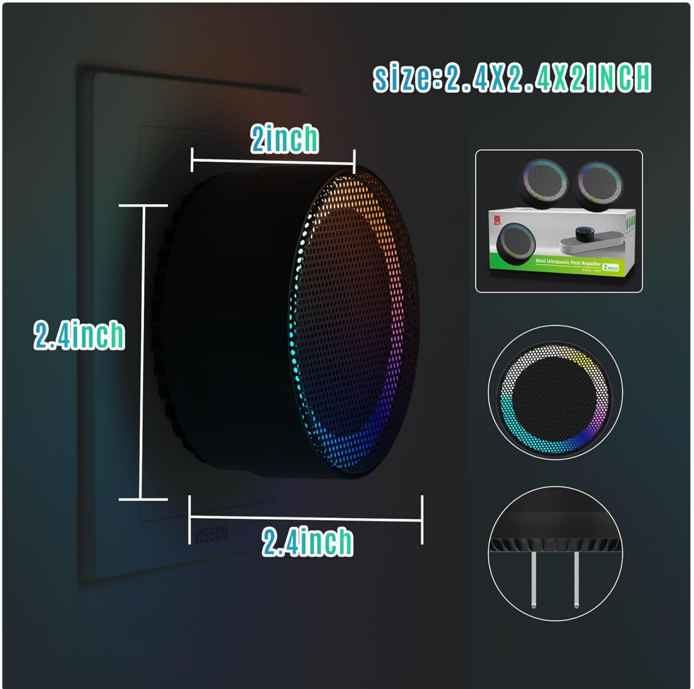
Image: A visual representation of the repeller's compact size (2.4x2.4x2 inches) and its direct plug-in design.