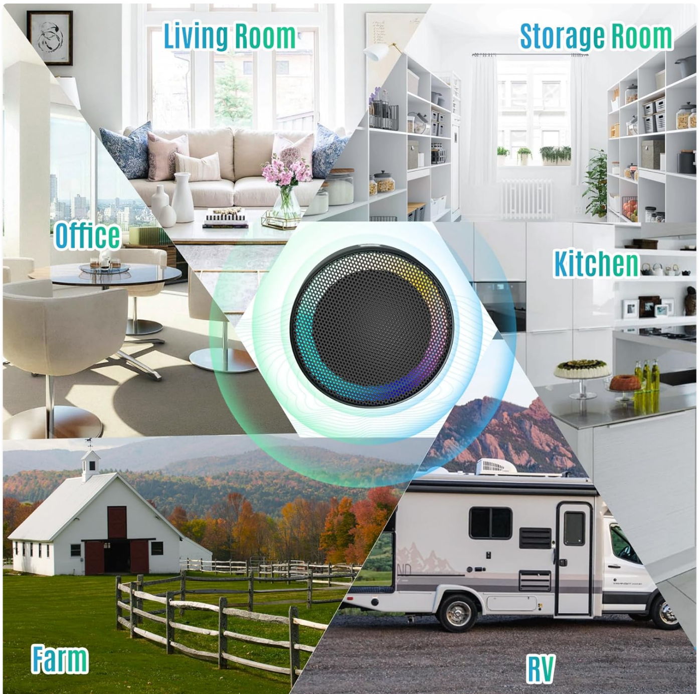
Image: Examples of various locations where the X-PEST repeller can be effectively used, such as living rooms, storage rooms, kitchens, offices, farms, and RVs.