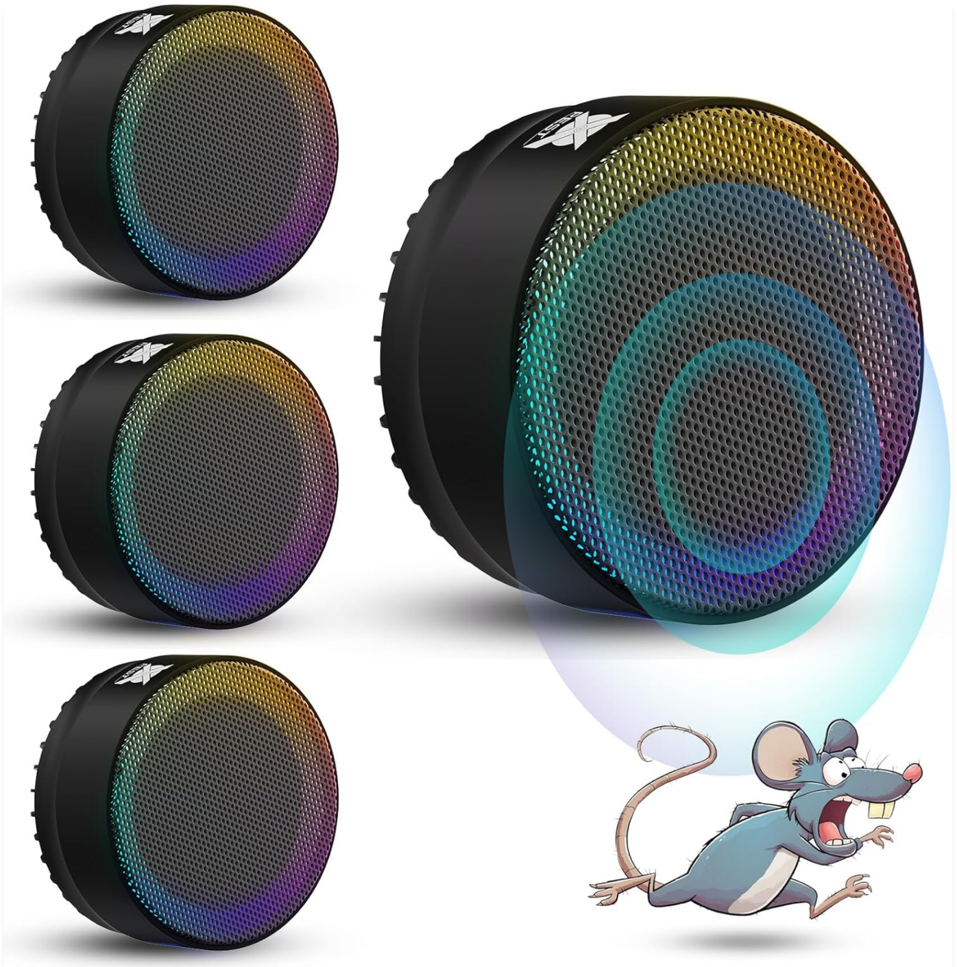
Image: A set of four X-PEST Ultrasonic Pest Repellers, illustrating their compact design and the concept of ultrasonic waves repelling a mouse.