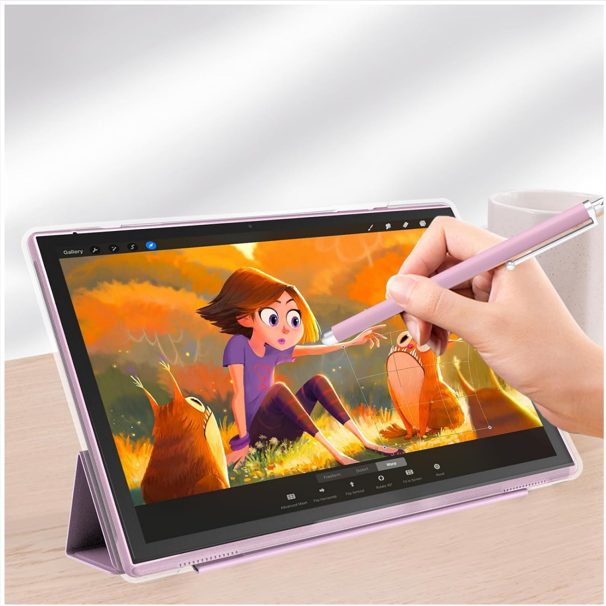
Image: A user utilizing the included stylus for creative work on the tablet, demonstrating its precision input capabilities.