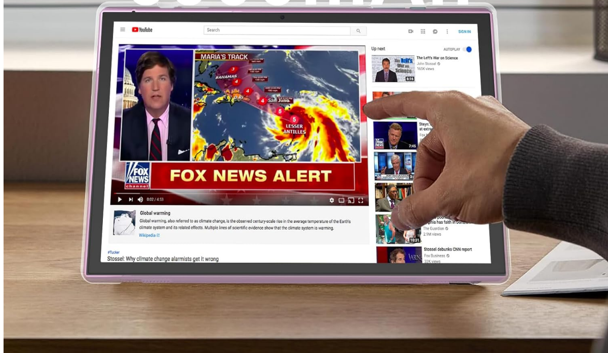
Image: The tablet screen showing media content, highlighting its large battery capacity for extended use.