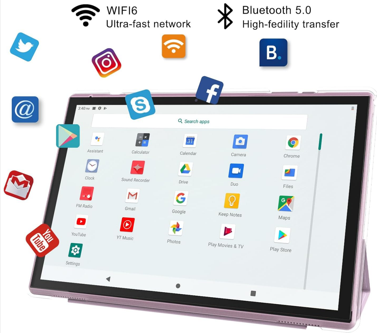
Image: The tablet highlighting its fast Wi-Fi 6 and efficient Bluetooth 5.0 connectivity for seamless internet access and device pairing.

Fast WiFi6 and efficient Bluetooth 5.0 wireless connectivity for uninterrupted access to the web and entertainment