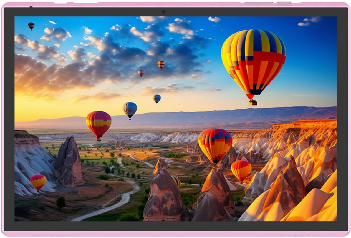
Image: The tablet showcasing its 10.1-inch IPS display with high resolution, ideal for visual content.

1280*800 resolution and a screen-to body ratio of 84%.With a largedazzling screen, every frame is a visual feast.