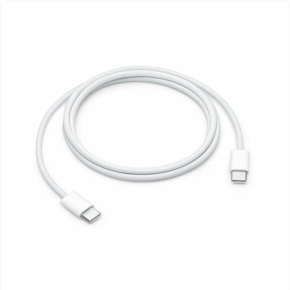
Image: The Apple 60W USB-C Woven Charge Cable, 1 meter in length, featuring a white woven exterior and USB-C connectors on both ends.