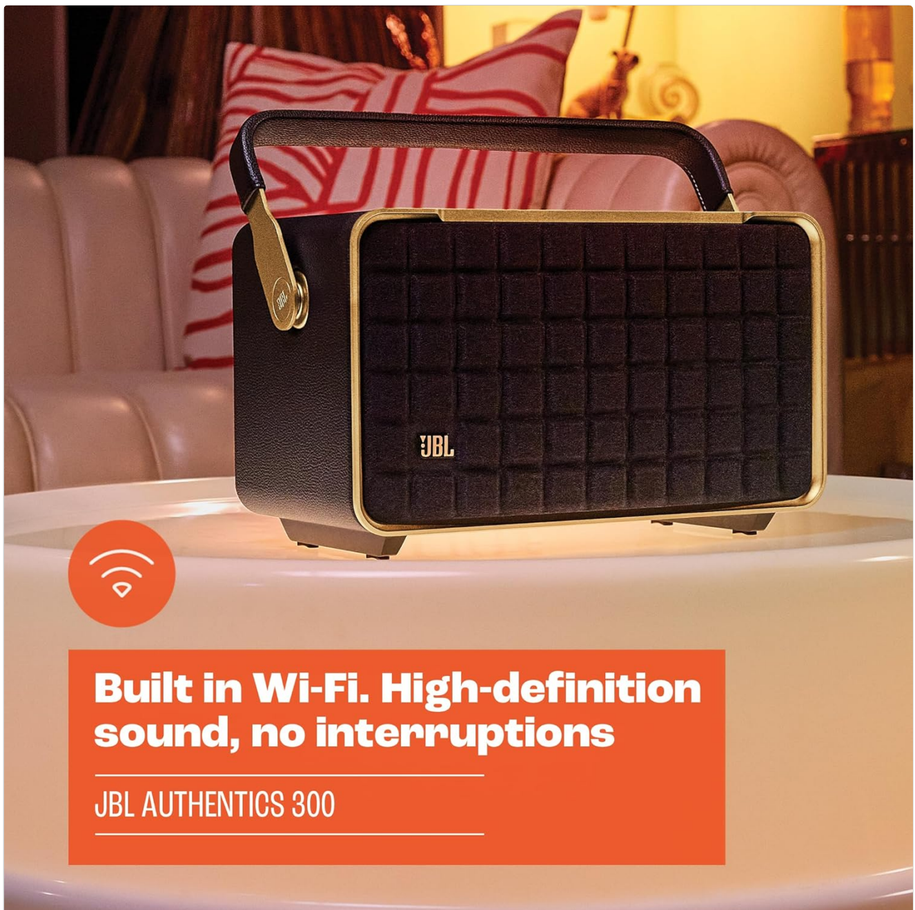
Figure 3: Wi-Fi connectivity for uninterrupted streaming.