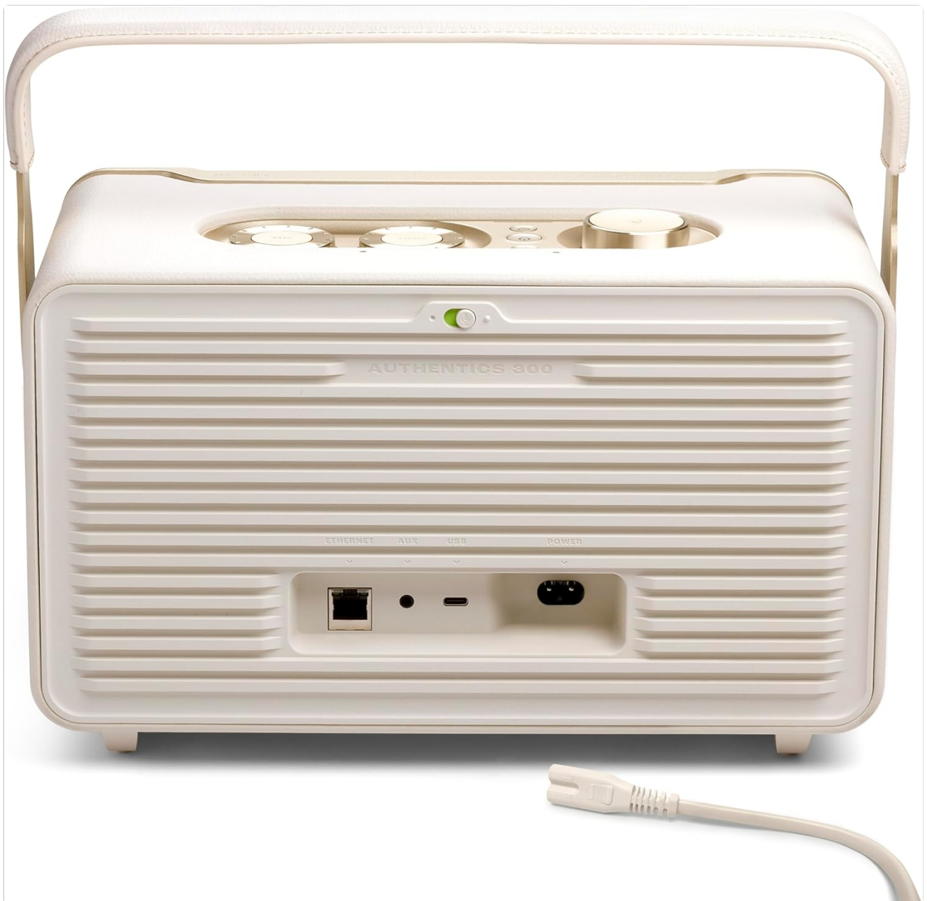
Figure 2: Rear panel of the JBL Authentics 300 with connectivity ports.