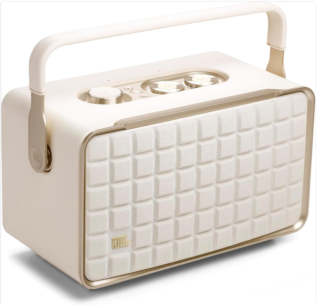
Figure 1: Front view of the JBL Authentics 300 speaker (White/Gold).