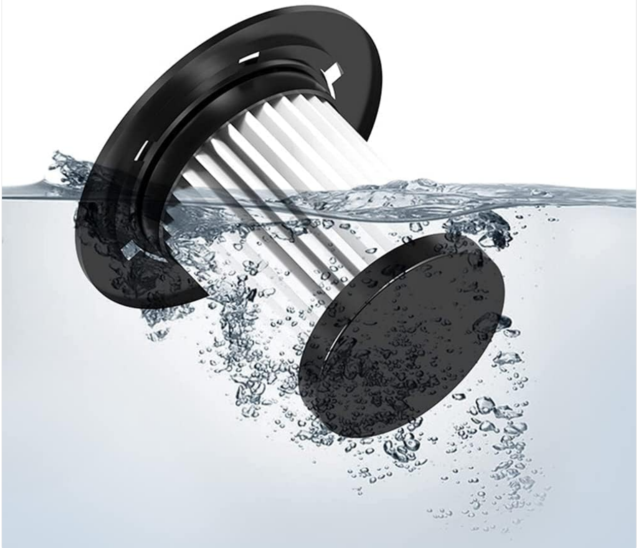
Figure 5: The HEPA filter is removable, washable, and reusable, ensuring efficient filtration and preventing secondary pollution.

Environmentally Friendly Materials, Washable and Reusable