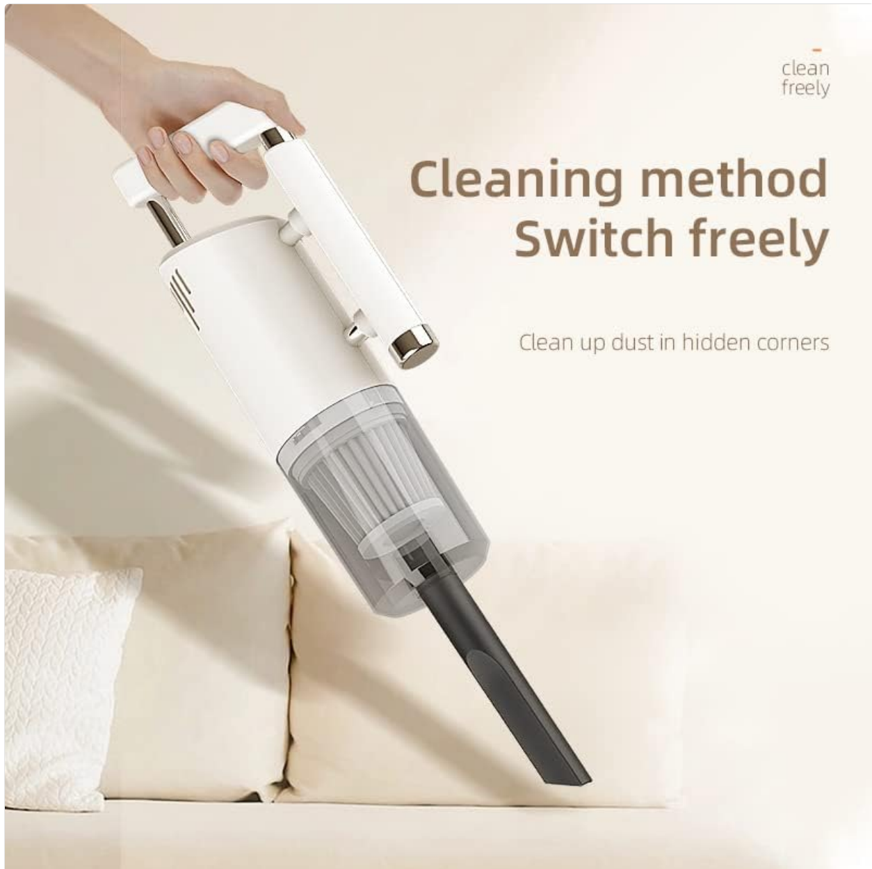
Figure 2: The vacuum can be used in a handheld configuration for cleaning dust in hidden corners and smaller areas.