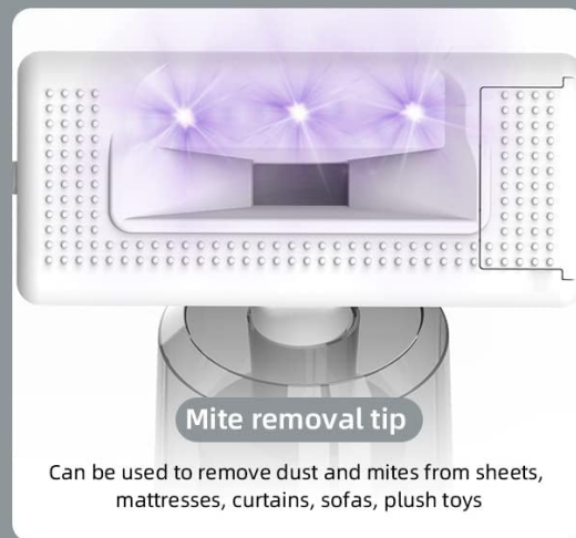
Figure 3: A selection of attachments for different cleaning needs, including a slim brush for floors, a flat mouth suction for gaps, a round mouth brush for deep cleaning, and a mite removal tip.