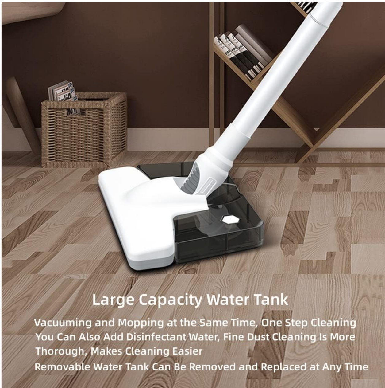
Figure 1: The large capacity water tank attaches to the main unit for combined vacuuming and mopping. It is removable for easy filling and cleaning.