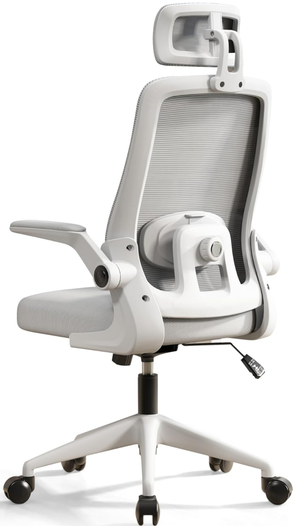
Figure 1: Felicita Ergonomic Office Chair SLCH-10WHGY (White/Gray)