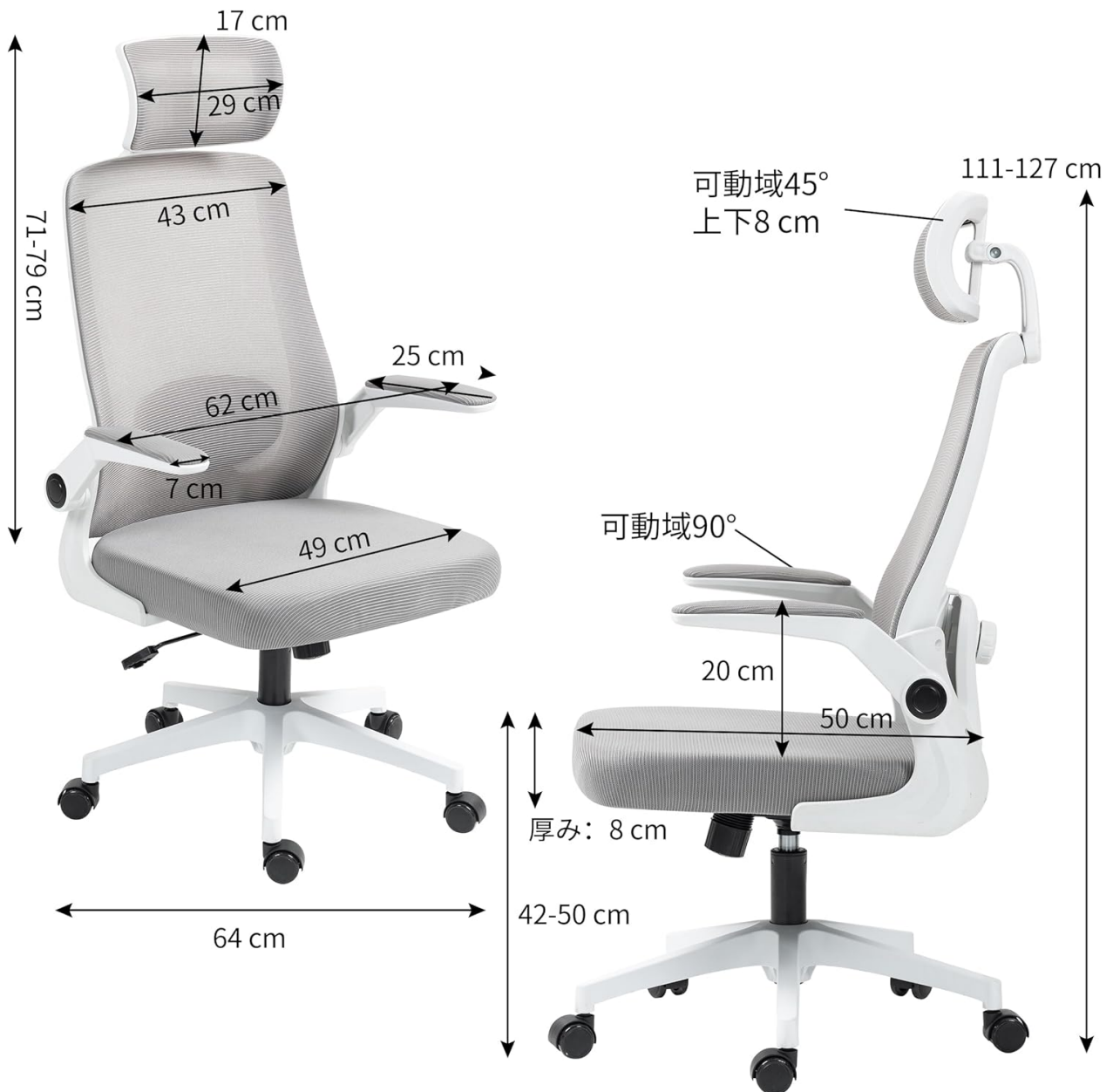
Figure 7: Detailed Chair Dimensions