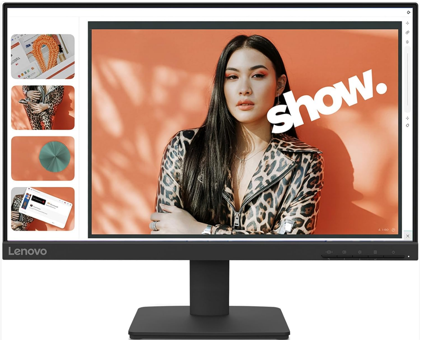
Figure 1: Front view of the Lenovo L22-4e Monitor.