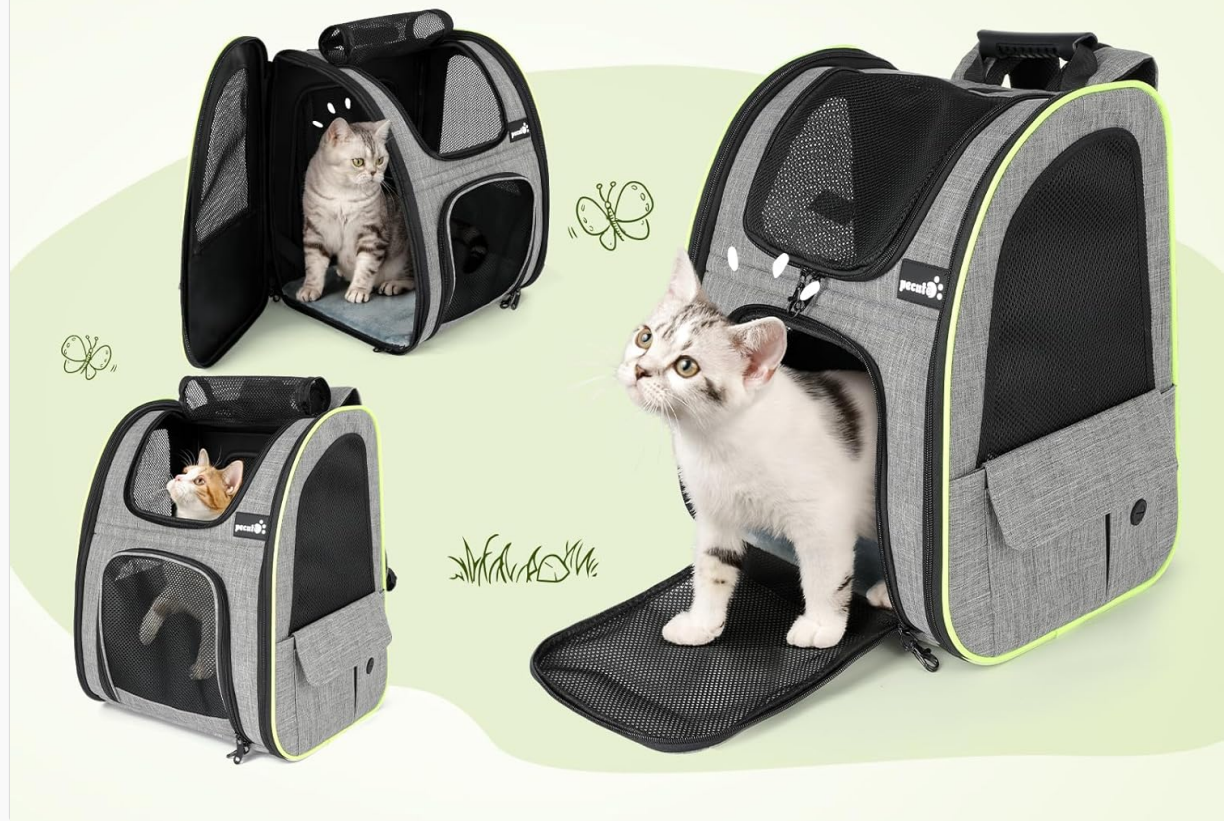
Image: Various access points on the backpack carrier for easy pet entry and exit.