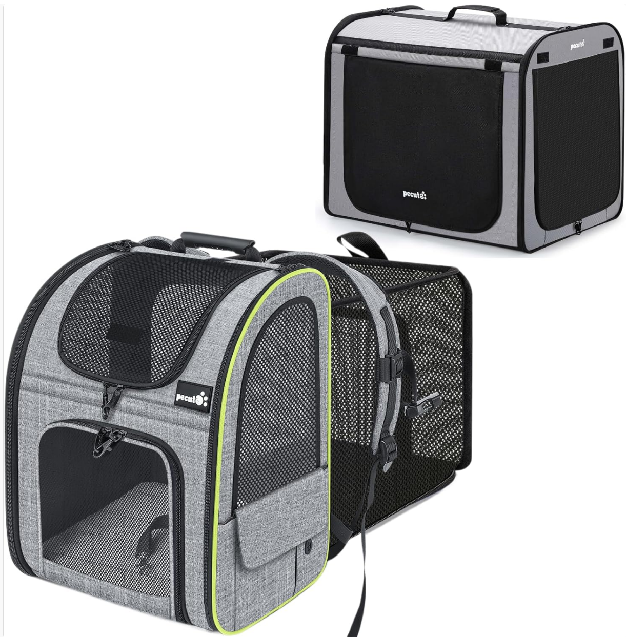
Image: The Pecute pet carrier shown as an expandable backpack and a compact car crate.