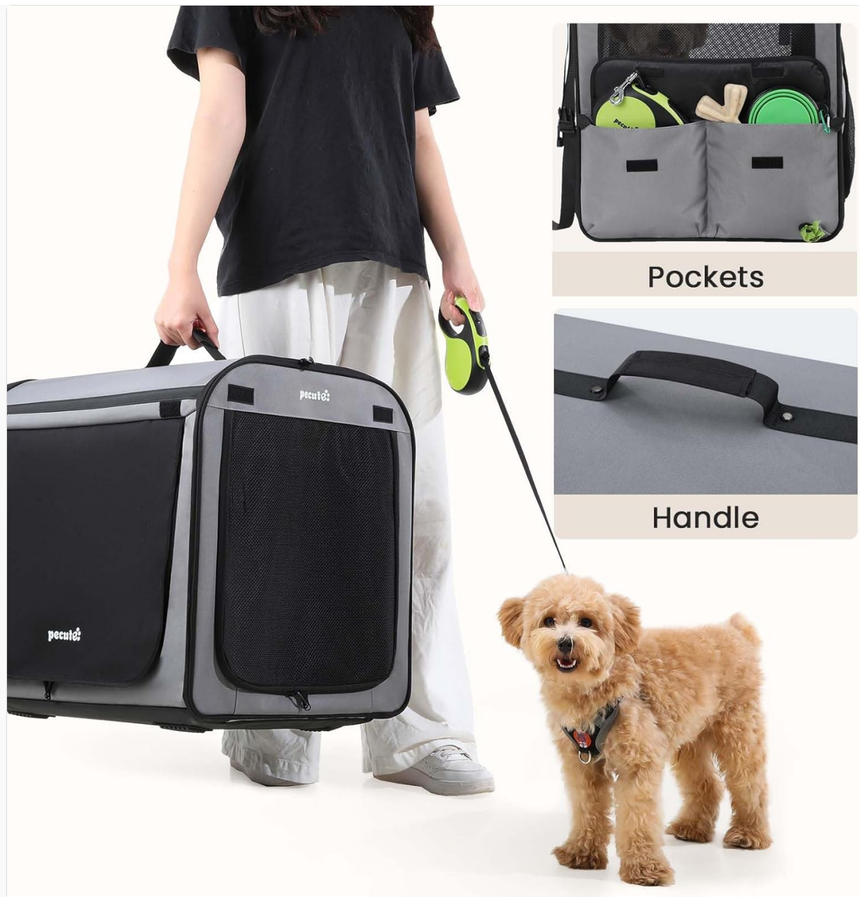
Image: The carrier's handle and convenient side pockets for storing pet accessories.