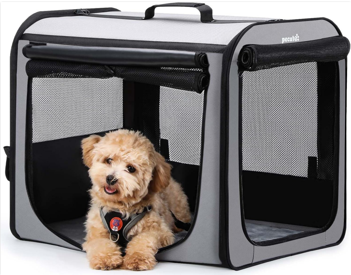
Image: A small dog inside the carrier, configured as a car crate.