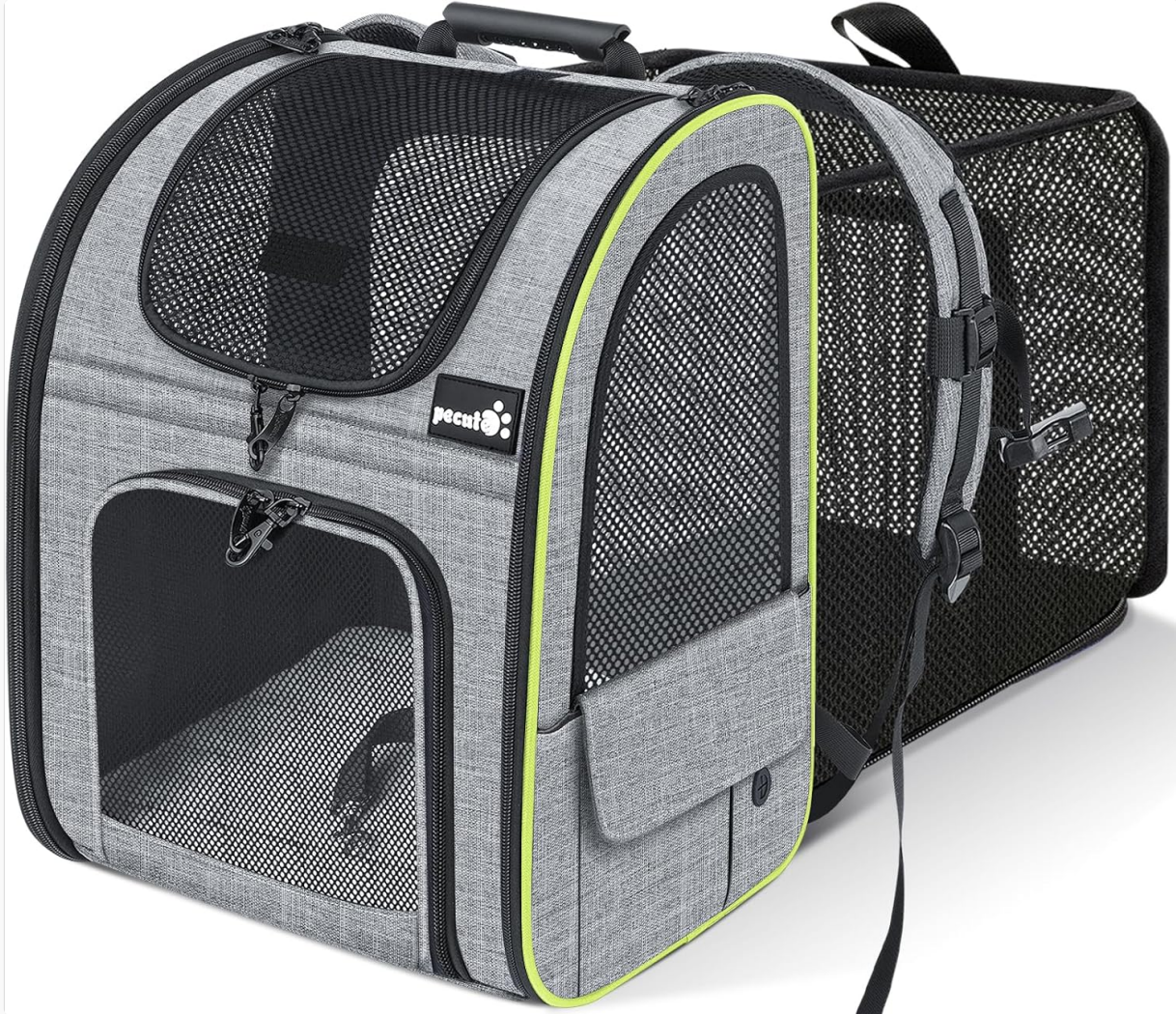
Image: The carrier in backpack mode with the expandable section open, showing increased space.