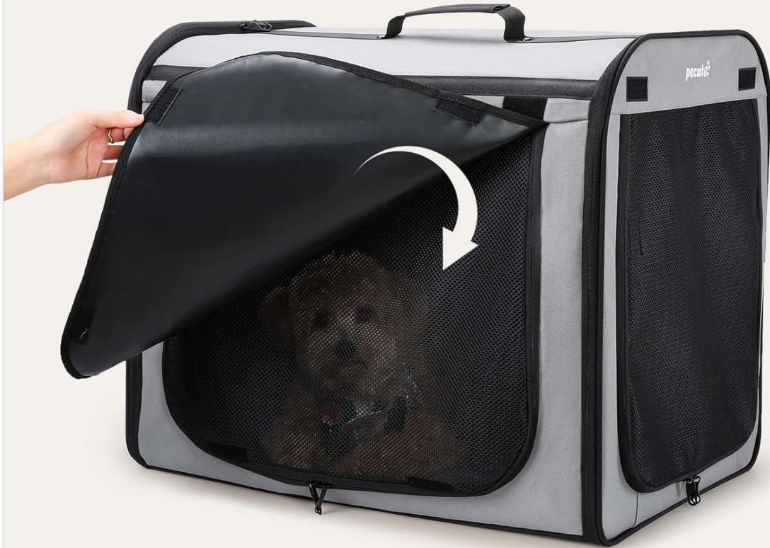
Image: The roller blind feature being used to provide shade and privacy within the carrier.

Provide sunshade for pets and provide private space