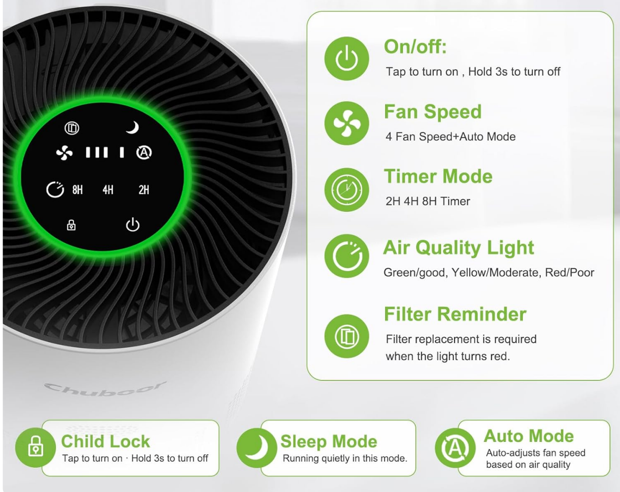
Figure 3: Simple Touch Control Panel.

Effortless air purification — simply press to start.