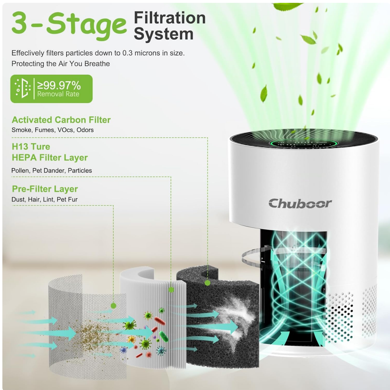
Figure 2: The 3-Stage Filtration System.