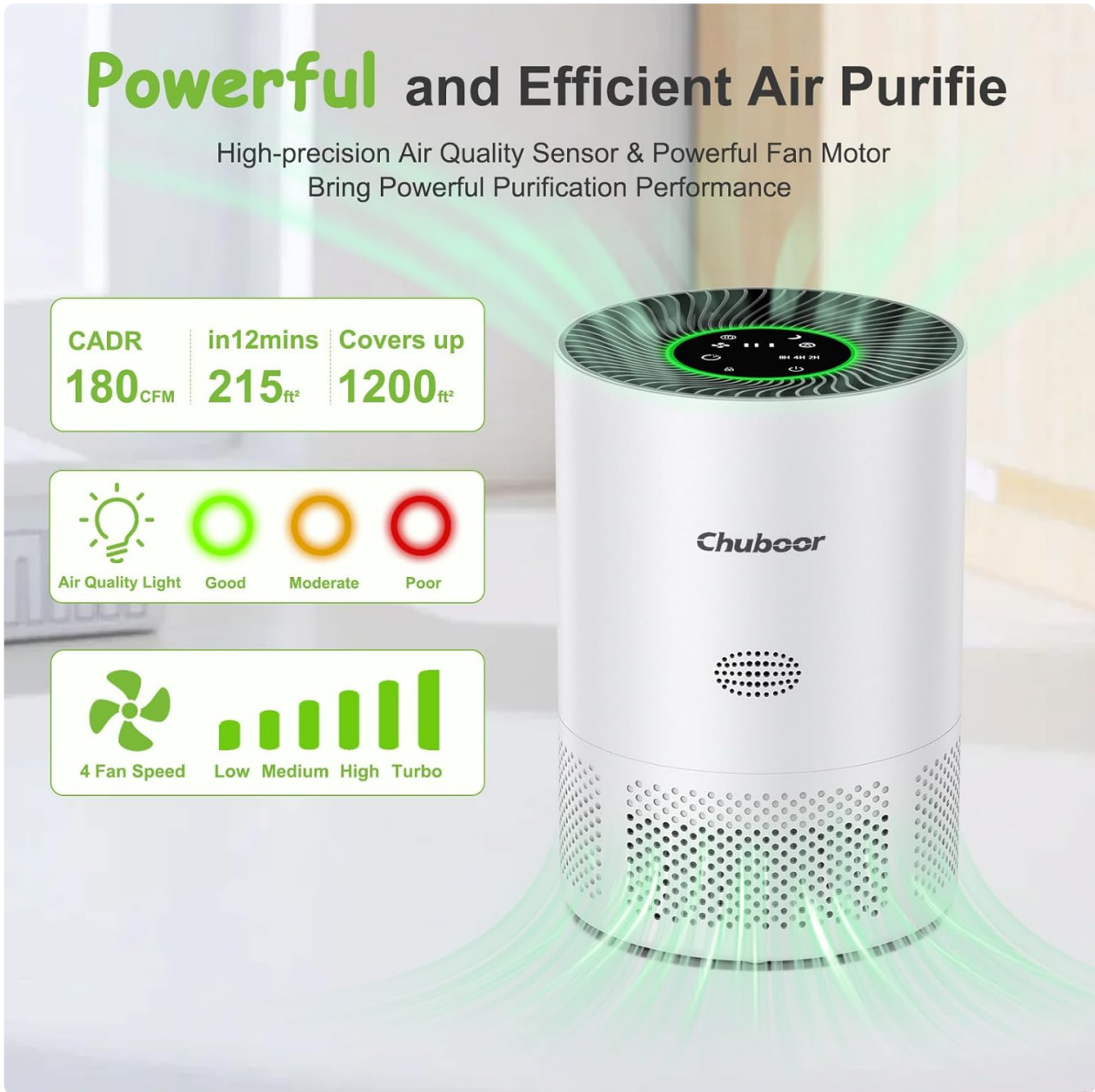
Figure 5: Air Quality Light and Fan Speed Indicators.