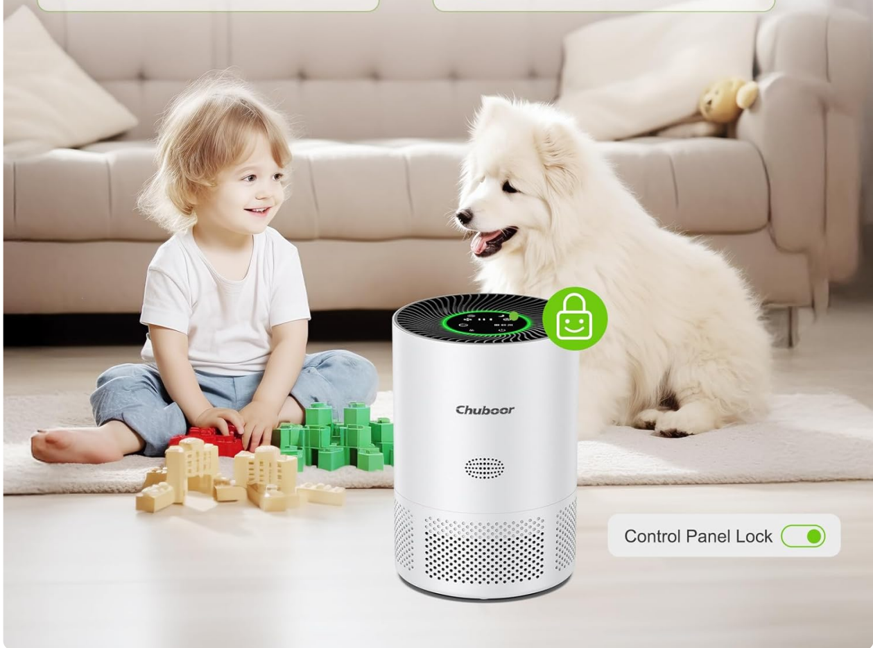
Figure 6: Kid-Friendly Design with Child Lock and Timer.

2H 4H 8H Timer mode Timer setting for energy efficiency.