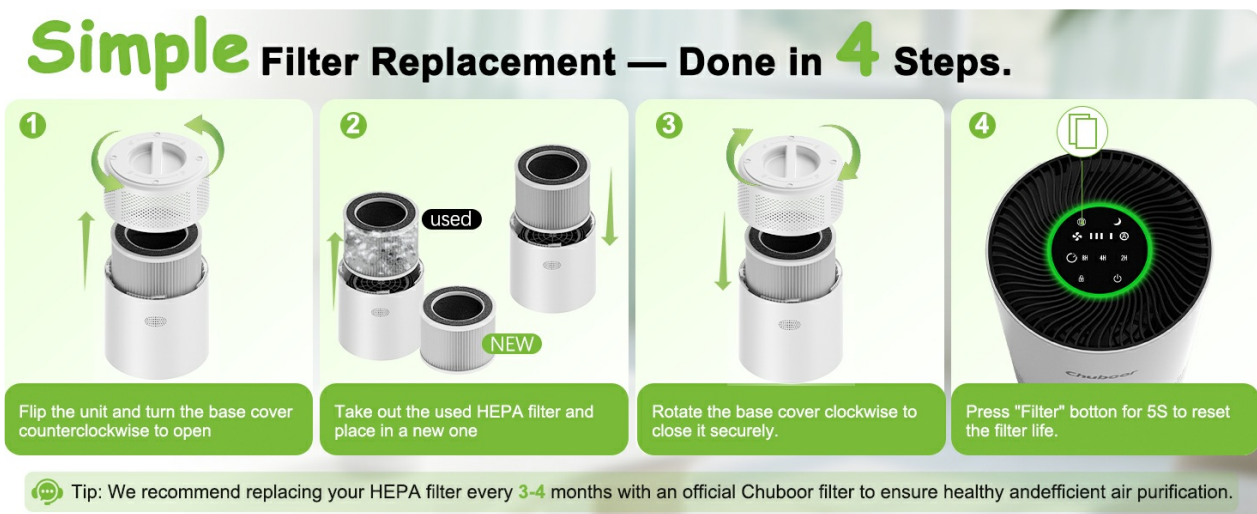
Figure 9: Filter Life Indicator and Replacement Steps.