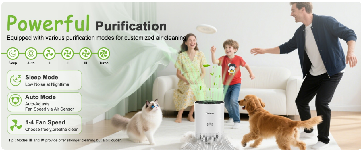
Figure 8: Overview of purification modes and fan speed options.