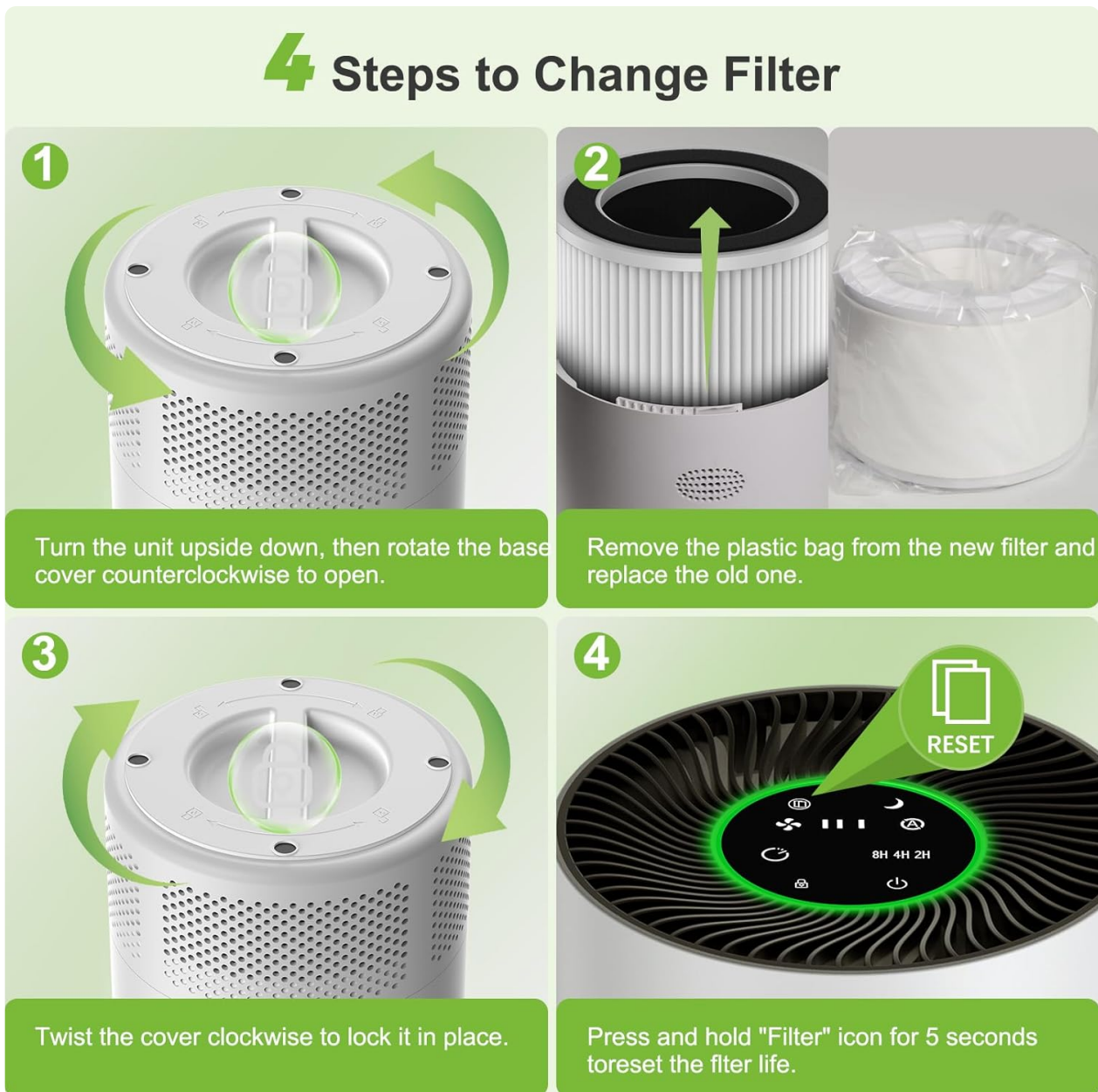
Figure 4: 4 Steps to Change Filter. This diagram visually guides you through the filter installation process.

Your browser does not support the video tag. This video demonstrates how to install the HEPA filter for the first time.