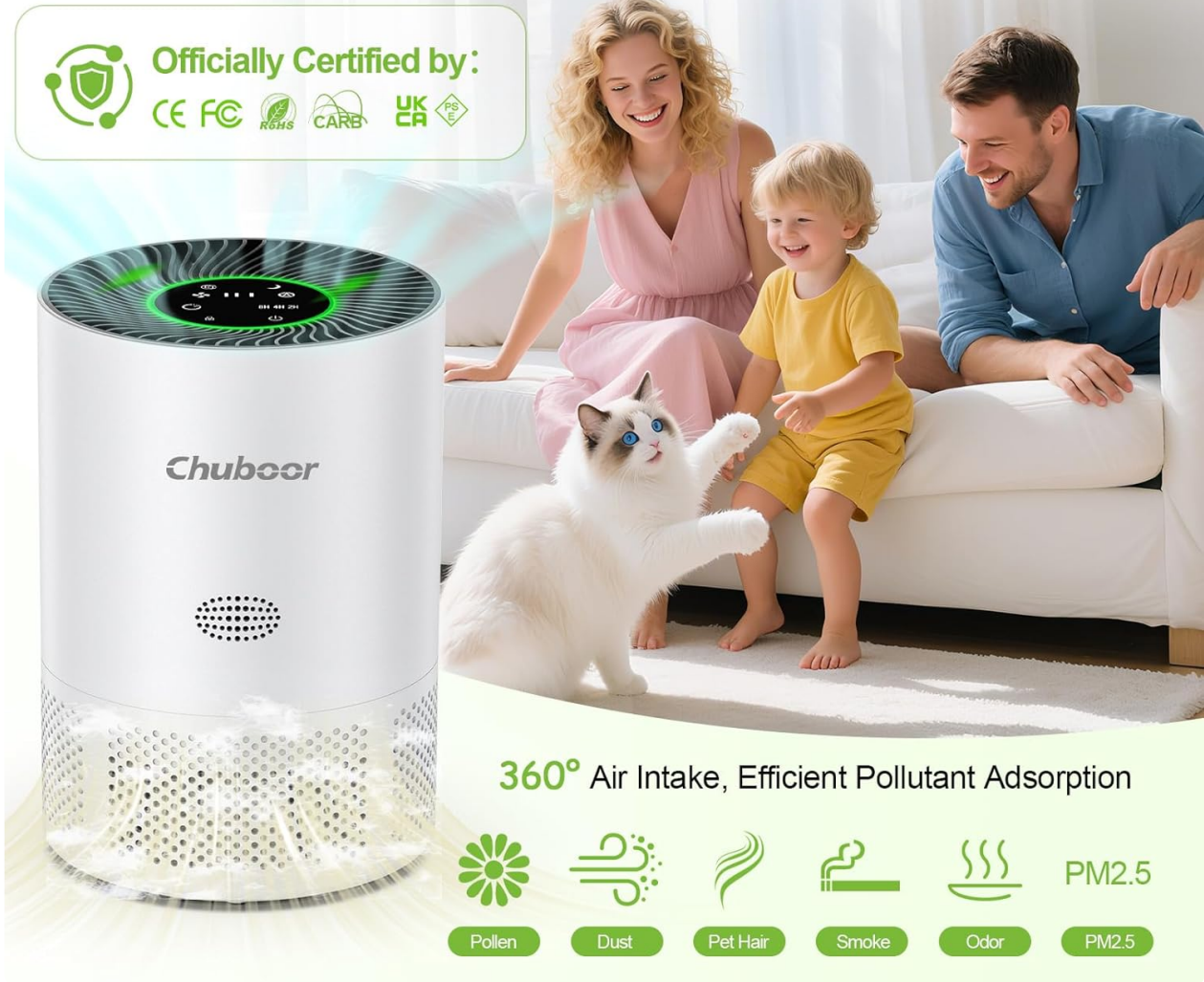
Figure 1: Chuboor PJ01 Air Purifier in a home setting.