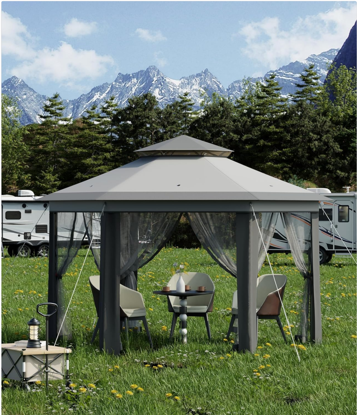
Figure 4.2: Example of securing the gazebo with a guy rope and stake.