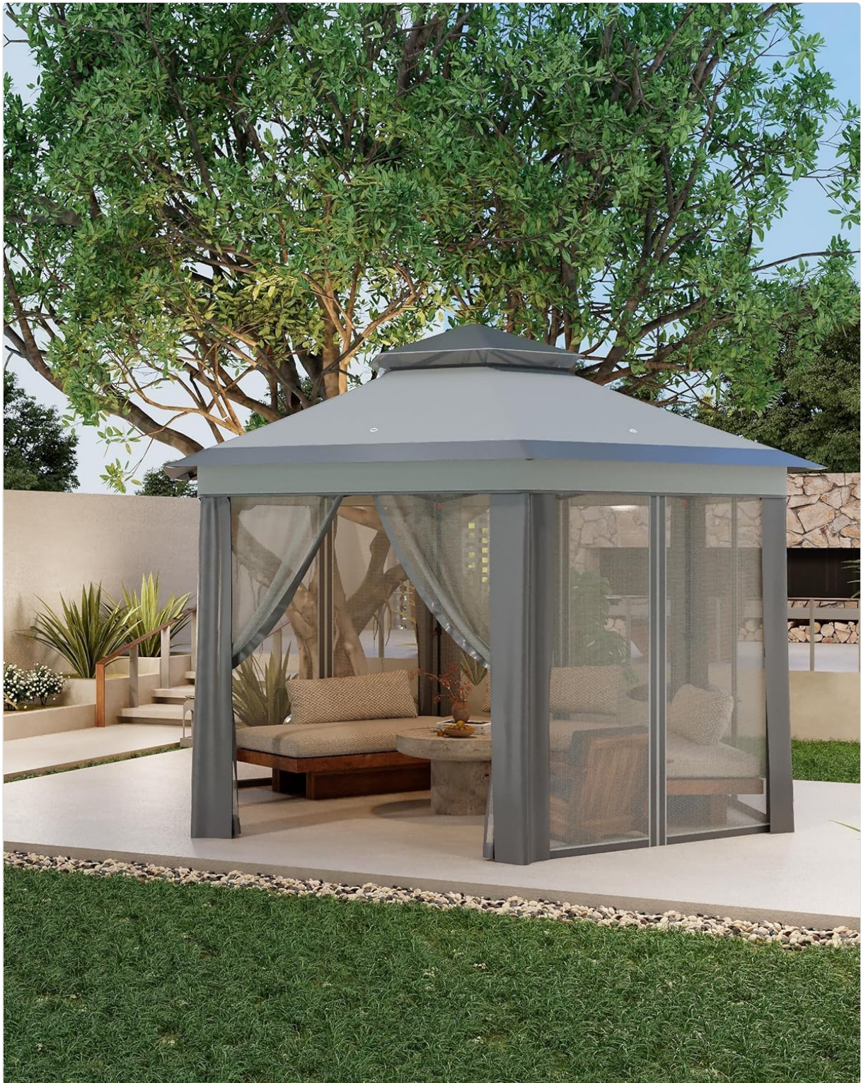
Figure 5.2: Key features and components of the gazebo.