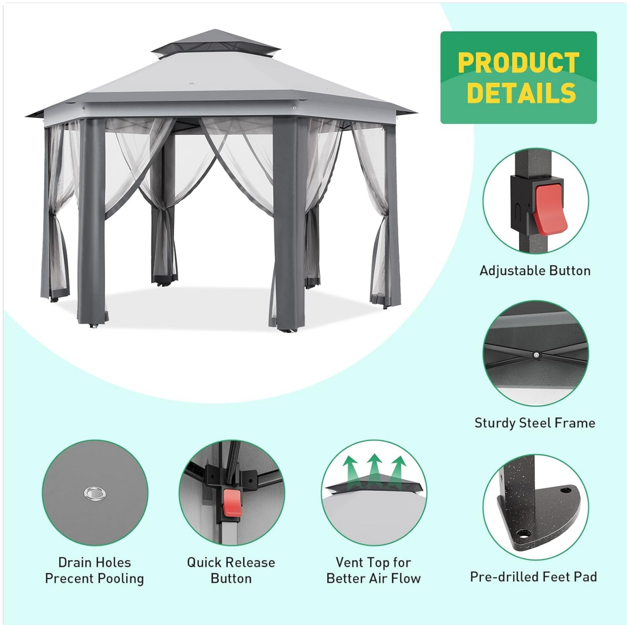
Figure 8.2: Performance specifications for the gazebo's weather resistance.