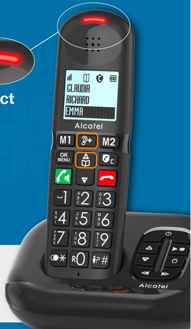
Image 3.2: A close-up of the Alcatel XL685 Voice handset, highlighting the large display, direct call keys (M1, M2), and the Audio Boost button. The image also shows the luminous signal for incoming calls and the phonebook icon, indicating its capacity for 100 contacts.

Permet de doubler le volume sonore en cours de conversation