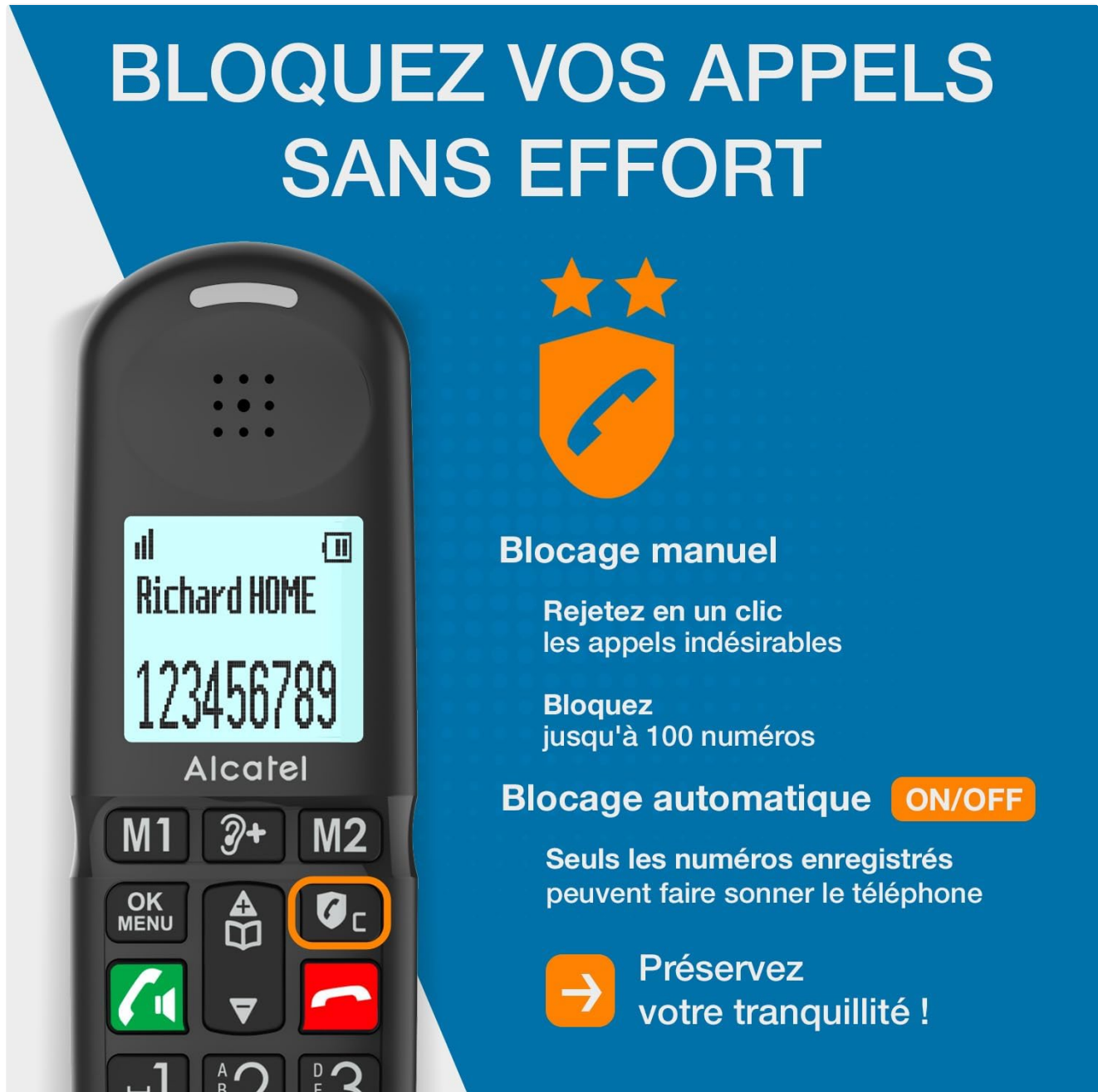
Image 6.1: This image illustrates the call blocking features of the Alcatel XL685 Voice. It shows the dedicated call blocking button on the handset, explaining both manual blocking (up to 100 numbers) and automatic blocking modes, which only allow registered contacts to ring through.

The Alcatel XL685 Voice offers advanced call blocking to protect you from unwanted calls.