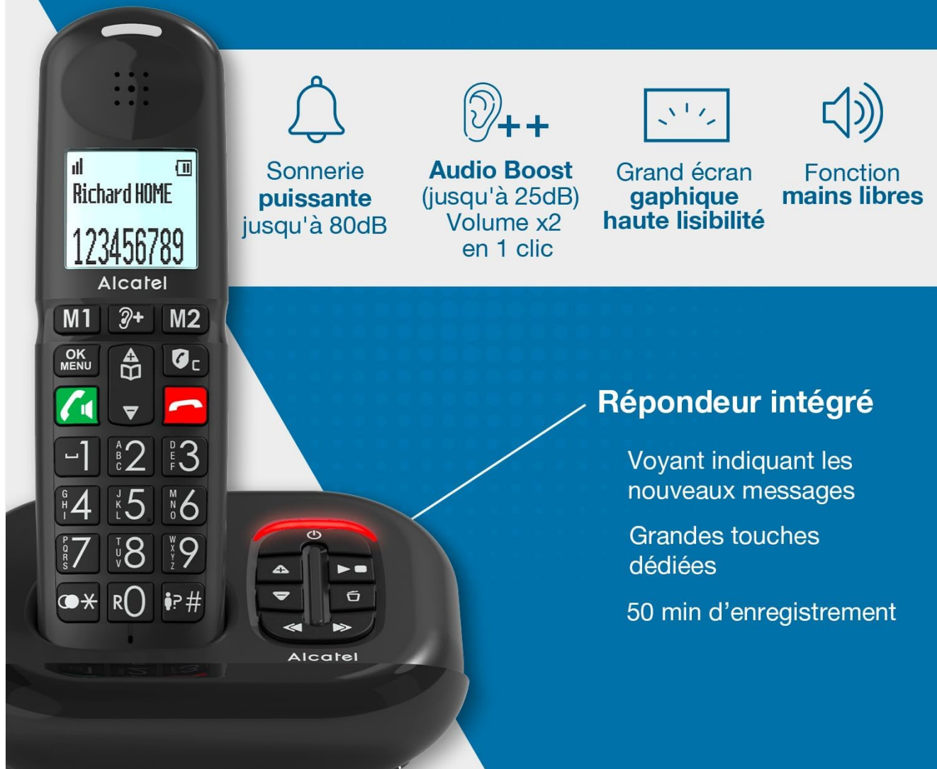
Image 3.1: The Alcatel XL685 Voice cordless phone, showing the handset docked in its base unit. The handset features a large display, clearly visible numeric keypad, and function buttons. The base unit includes controls for the answering machine.