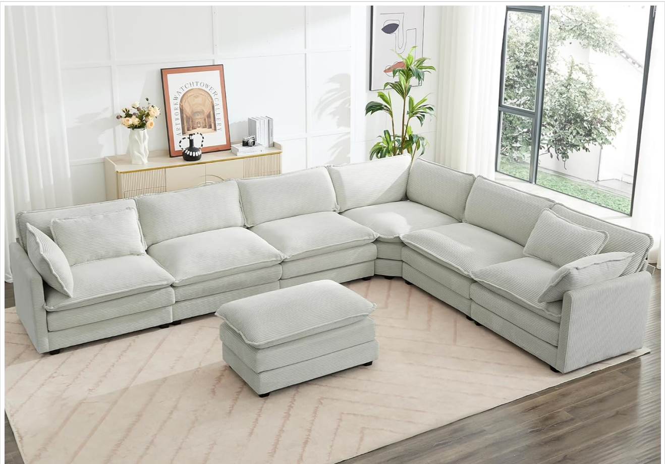
Figure 3: The ROWHY modular sectional sofa in a typical L-shaped configuration with an ottoman.