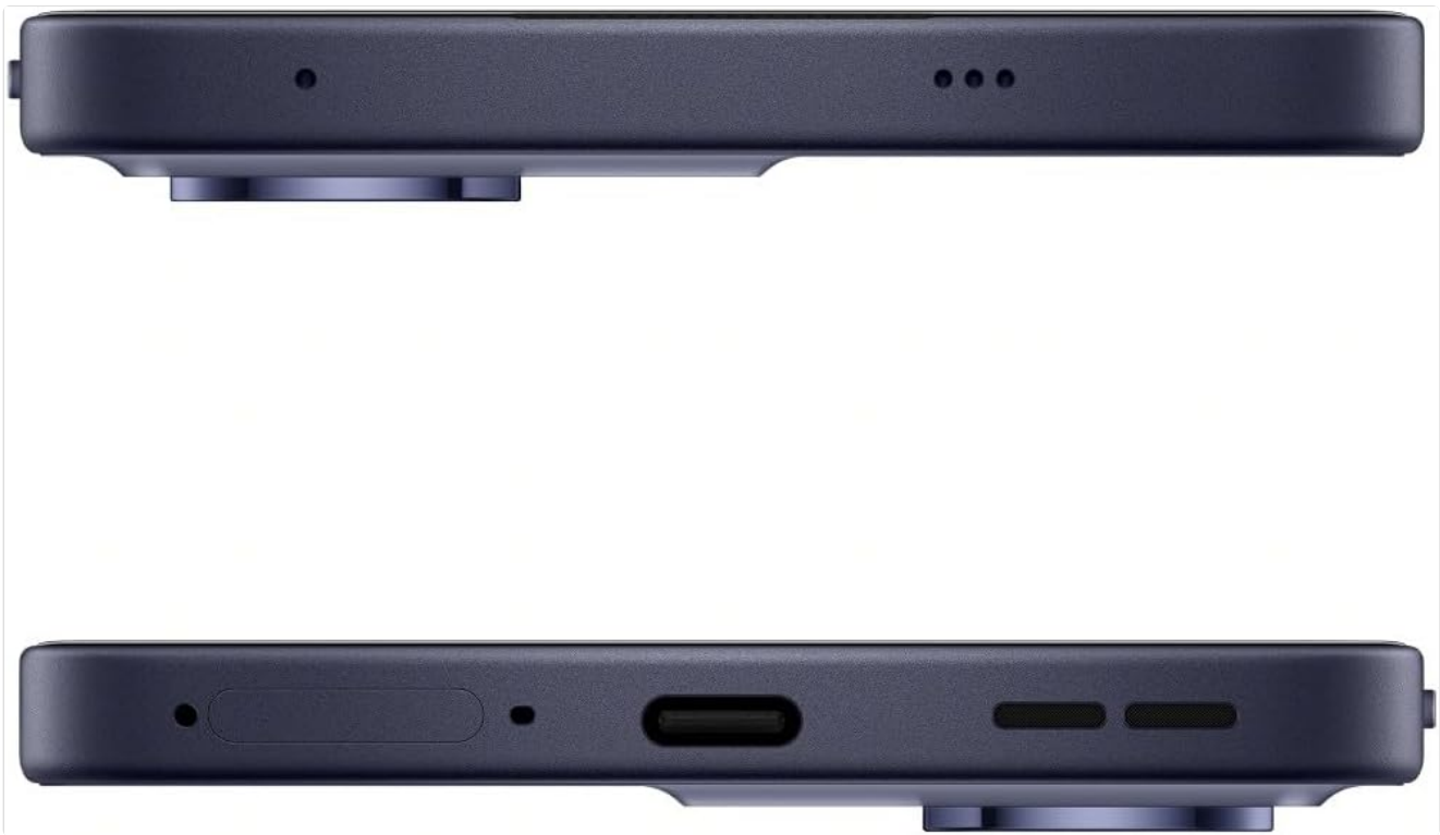
Figure 3.4: Top and bottom views of the OPPO Reno 13 F 5G. The bottom edge includes the USB-C charging port, speaker grille, and microphone. The top edge may contain a secondary microphone.