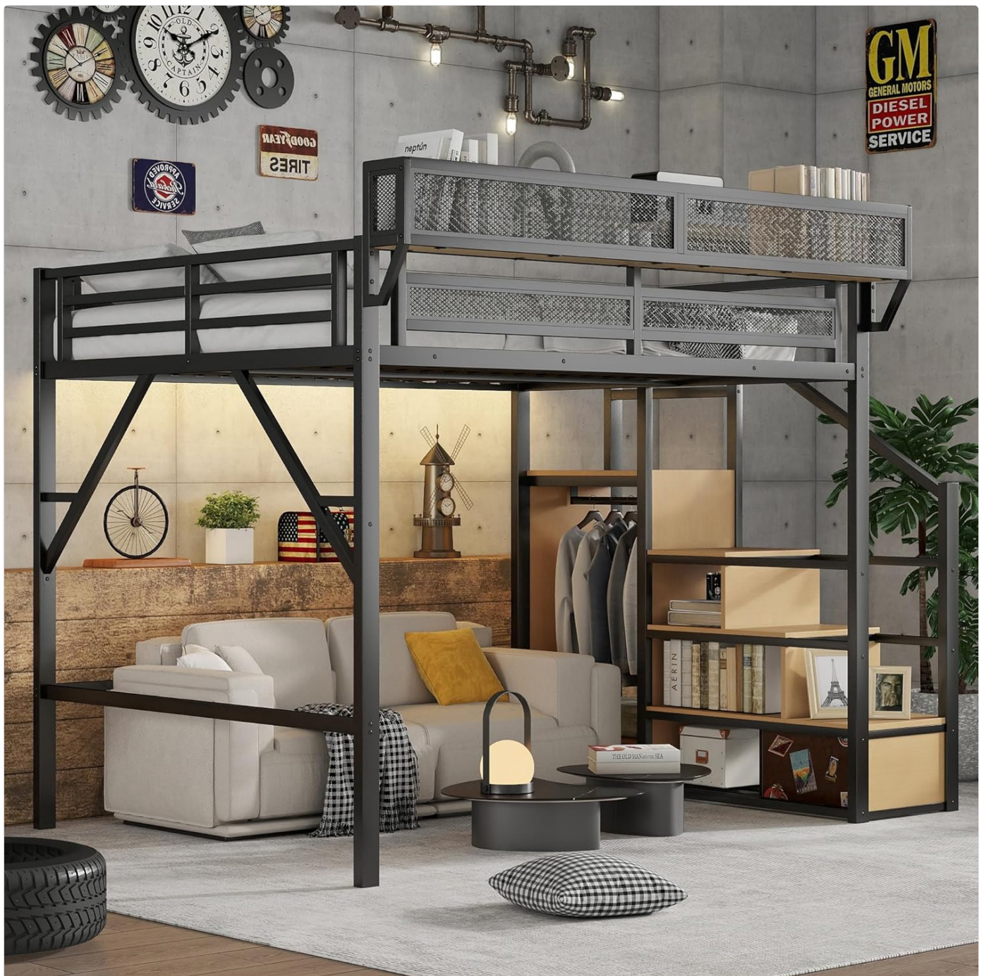
Image: Overview of the Queen Size Loft Bed, showcasing the bed frame, integrated stairs with shelves, and the spacious under-bed area with a sofa.