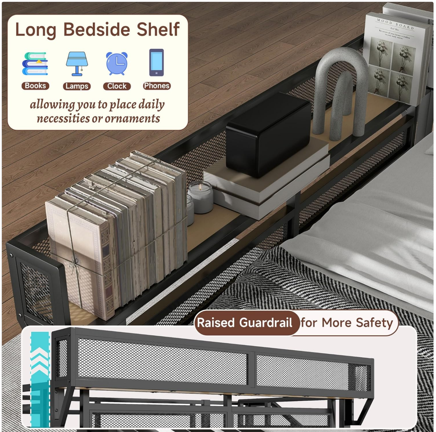
Image: A detailed view of the long bedside shelf, illustrating its capacity for books, lamps, clocks, and phones, emphasizing convenience and accessibility.

allowing you to place daily necessities or ornaments