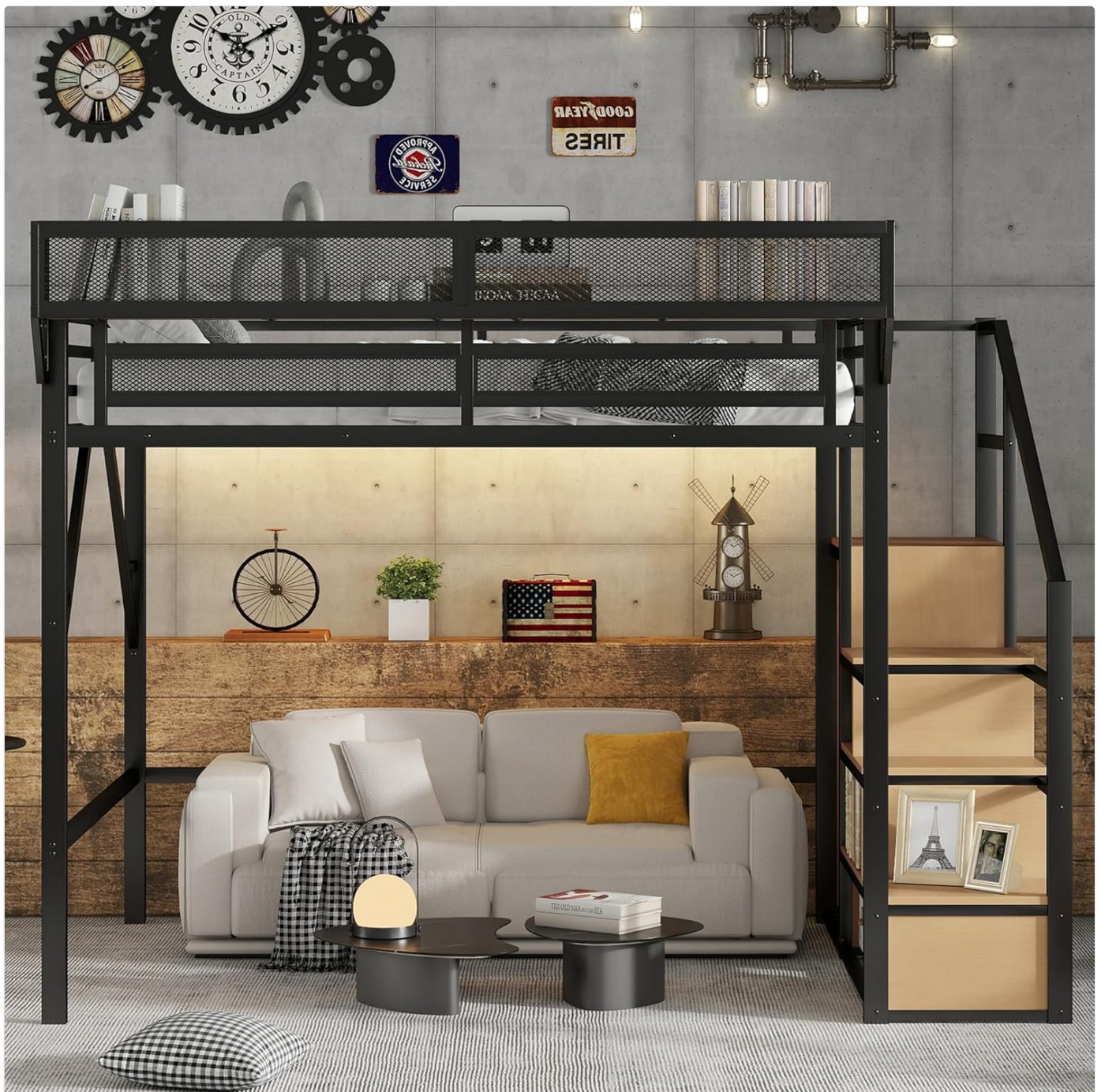
Image: Illustration highlighting the heavy-duty steel construction with thickened tubes, emphasizing the durability and robust nature of the bed frame.