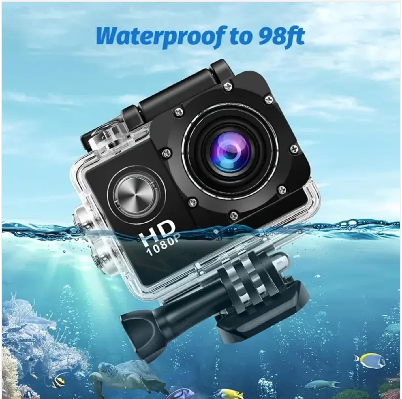
Figure 3.1: The camera in its waterproof housing, demonstrating its capability to be submerged up to 98 feet (approximately 30 meters). This housing protects the camera during water-based activities.