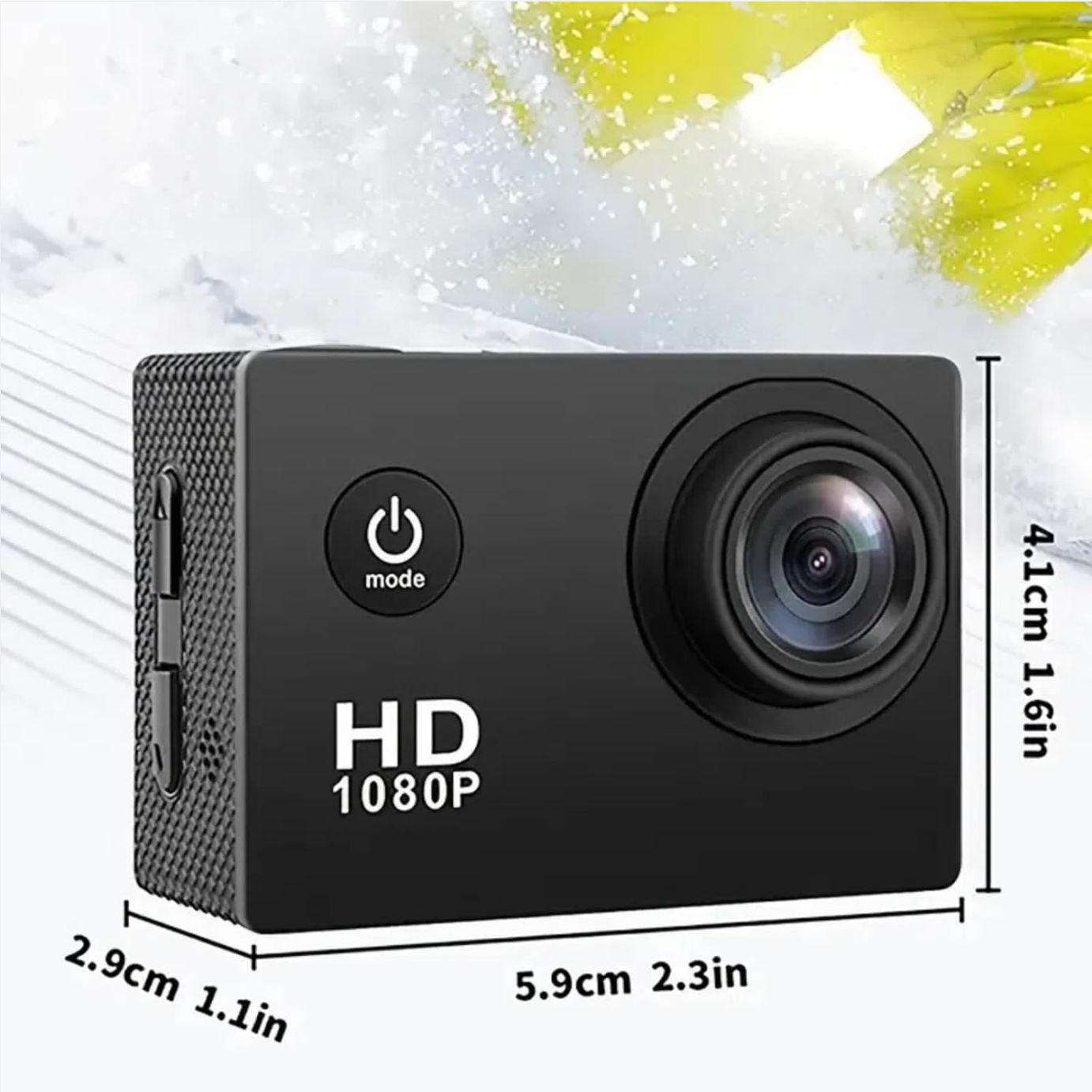
Figure 7.1: Physical dimensions of the Ourlife Sports Action Camera, showing its compact size for portability and ease of use.

For warranty information, technical support, or service inquiries, please contact Ourlife customer support. Details can typically be found on the product packaging or the official Ourlife website. Please retain your proof of purchase for any warranty claims.