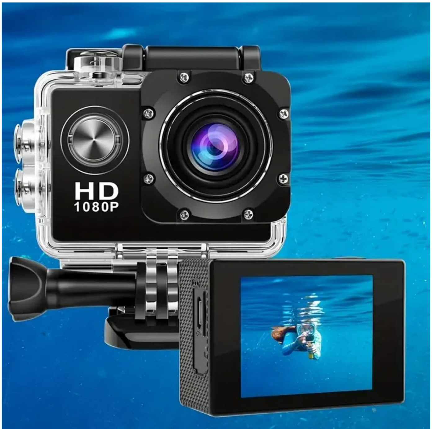
Figure 1.1: The Ourlife Sports Action Camera enclosed in its waterproof housing, ready for underwater use. The camera features an HD 1080P display and is designed for capturing dynamic visuals in various environments.