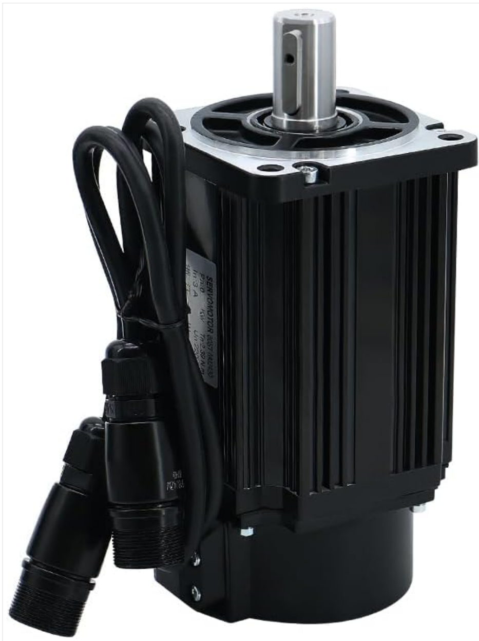
Figure 5.1: EC-80ST-M04025 Servomotor (left) and XP300-20A AC Servo Driver (right).