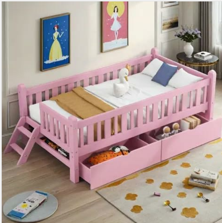
Image of the SOFTSEA Wood Twin Bed Frame, showcasing its design with fence rails and two pull-out drawers.