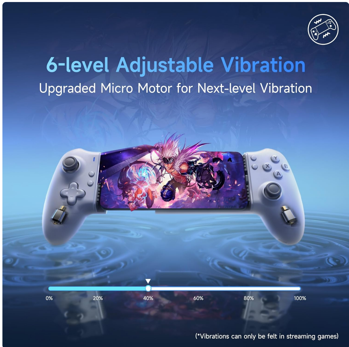
Figure 4: Visual representation of the 6-level adjustable vibration feature, indicating varying intensity levels for haptic feedback.

This feature provides next-level haptic feedback, enhancing immersion in compatible games. Note that vibrations are typically felt in streaming games.