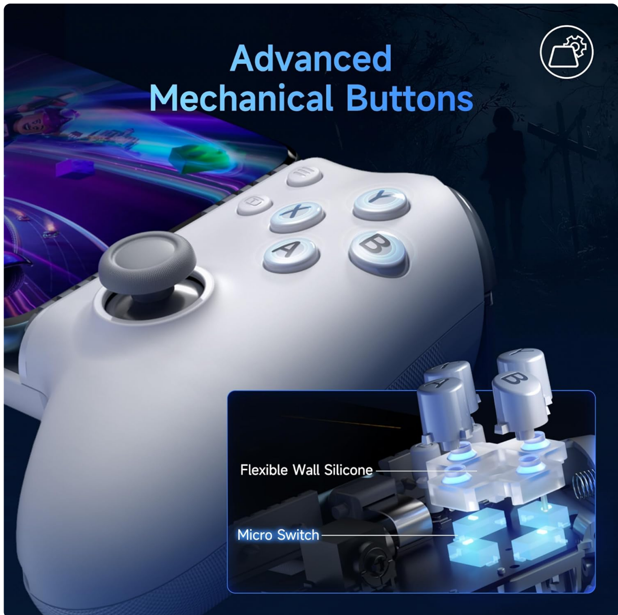
Figure 3: Illustration of the internal micro-switch mechanism within the controller's mechanical buttons, highlighting their design for tactile feedback and durability.

The controller features micro-switch buttons designed for durability and responsiveness. These buttons have a lifespan of up to 5 million clicks, providing fast response times, clear tactile feedback, and a distinct "click" sound for an enhanced gaming experience.