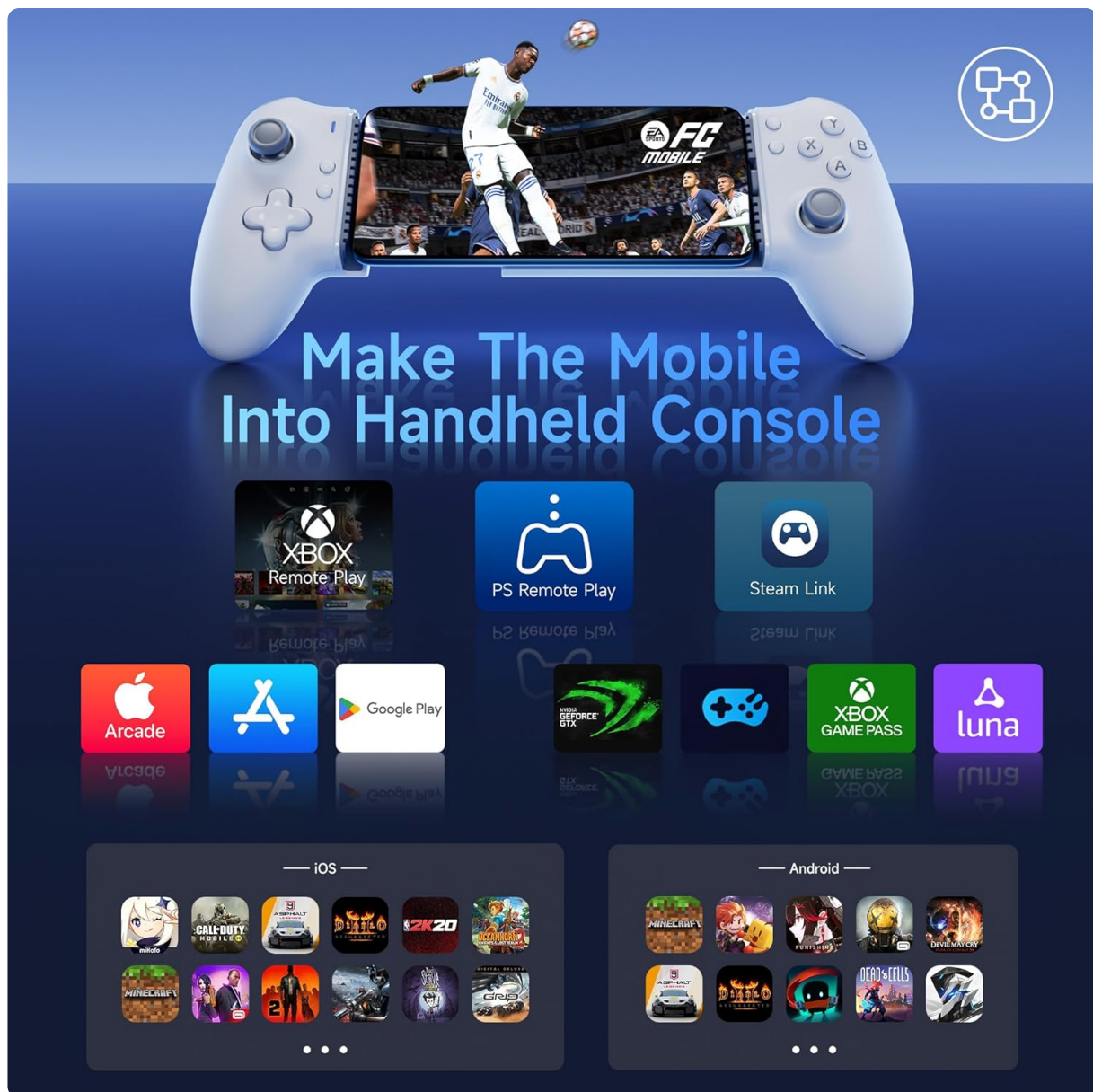
Figure 5: Overview of the controller's broad compatibility with cloud gaming services and popular mobile game titles across iOS and Android platforms.