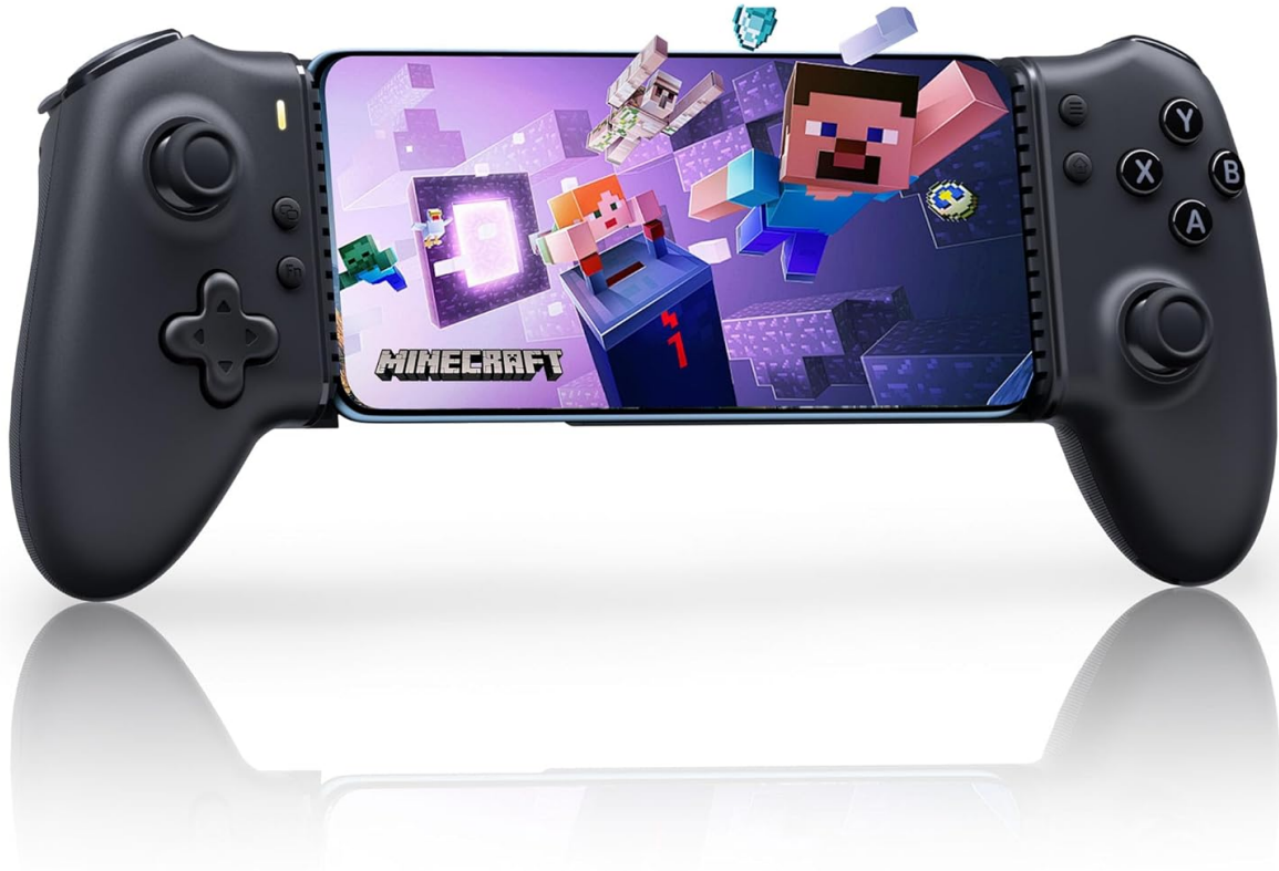
Figure 2: EasySMX M15 Black Mobile Gaming Controller with a smartphone inserted, demonstrating its compatibility with various game genres like Minecraft.