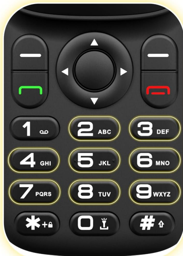
Image: The Uleway T185 phone with a magnified view of the keypad, indicating the speed dial functionality for keys 2-9.