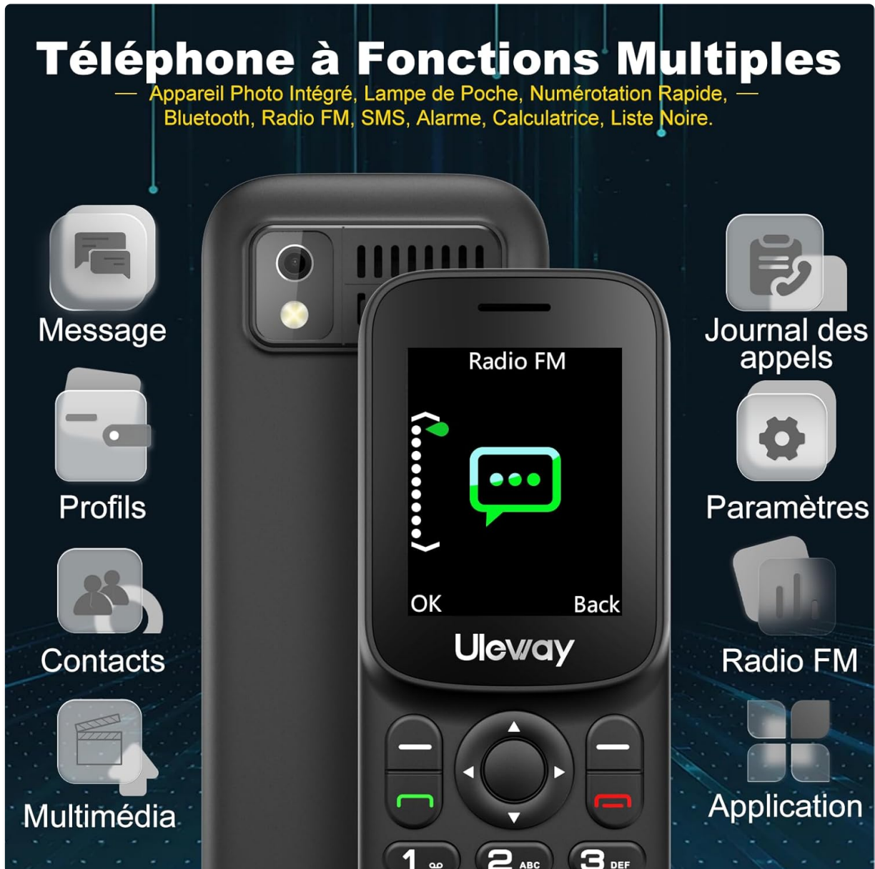
Image: The Uleway T185 phone showcasing its multi-functional interface, including options for messages, call logs, profiles, contacts, multimedia, settings, radio FM, and applications.

To power on the phone, press and hold the red "End Call" button until the screen lights up. To power off, press and hold the same button until the power-off options appear, then select "Power off".