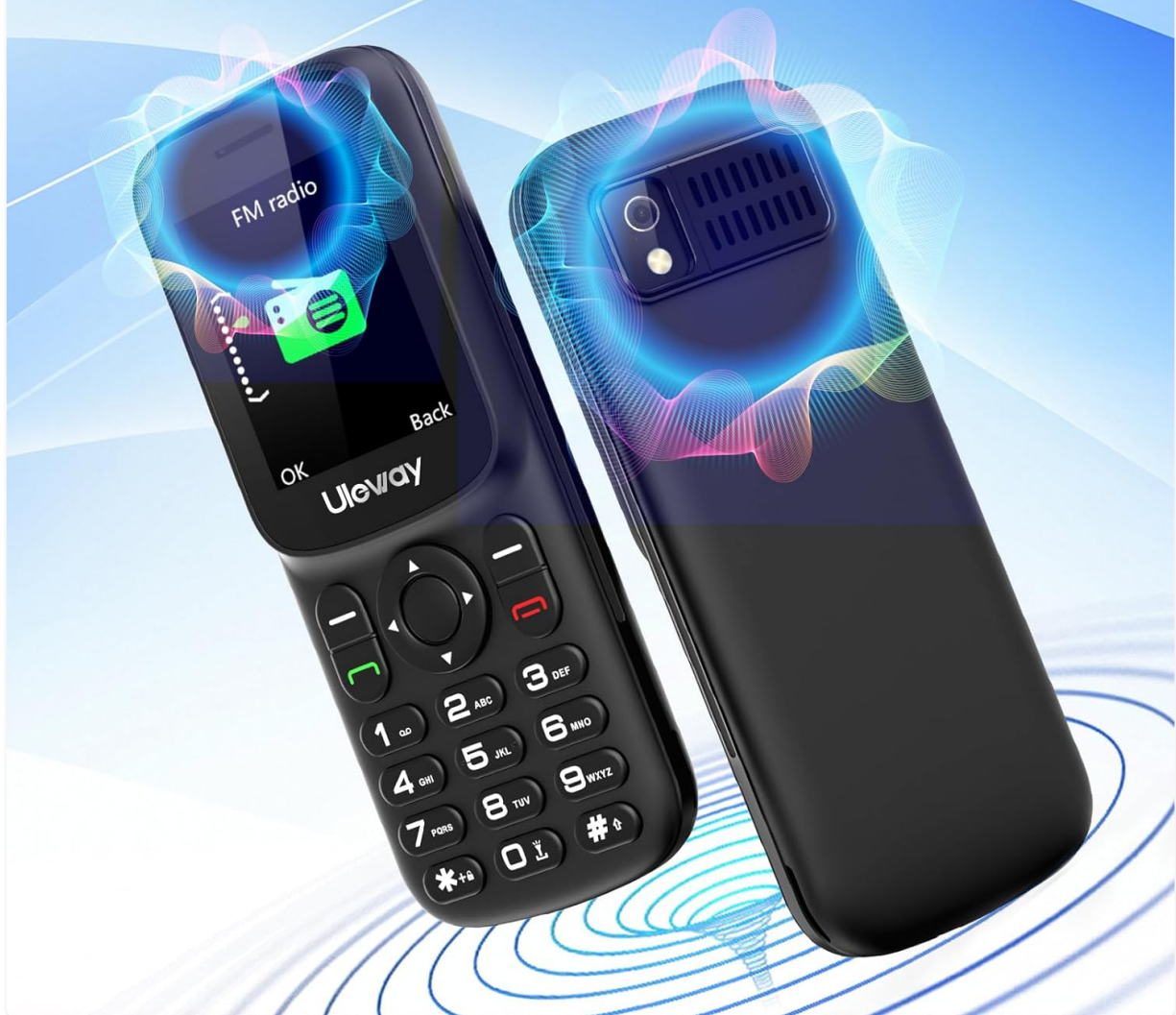
Image: The Uleway T185 phone emphasizing its clear stereo audio quality, with sound waves emanating from the speaker.

Le téléphone est équipé de haut-parleurs stéréo à son surround pour un son fort et clair.