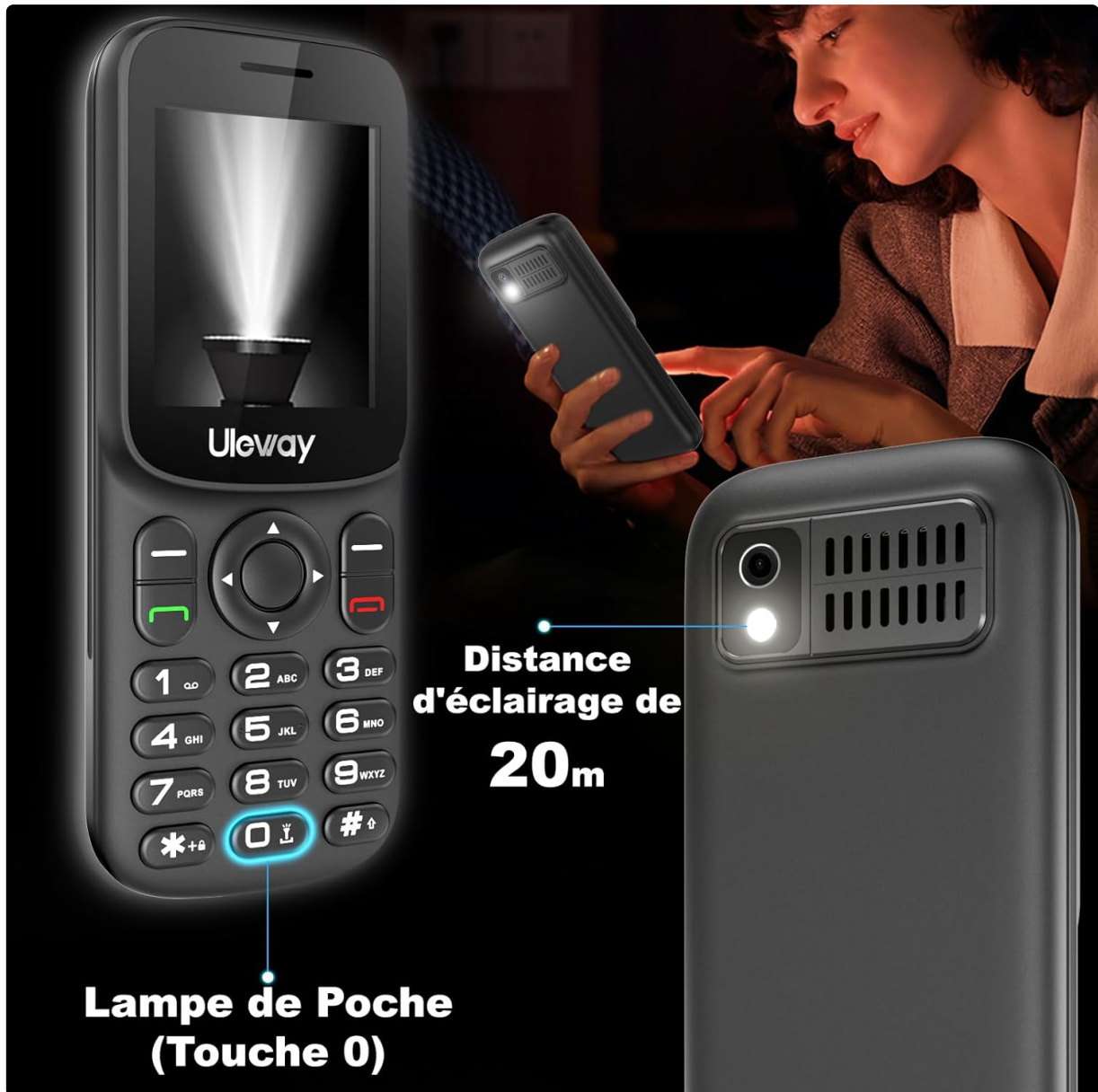
Image: The Uleway T185 phone demonstrating its flashlight feature, showing a bright beam illuminating a dark area.