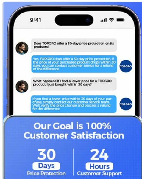
Image: TOPGRO Warranty Service contact information and process.