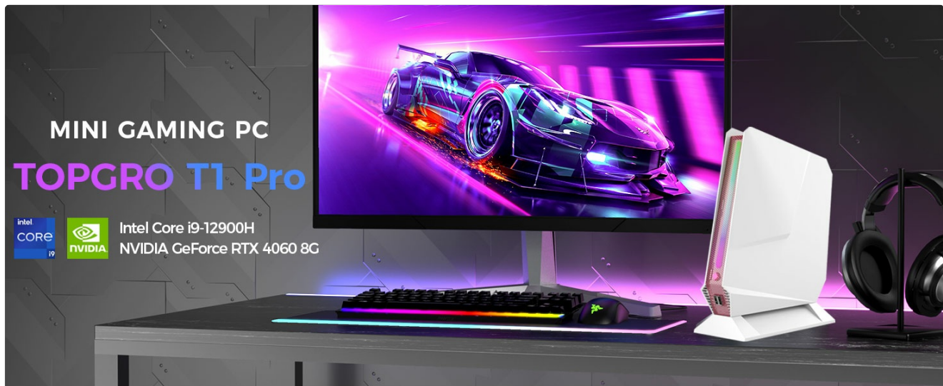
Image: Detailed specifications of the Intel Core i9-12900H processor.