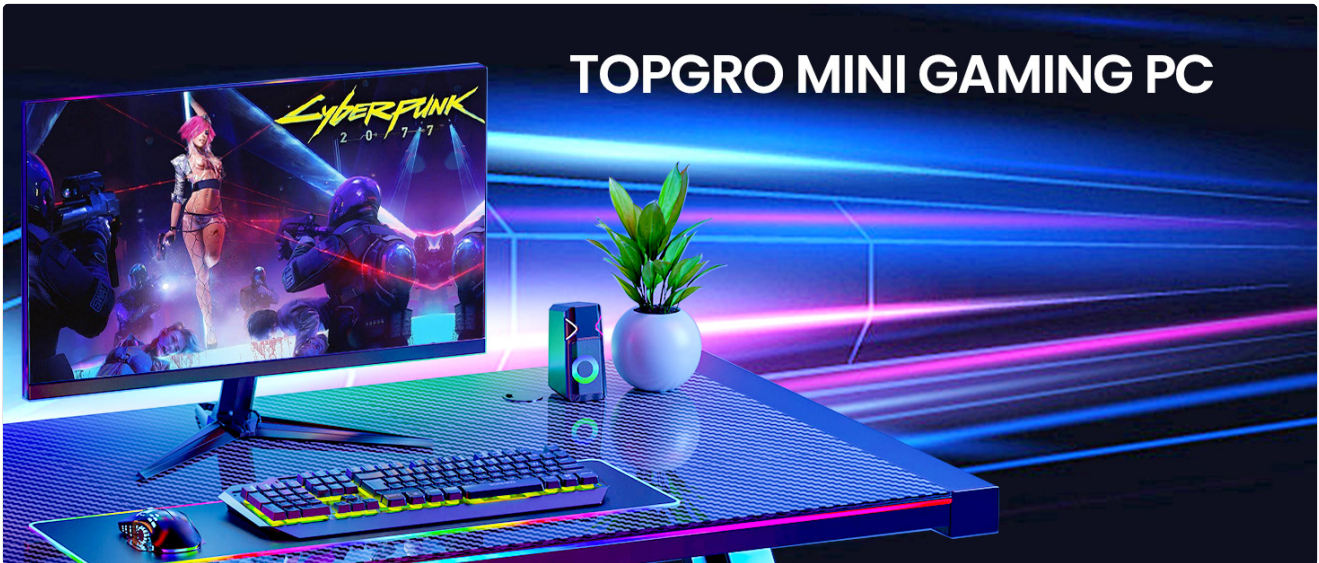
Image: The TOPGRO T1 Mini Gaming PC setup, showcasing its compact design and RGB lighting.

This manual provides essential information for setting up, operating, maintaining, and troubleshooting your TOPGRO T1 Mini Gaming PC. The T1 is a compact, high-performance desktop computer designed for gaming, business, and creative tasks. It features a 12th Gen Intel Core i9-12900H processor, NVIDIA GeForce RTX 4060 graphics, 32GB DDR5 RAM, and a 1TB PCIe 4.0 SSD, offering robust performance in a small form factor.