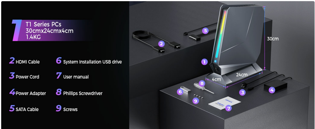
Image: Contents of the TOPGRO T1 Mini Gaming PC package, including the PC, cables, and manual.