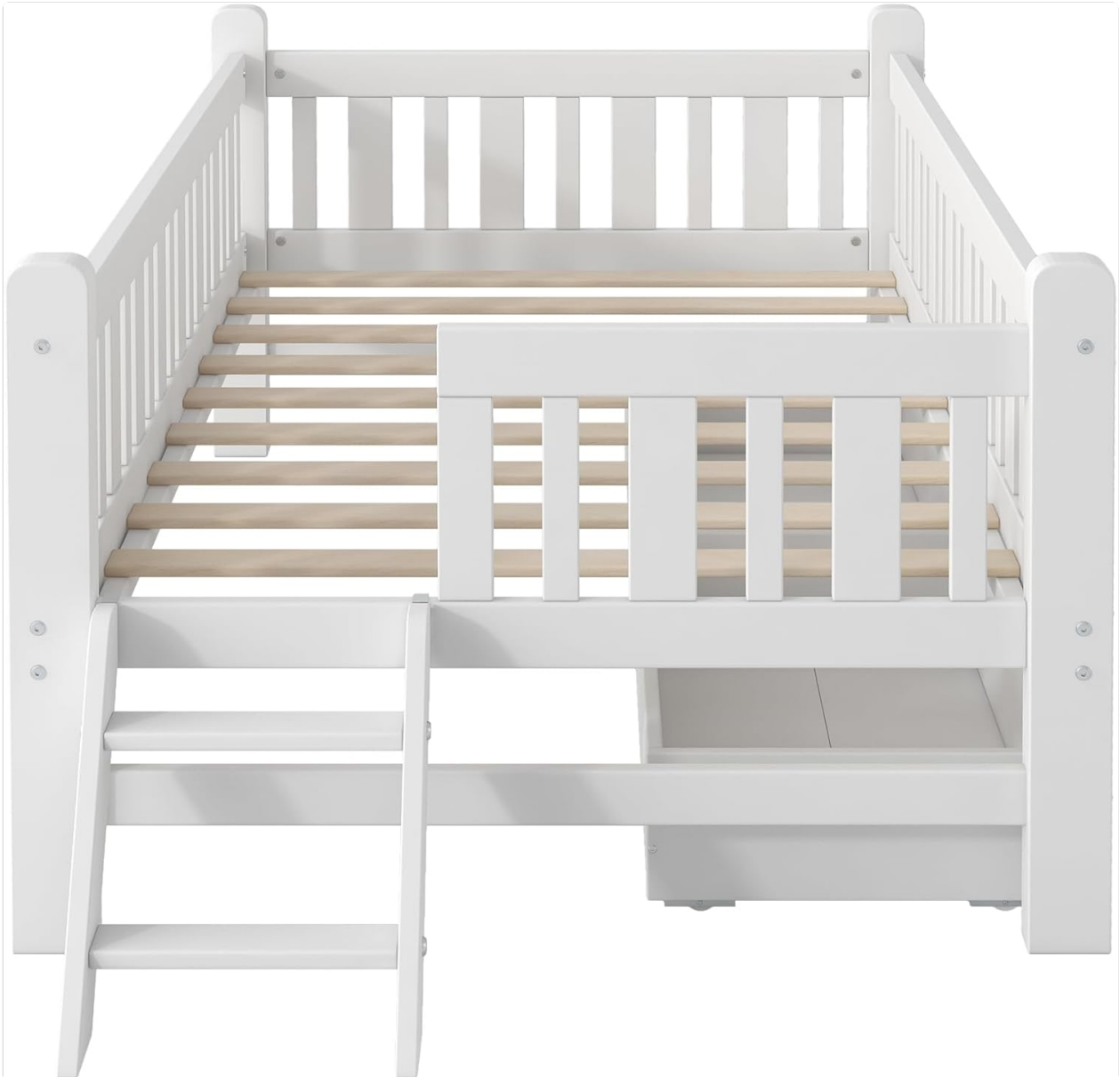
Image: An angled view of the SOFTSEA Wood Twin Bed Frame, showcasing both pull-out storage drawers fully extended. This illustrates the storage capacity and drawer mechanism.