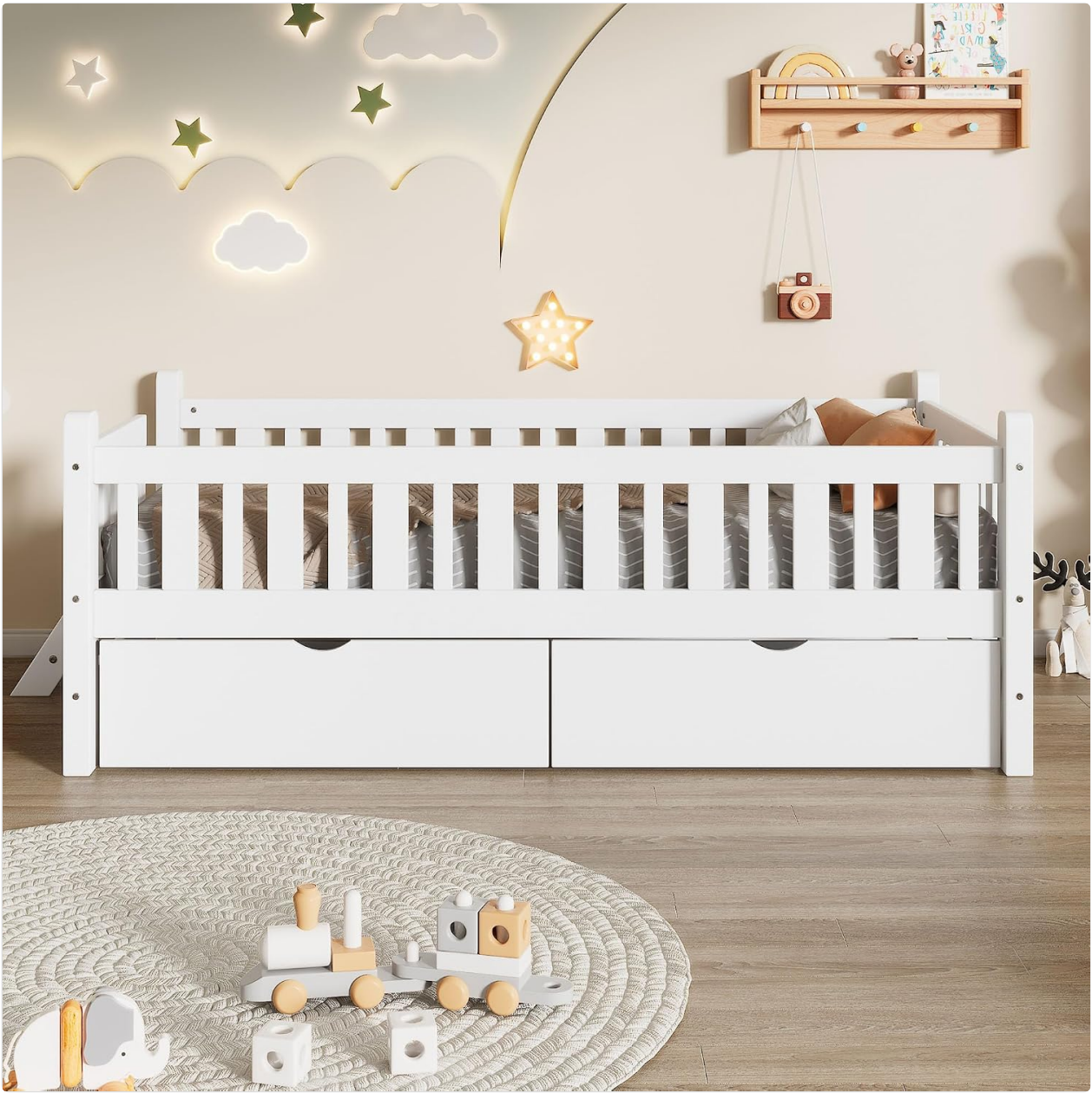
Image: The fully assembled SOFTSEA Wood Twin Bed Frame, shown in a child's room setting with the two storage drawers closed. The bed features white fence-style guardrails and a low-profile design.

All necessary tools and hardware for assembly are included in the package.