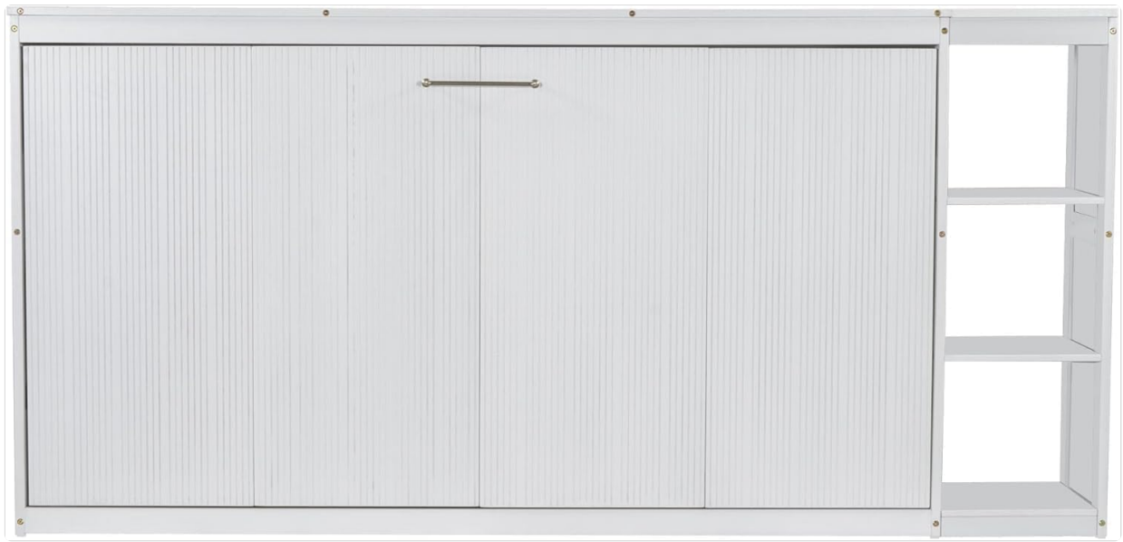
Image: The Virubi Twin Murphy Bed in its closed cabinet configuration, blending into the room as a storage unit.