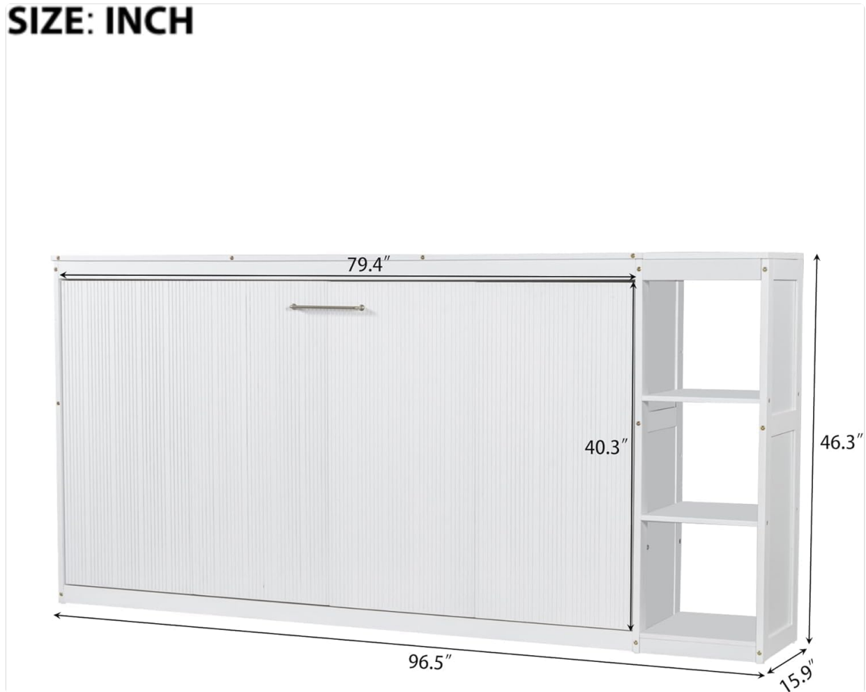
Image: Dimensional drawing of the Murphy bed in the closed cabinet position, including overall depth.