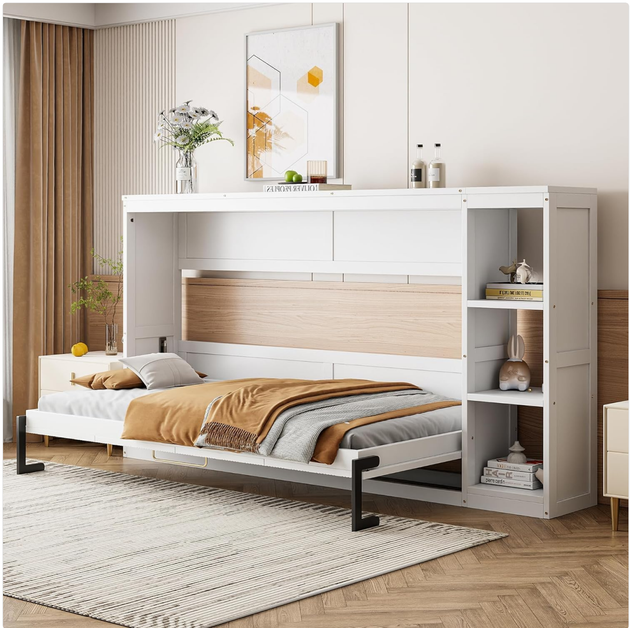
Image: The Virubi Twin Murphy Bed shown in its open configuration, ready for use, with adjacent storage shelves.