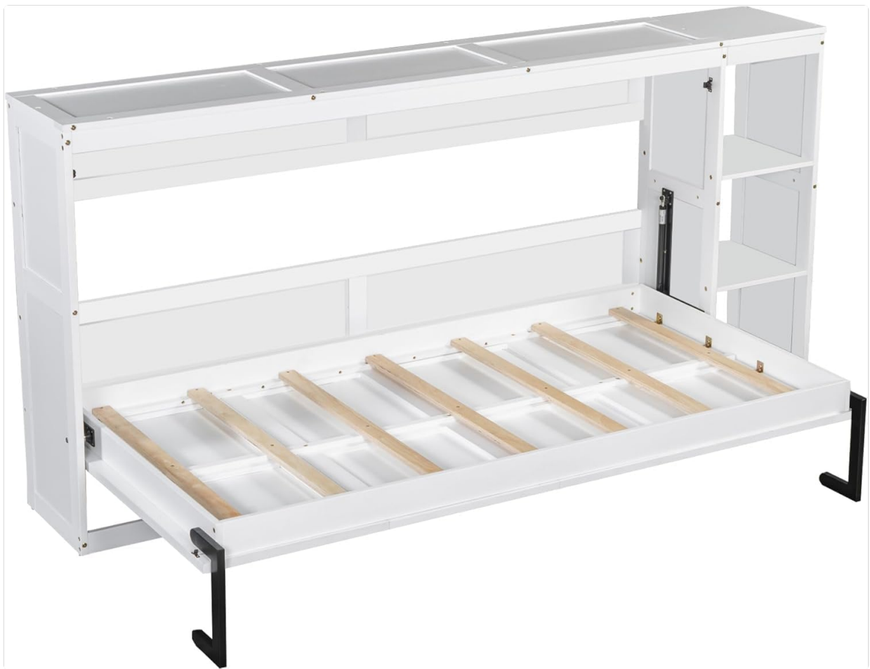
Image: Close-up of the bed frame and slat system, illustrating the internal structure and support.