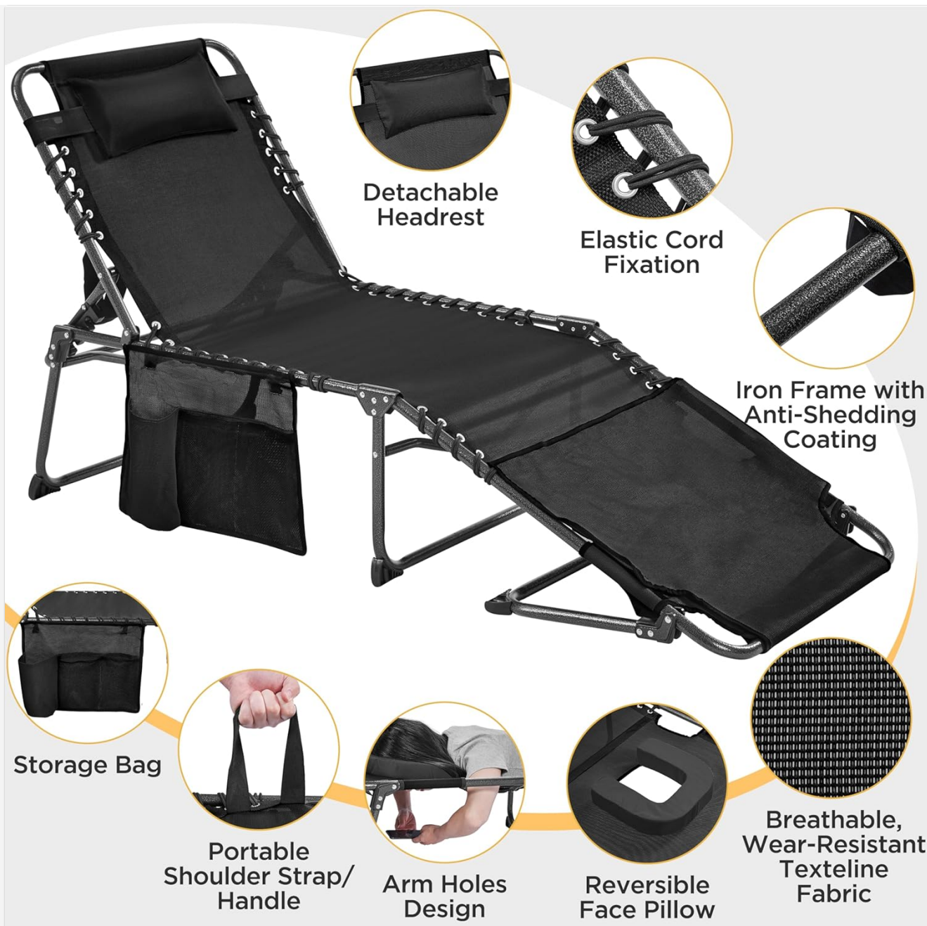
Figure 3.1: Key components and features of the Tanning Chair.