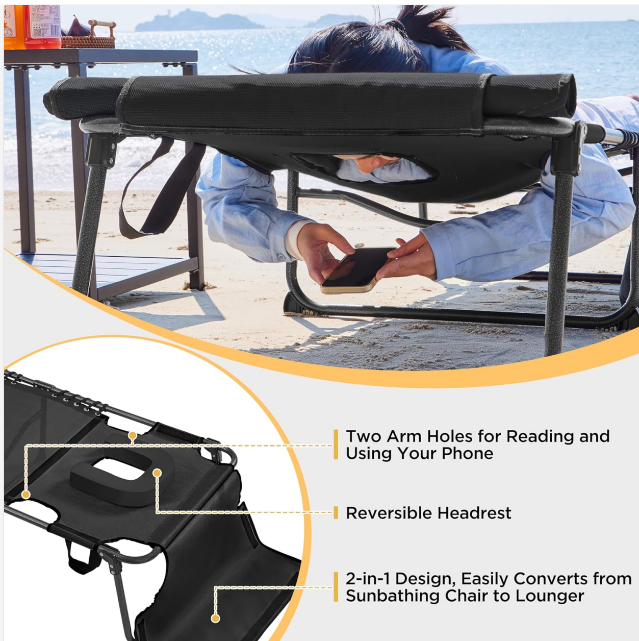
Figure 5.2: Utilizing the face hole and arm holes for face-down relaxation.