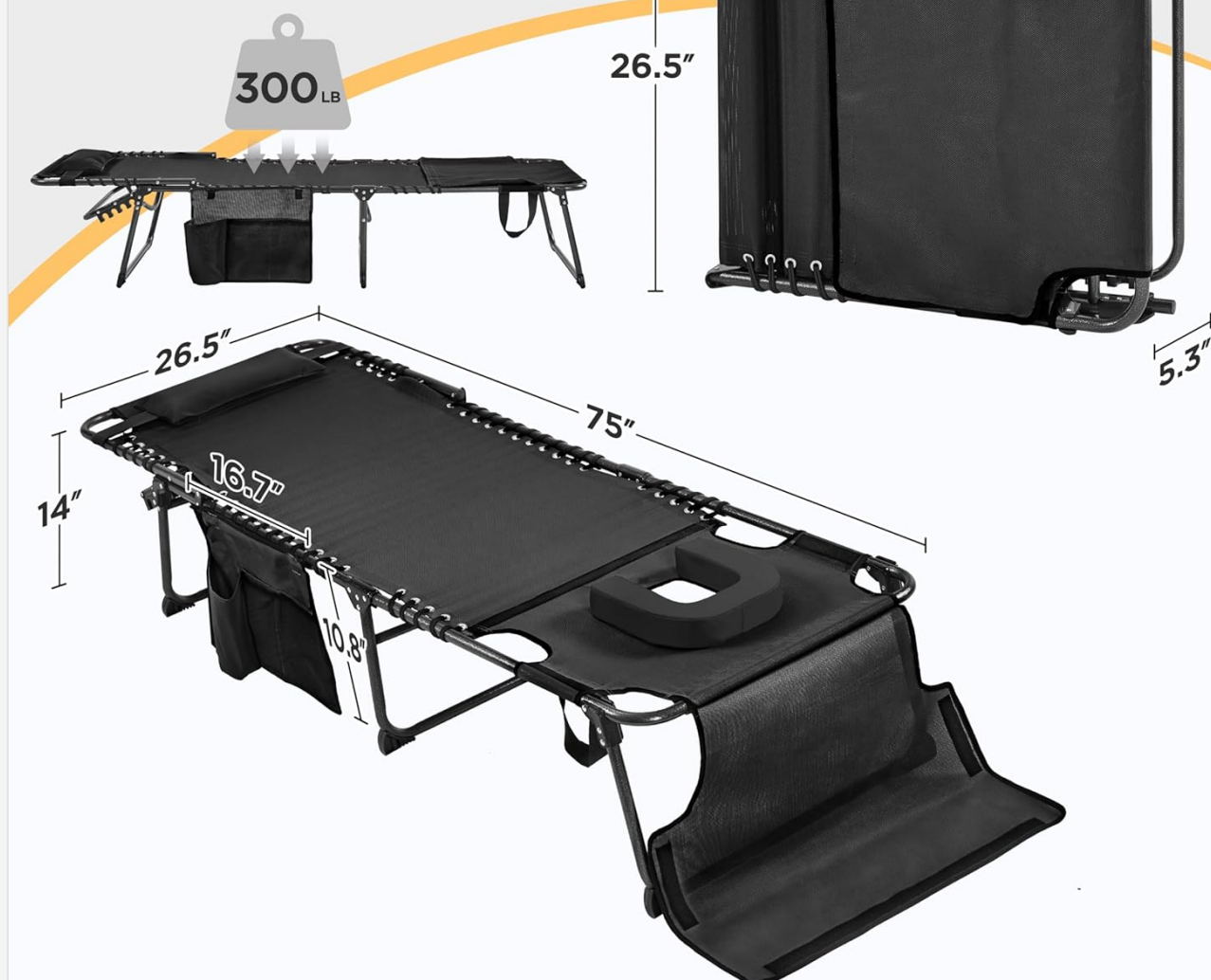
Figure 8.1: Product dimensions and load capacity.