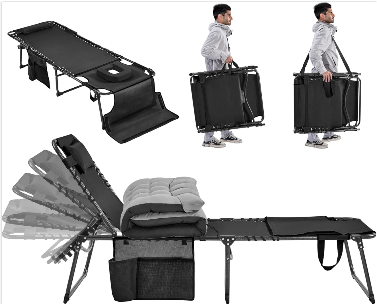
Figure 1.1: Overview of the Yaheetech Folding Tanning Chair, showing its various configurations and portability.