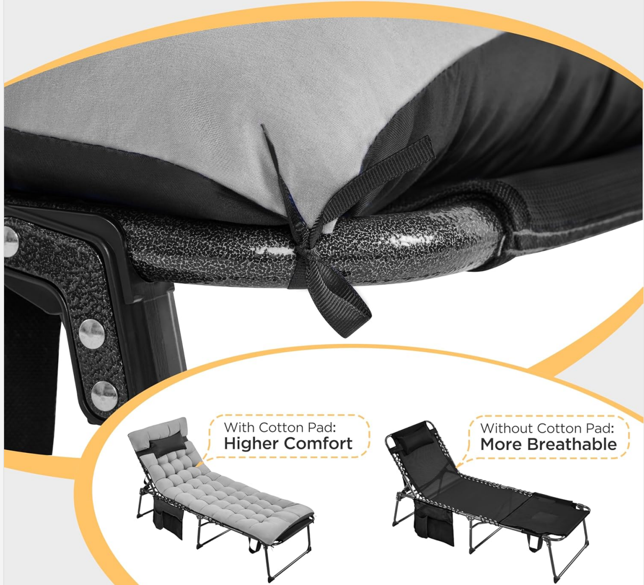
Figure 4.1: Securing the removable padded cushion to the lounge frame.