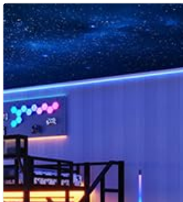
Figure 3: The staircase can be installed on either the left or right side of the bed.