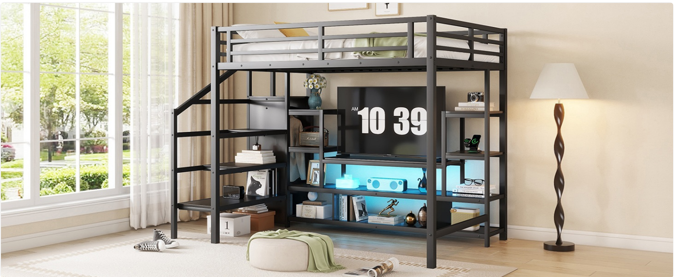
Figure 10: High full-length guardrails for safety.