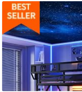
Figure 4: Integrated charging station for convenience.