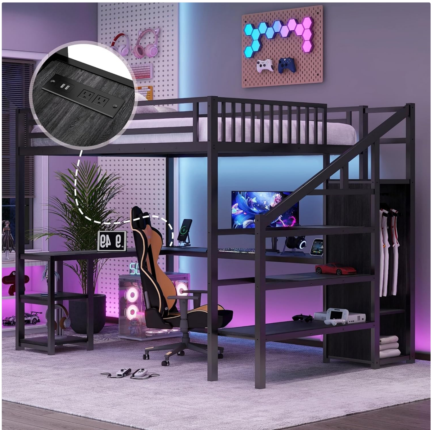
Figure 6: Staircase with integrated storage and wardrobe.