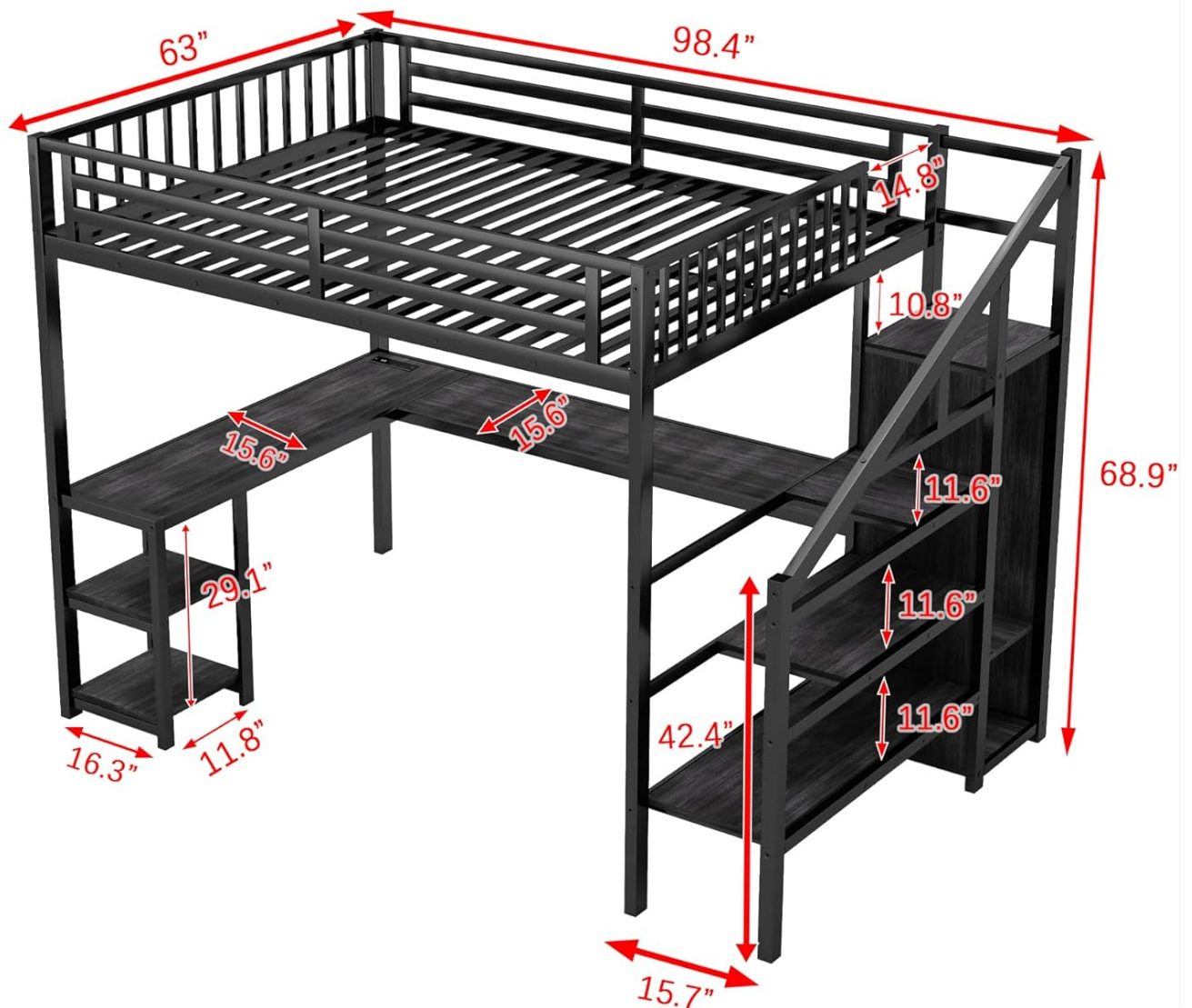
Figure 2: Product dimensions for planning your space.