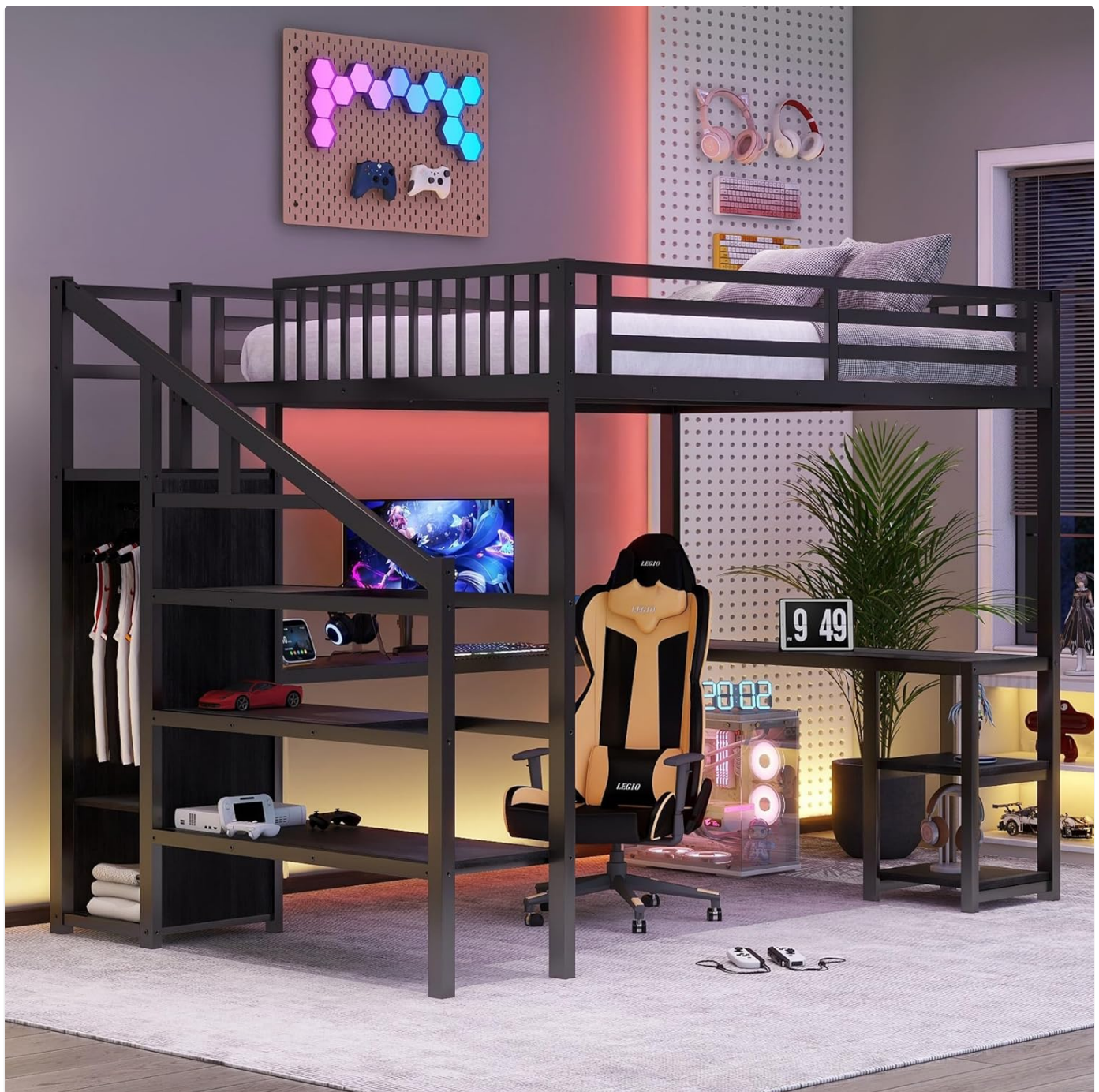
Figure 1: Overview of the Mirightone Queen Size Gaming Loft Bed.