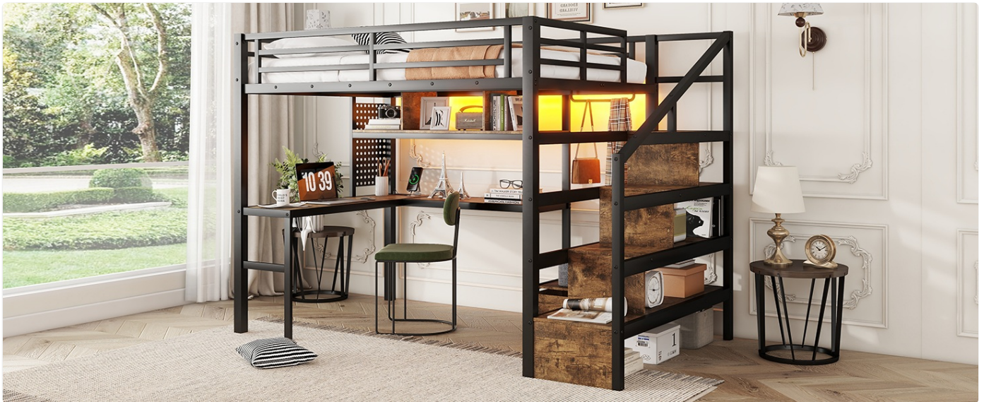
Figure 5: RGB LED lighting with remote control for customizable ambiance.