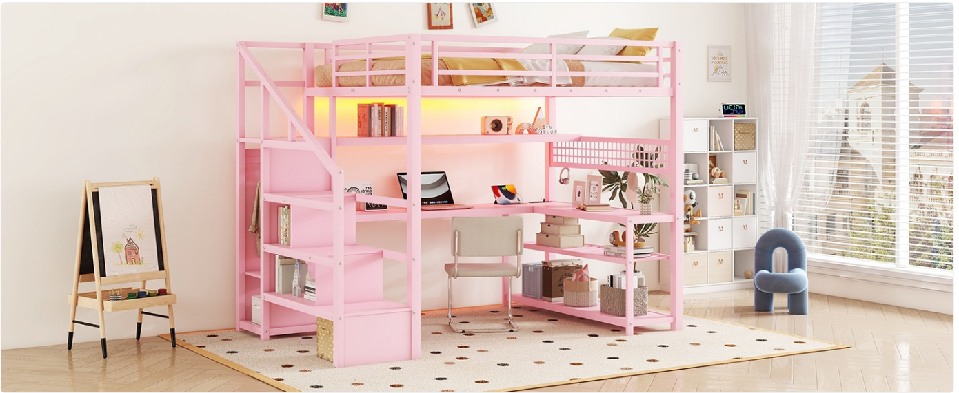
Figure 9: L-shaped desk dimensions and space utilization.