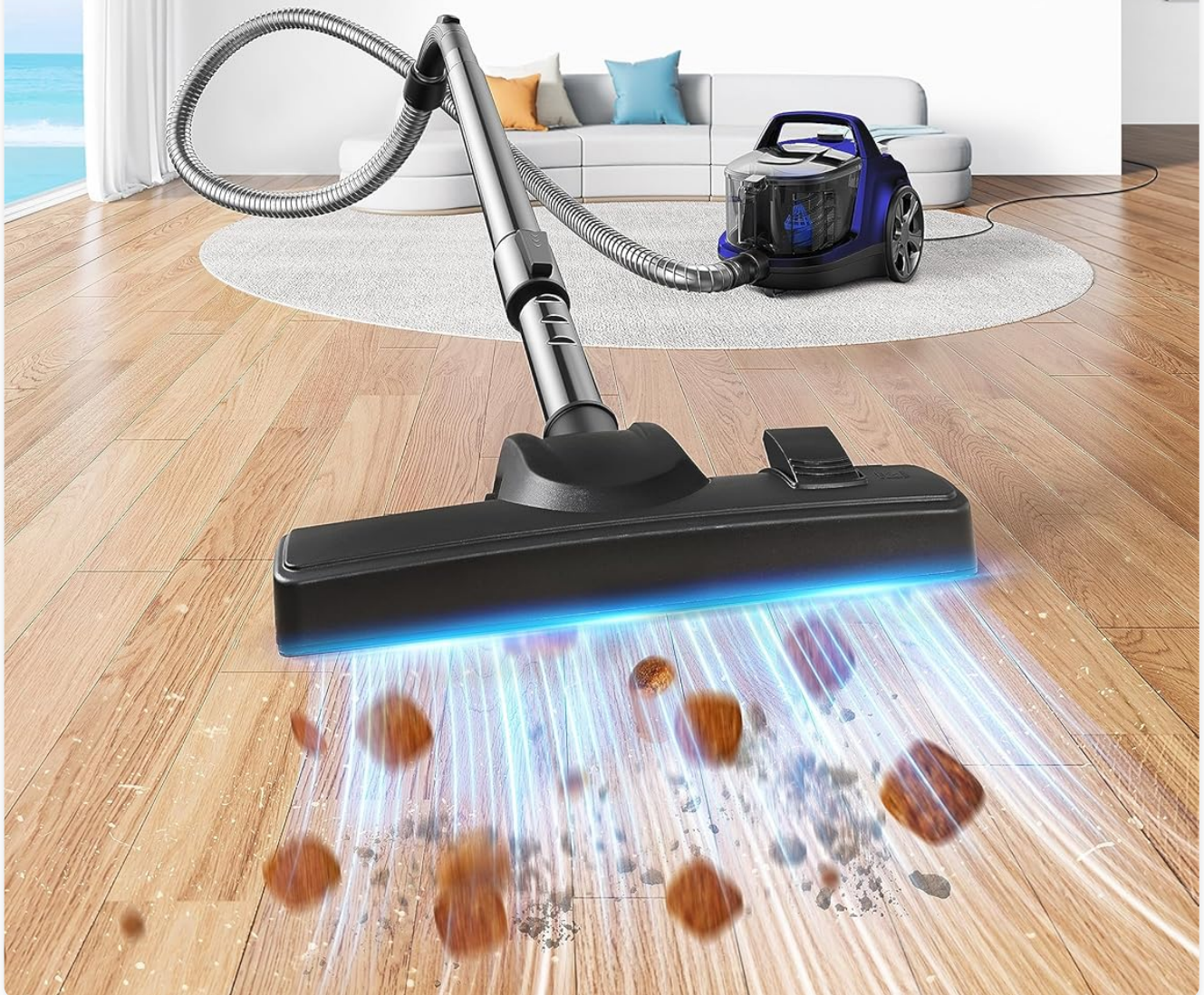
Image: The Aspiron Canister Vacuum Cleaner fully assembled, ready for use.