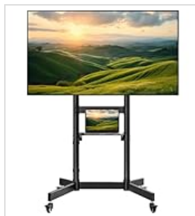
Image: The safety screw keeps your TV fixed and prevents it from sliding.