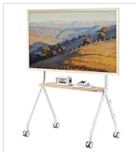
Image: Integrated cable routing hides messy wires for a clean setup.