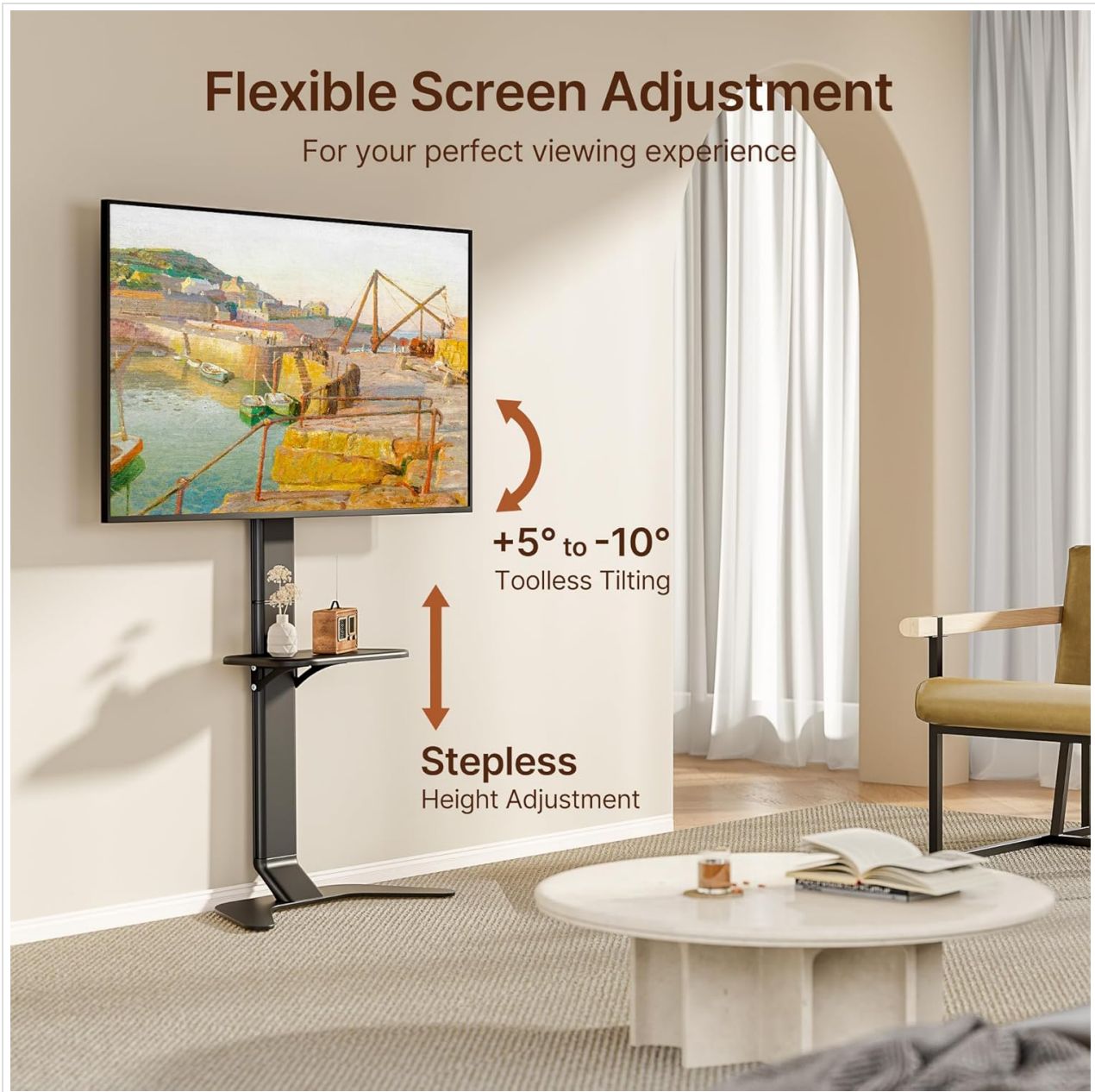
Image: Flexible screen adjustment allows for tool-free tilting and stepless height changes.

The screen can be tilted from +5° to -10° without tools. Gently push or pull the top or bottom of your TV screen to achieve the desired tilt angle. The mechanism is designed to hold the position once adjusted.