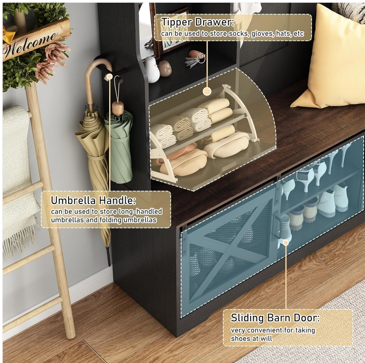
Image 2: Detailed view of the hall tree's storage components, highlighting the tipper drawer, umbrella holder, and the sliding barn door mechanism for shoe access.