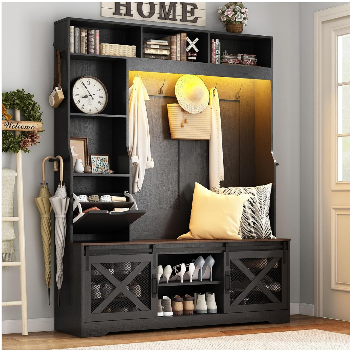
Image 1: The chartustriable LED Farmhouse Hall Tree, fully assembled. This image displays the overall design, including the bench, shoe cubbies, coat hooks, and upper storage shelves.