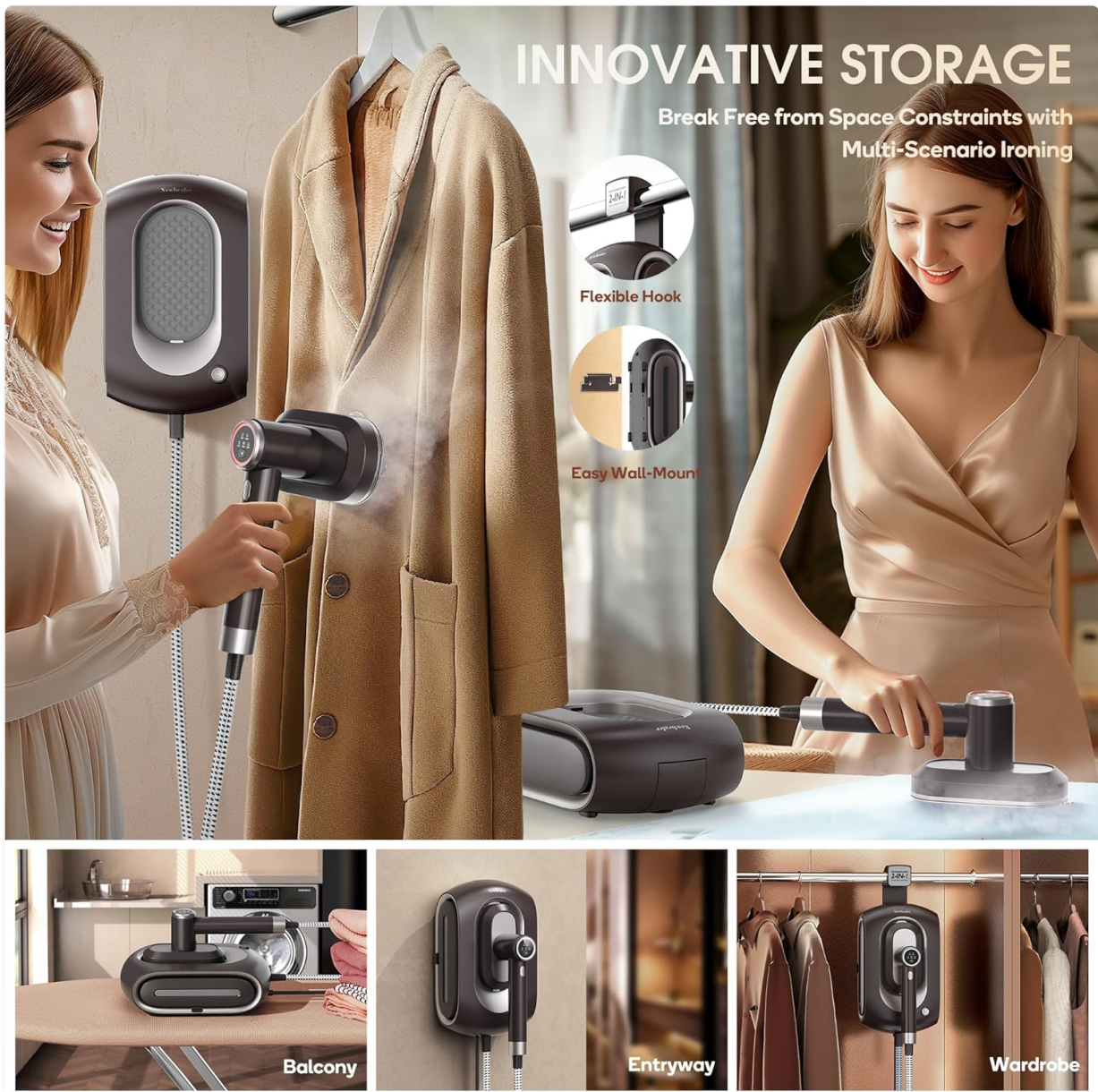
Image: The Newbealer Pro Steam Station Iron (NB318A) showcasing its innovative storage capabilities, including a flexible hook and easy wall-mount feature, suitable for use in balconies, entryways, and wardrobes.