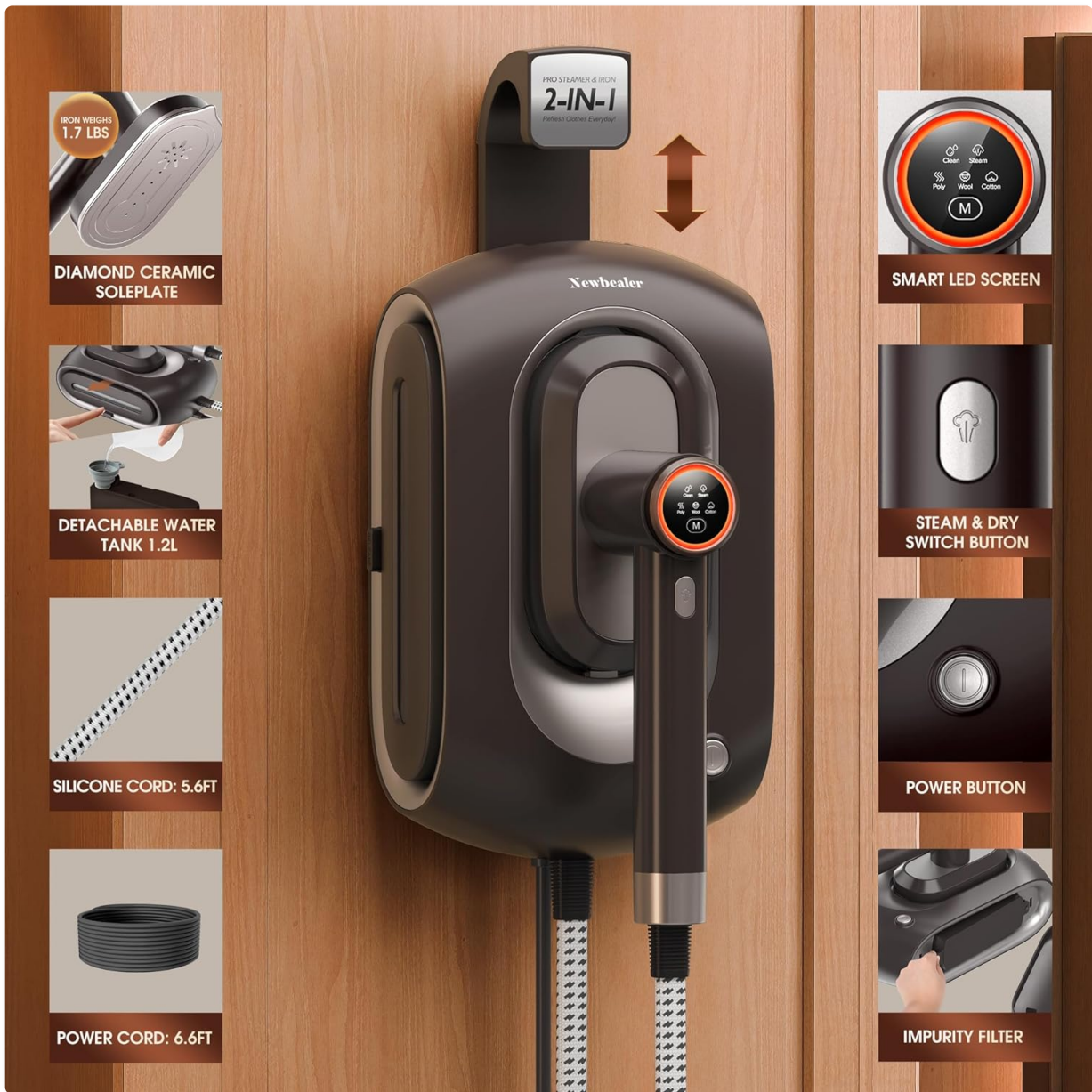
Image: Key features of the Newbealer Pro Steam Station Iron (NB318A), highlighting the smart LED screen, 1.2L detachable water tank, silicone cord, power cord, steam & dry switch button, and impurity filter.