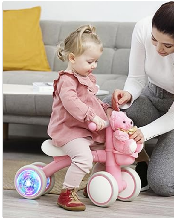
Figure 3: The 3-position adjustable seat ensures a comfortable fit for growing toddlers.