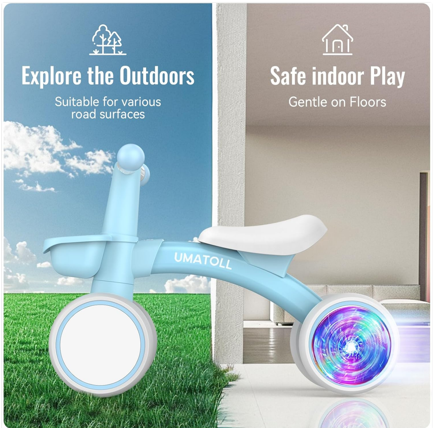
Figure 5: The bike's lightweight construction allows for easy handling by both children and adults.