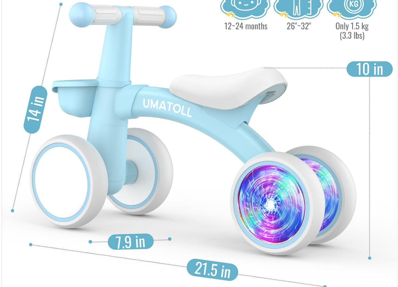
Figure 4: The steering limit design helps prevent rollovers, making the bike safer for young riders.