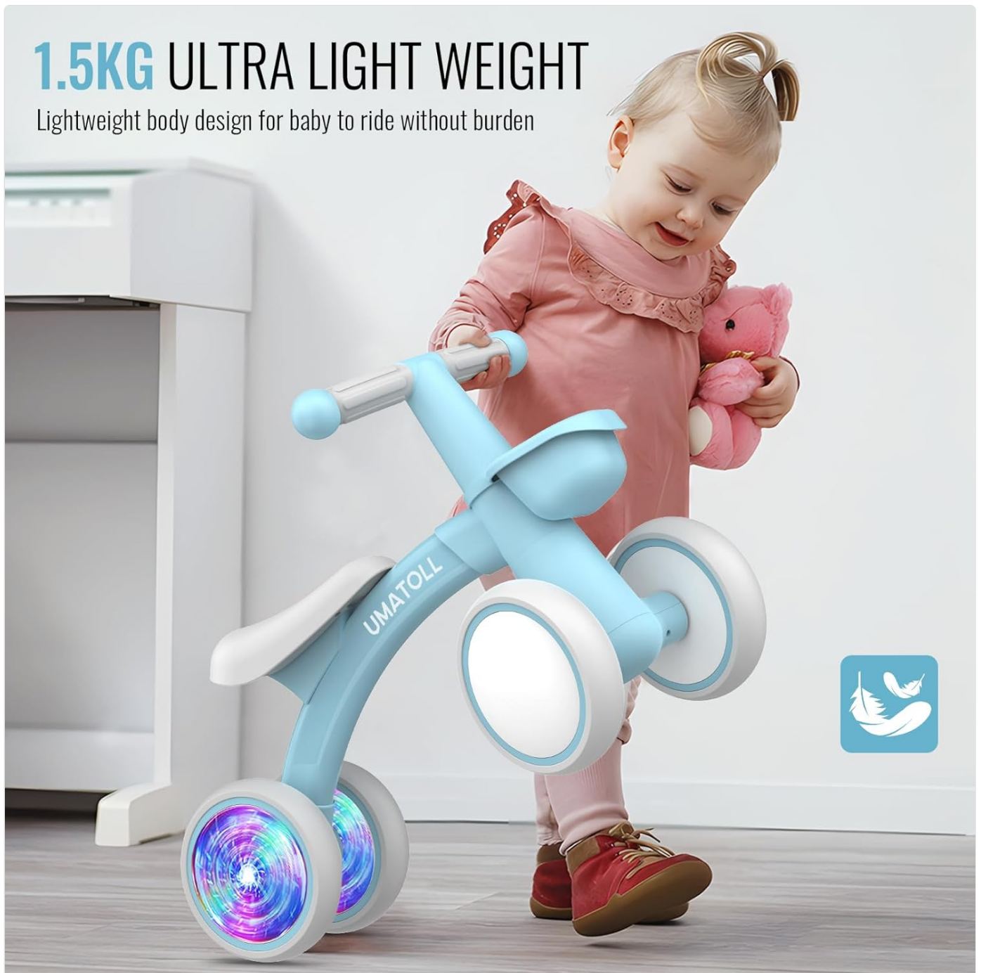
Figure 2: The colorful light-up rear wheels enhance playtime without needing batteries.

Lightweight body design for baby to ride without burden