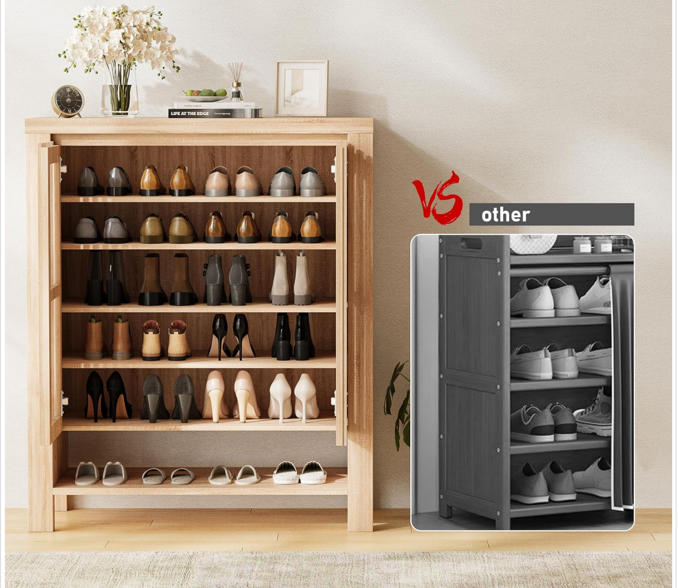
Image 5: A comparison image highlighting the versatile design of the INNOD shoe cabinet with its doors open, showcasing ample storage, next to a smaller, less versatile cabinet.

Your browser does not support the video tag.