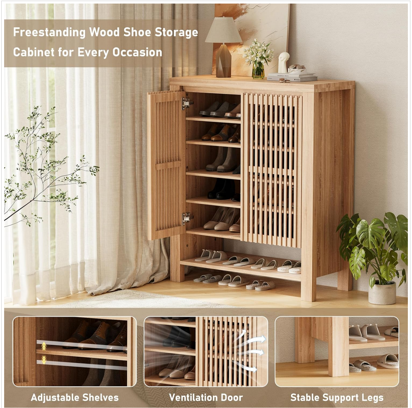
Image 2: The assembled shoe storage cabinet positioned in an entryway, highlighting its freestanding design, adjustable shelves, ventilation doors, and stable support legs.