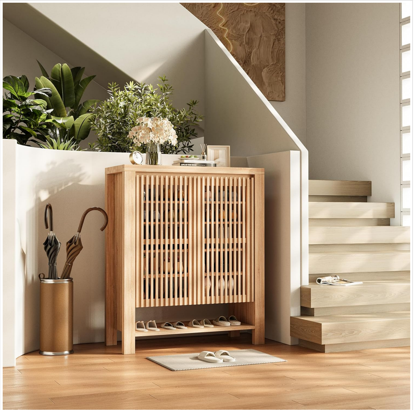
Image 3: The shoe cabinet integrated into a modern entryway with plants and stairs, demonstrating its aesthetic appeal and functional placement.

Your browser does not support the video tag.