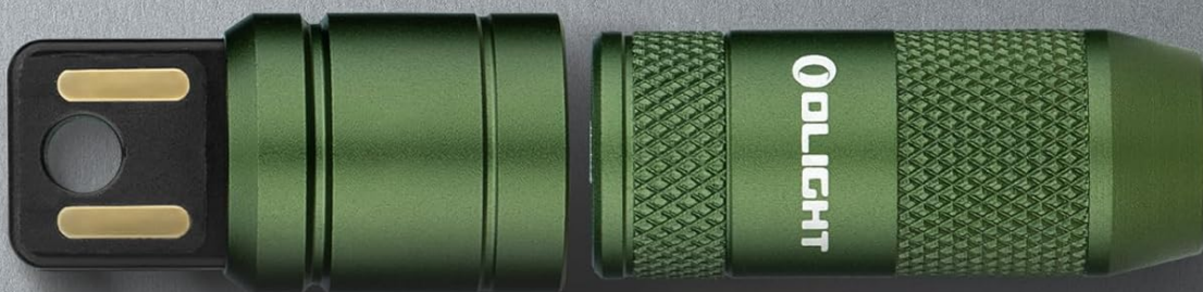
Image: The IMINI 2 flashlight showing how it illuminates instantly when separated from its magnetic base.

Ensuring that you have immediate access to light when you need it most. No more fumbling with a button to turn it on.