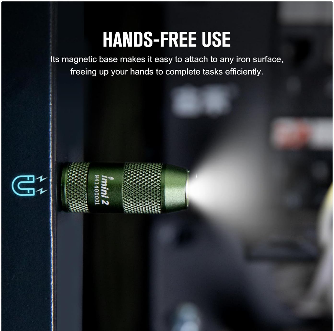
Image: The IMINI 2 flashlight magnetically attached to a metal surface, providing hands-free lighting.

Its magnetic base makes it easy to attach to any iron surface, freeing up your hands to complete tasks efficiently.