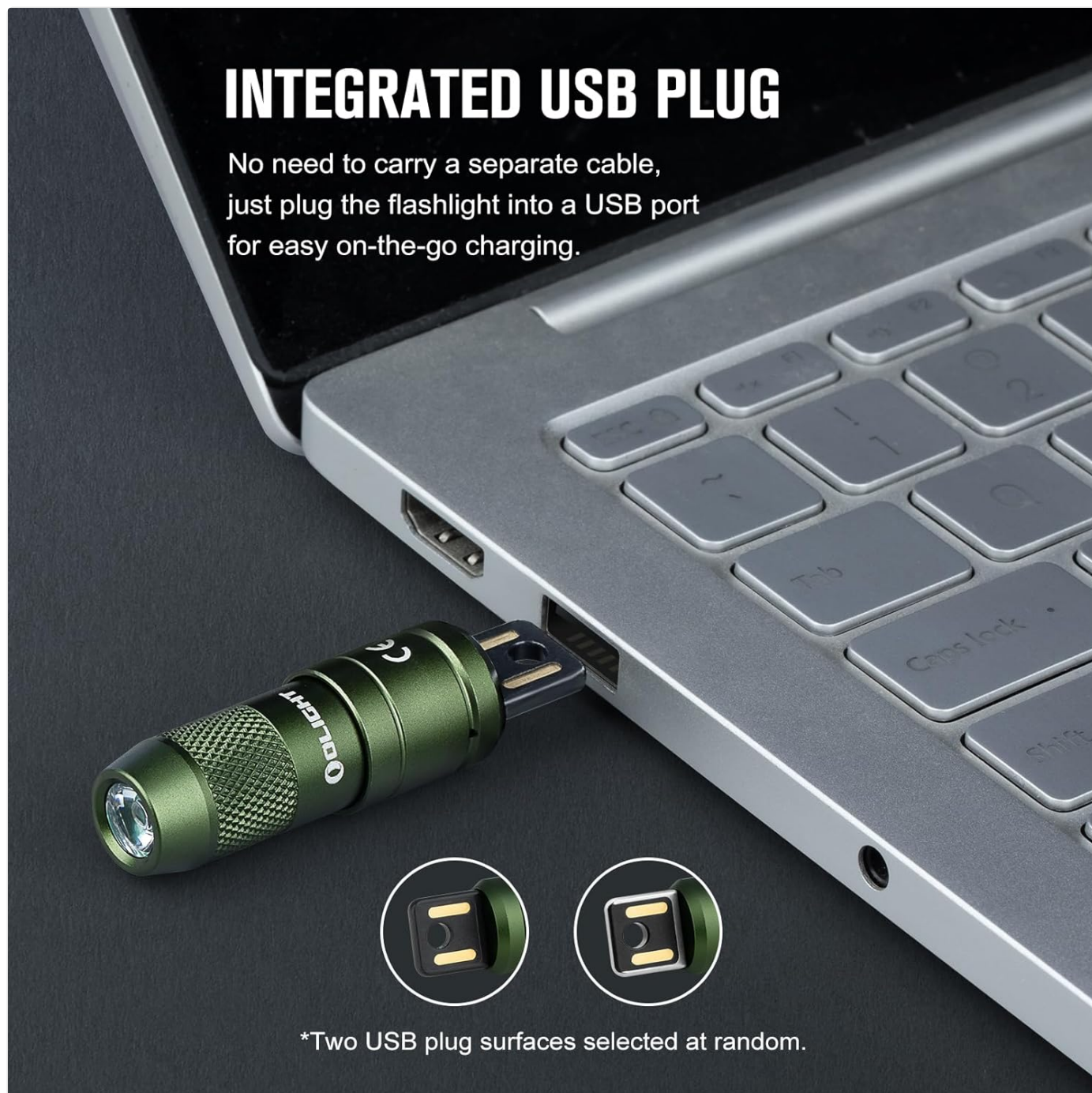
Image: The IMINI 2 flashlight with its integrated USB plug inserted into a laptop's USB port for charging.