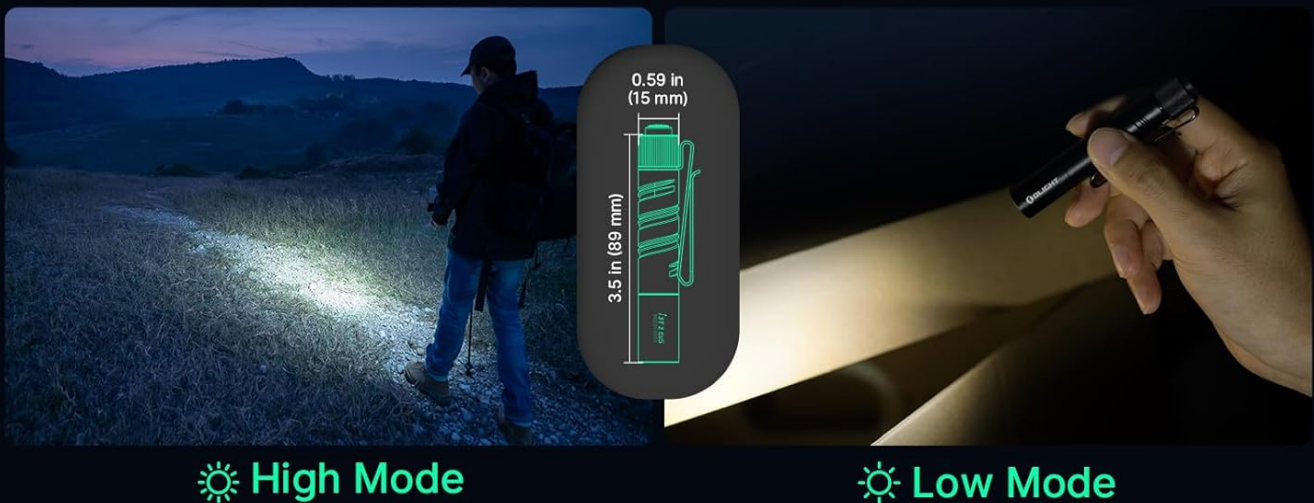
Image: The I3T 2 EOS flashlight demonstrating its high and low brightness modes in an outdoor setting.

The i3T 2 delivers an output up to 200 lumens, offering both constant and momentary-on options for various tasks and environments. It can be initially powered on in low or high mode depending on your needs.