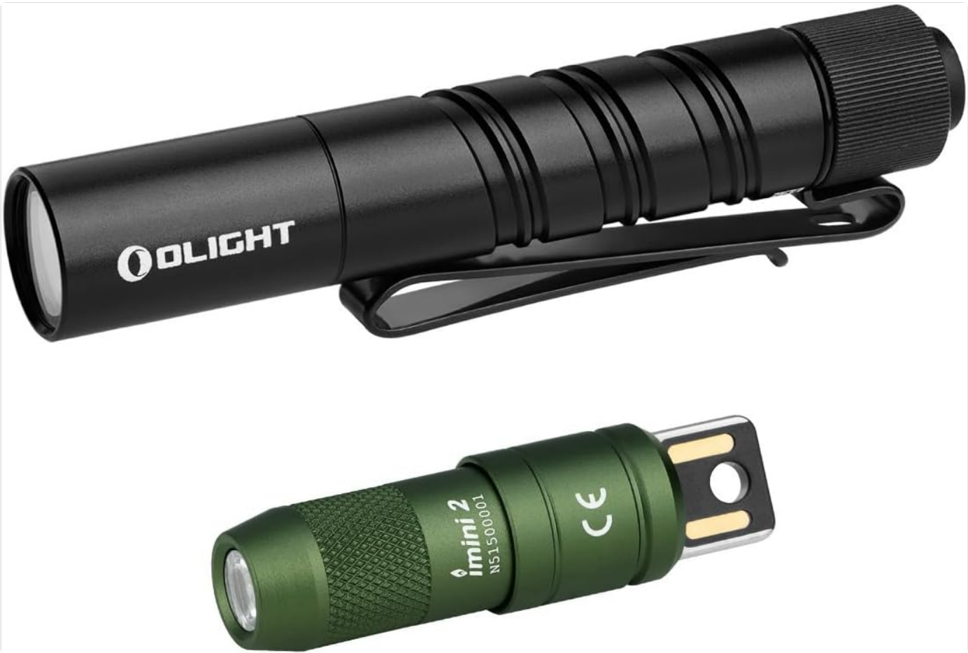
Image: The OLIGHT IMINI 2 (bottom, green) and OLIGHT I3T 2 EOS (top, black) flashlights included in the bundle.