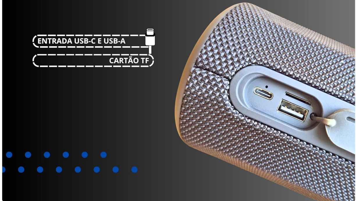
Figure 3: Side panel revealing the protective cover for the USB-C charging port, USB-A port for media playback, and TF (MicroSD) card slot.