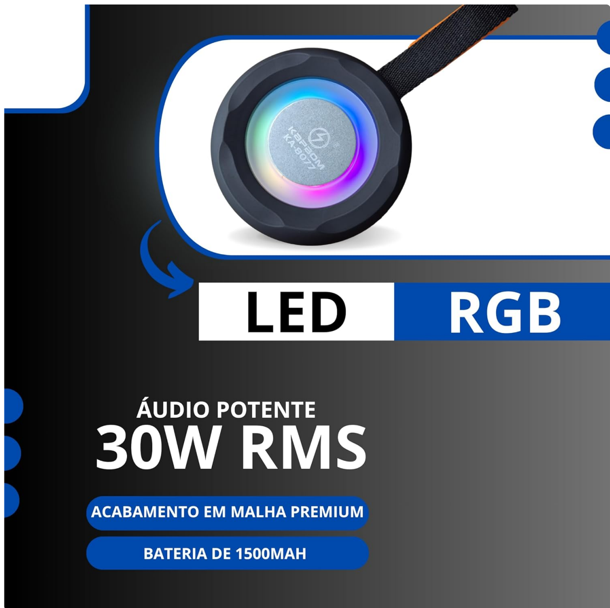
Figure 4: The speaker features dynamic RGB LED lighting that synchronizes with your music, enhancing the listening experience. It delivers a powerful 30W RMS audio output.