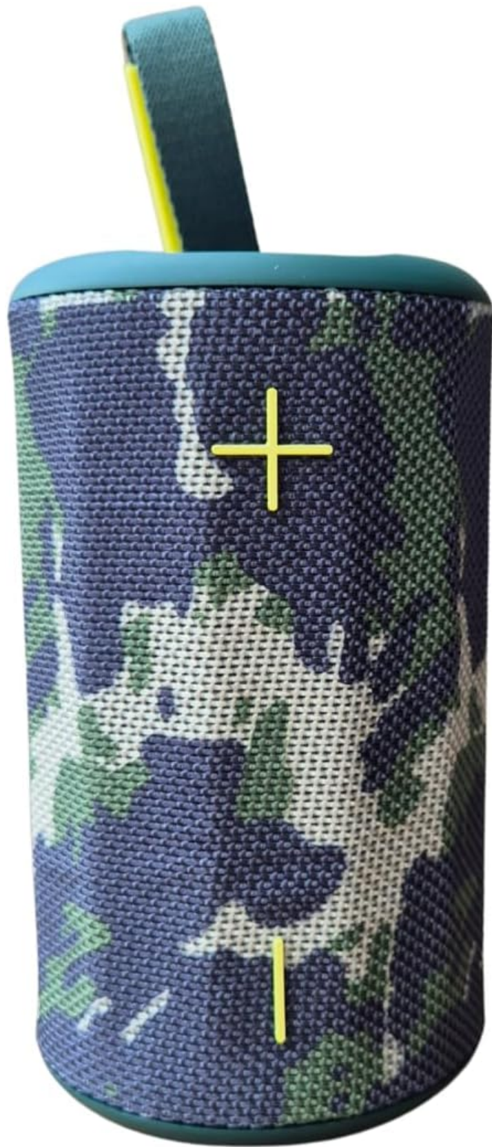
Figure 1: Front view of the KA-8077 Bluetooth Speaker, highlighting its mesh finish and portable design.